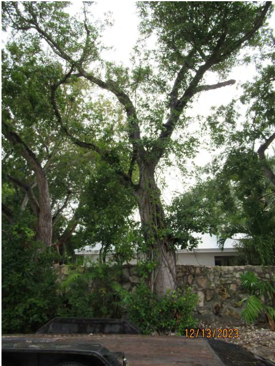
Photo showing whole tree, view 1.

Tree Species: Strangler Fig ( Ficus aurea )