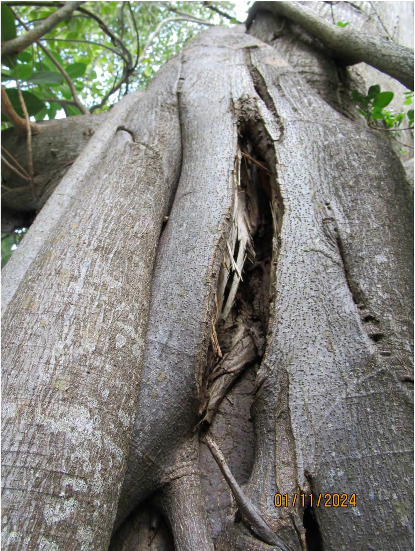
Photo of tree trunk showing second decay area.