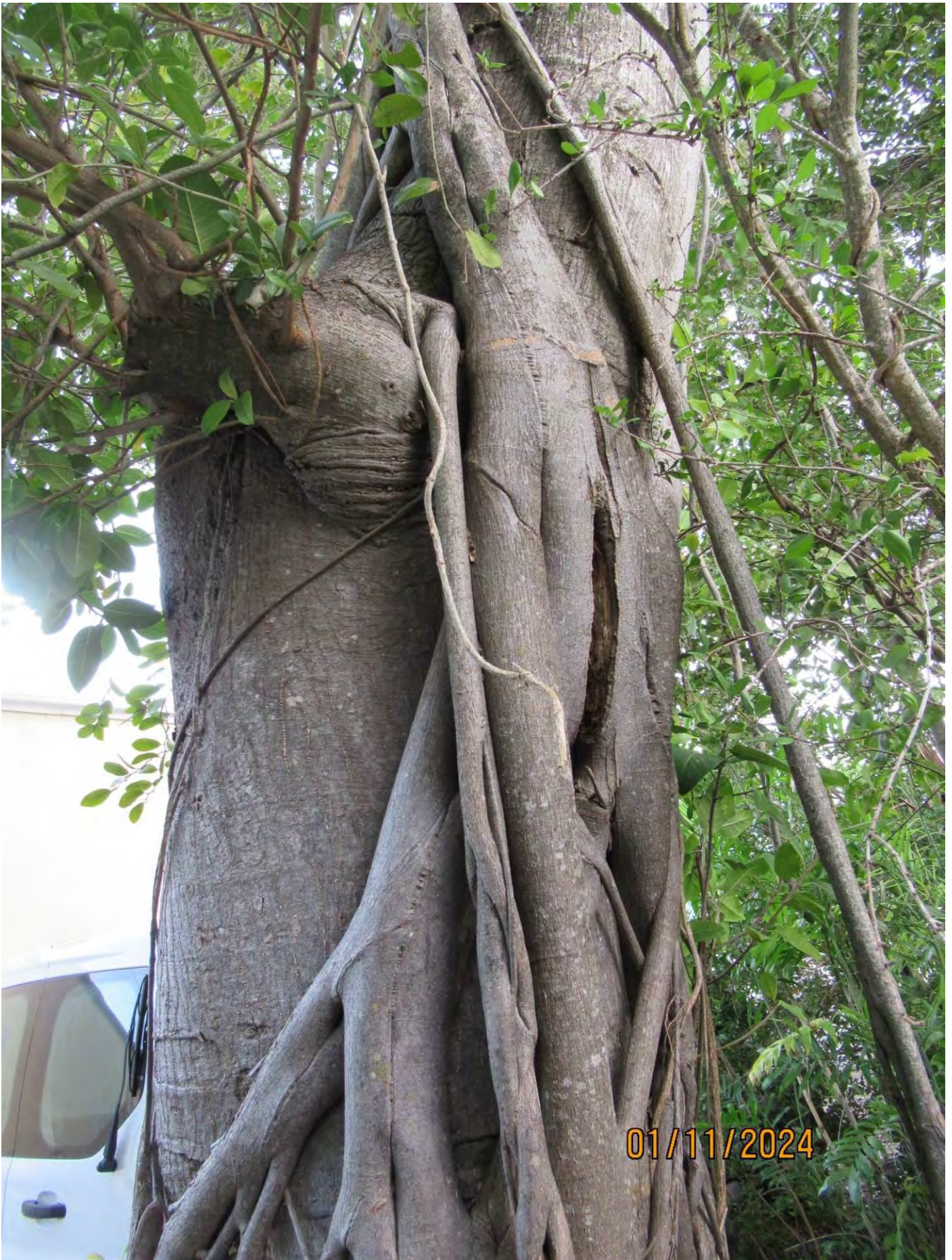
Photo of tree trunk as seen from Seminary Street, view 3.