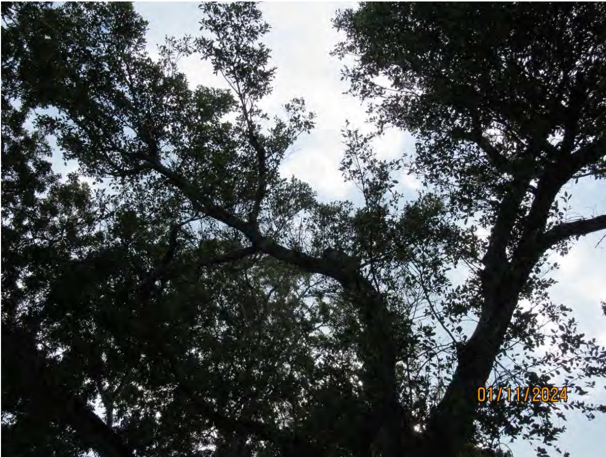
Two photos of tree canopy taken from Seminary Street, view 1 & 2.