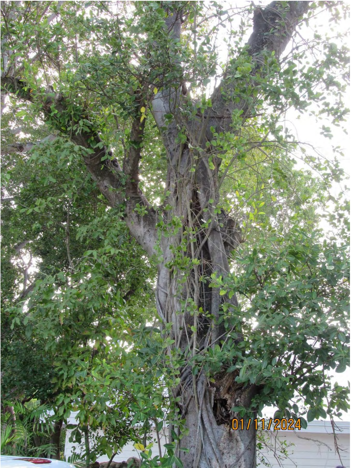
Photo of tree trunk as seen from Seminary Street, view 1.