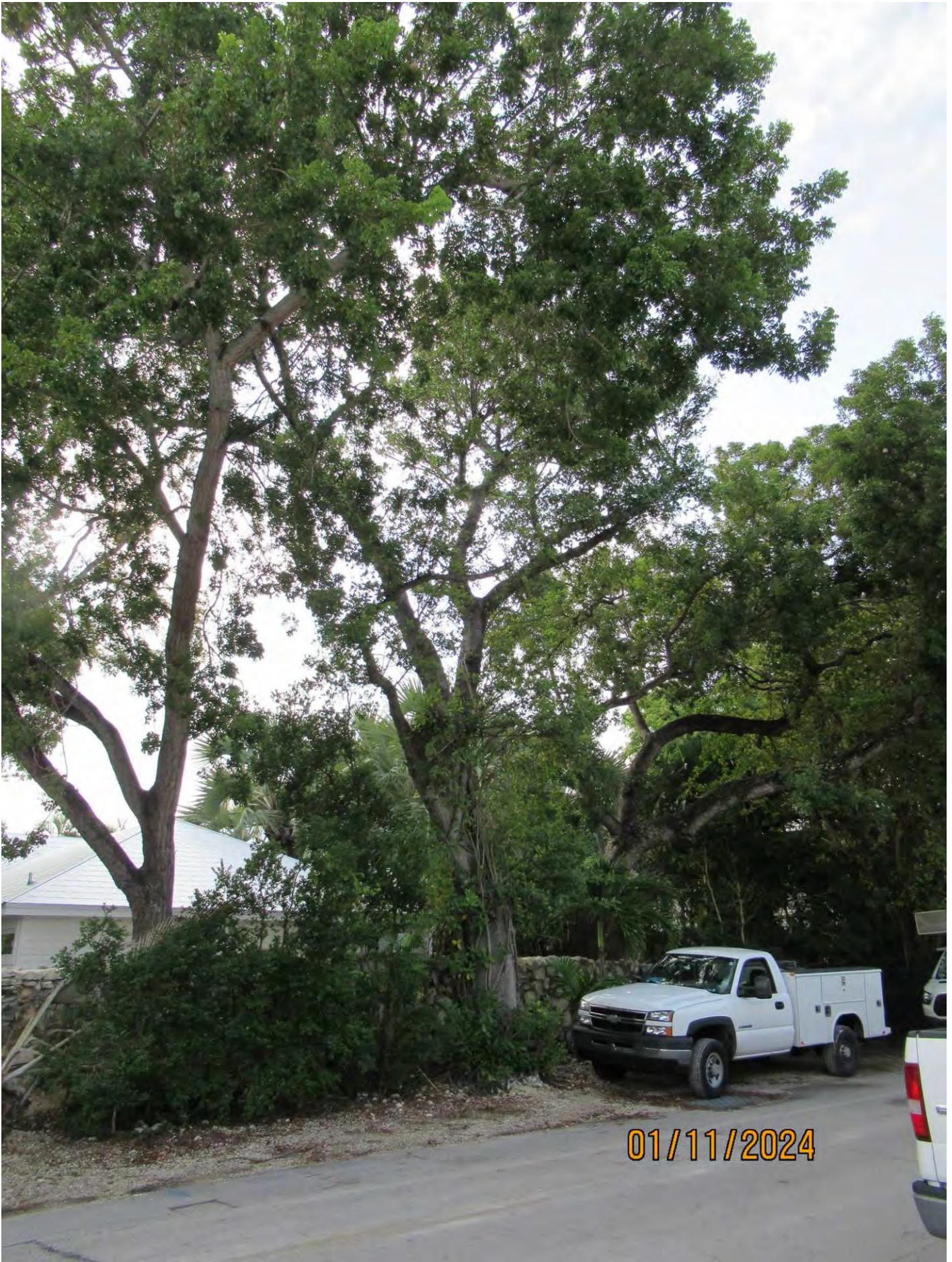
Photo of whole tree, view 3.