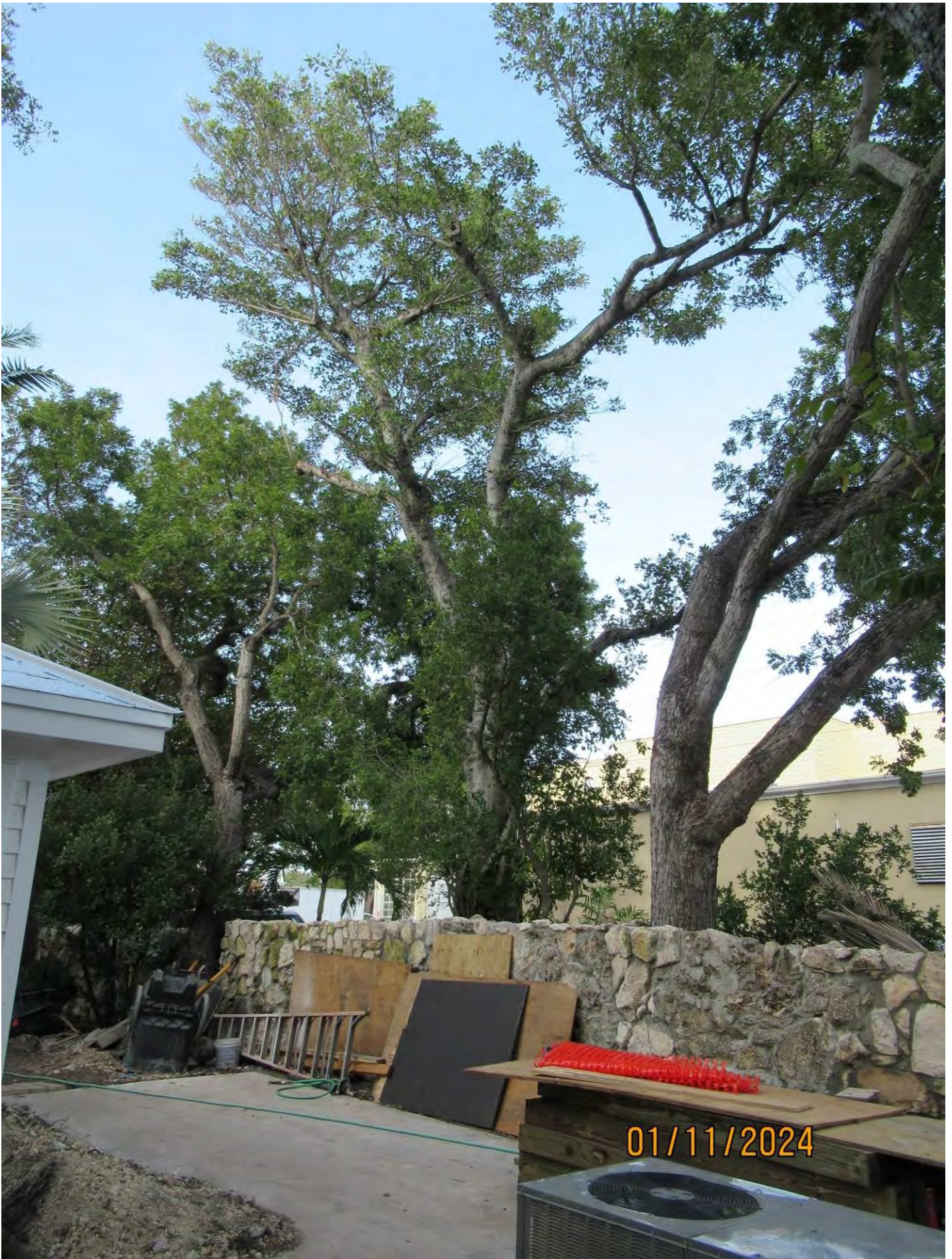
Photo of whole tree, view 4. Photo taken from Tropical Street.