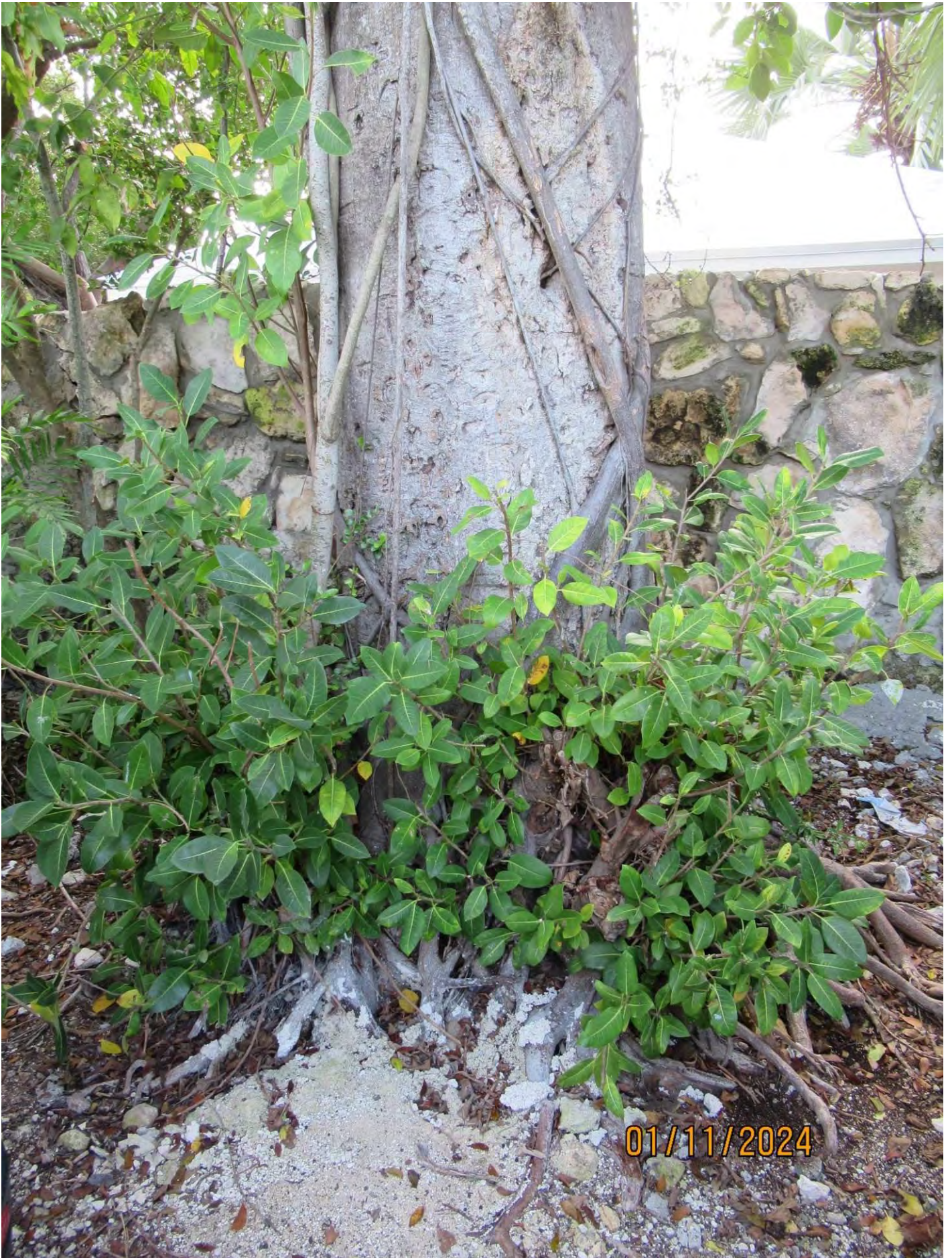
Photo of base and trunk of tree.