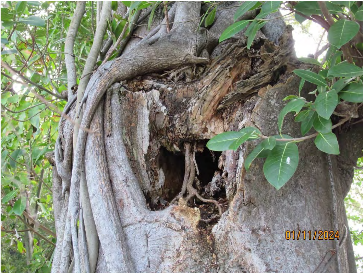
Close up photo of large decay area in main trunk.