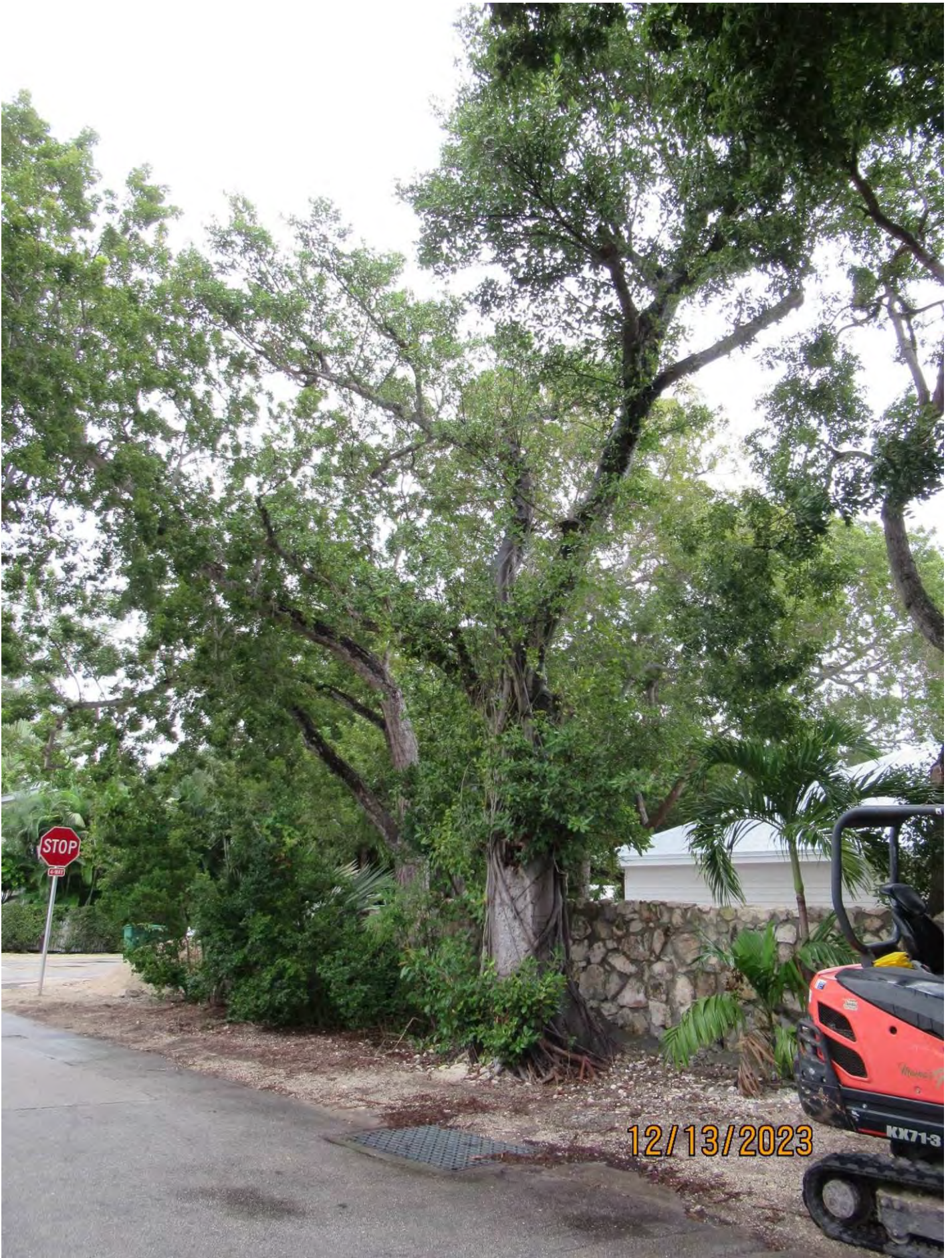
Photo of whole tree, view 2.