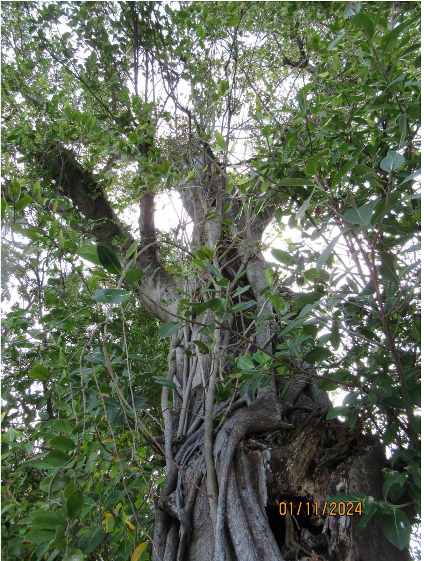
Photo of trunk and canopy branches, view 1.