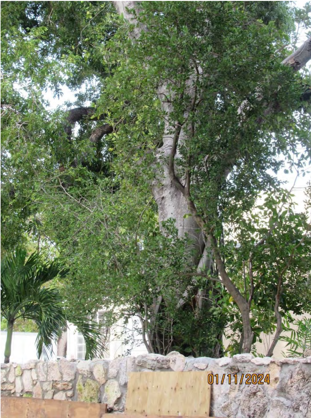
Photo of tree trunk, view 4. Photo taken from Tropical Street.