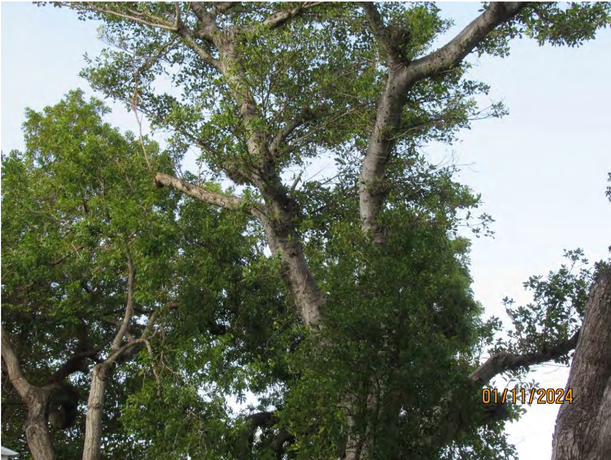
Two photos of tree canopy, views 3 & 4. Photos taken from Tropical Street.