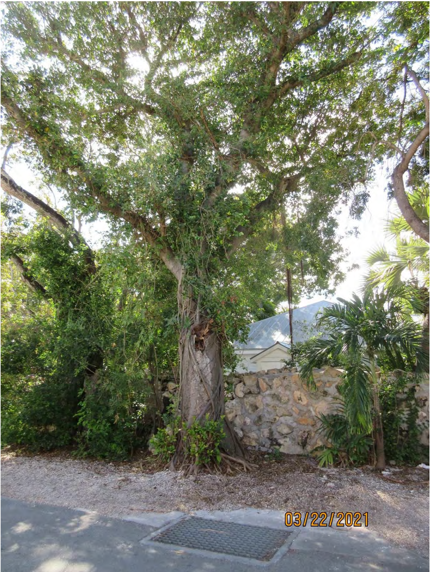
Photo of whole tree taken in 2021.