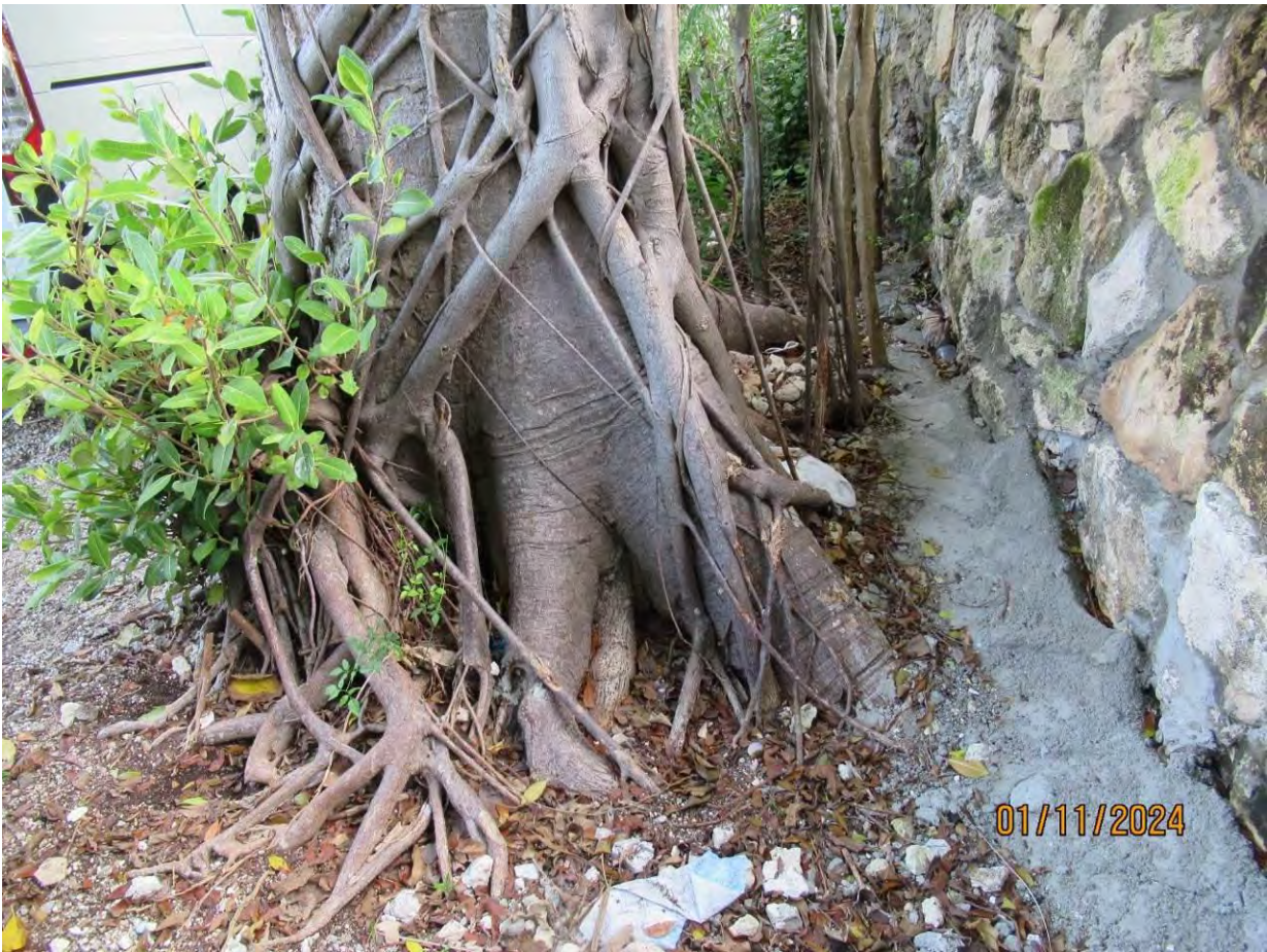
Photo of base of tree in relation to property line.