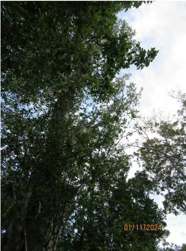
Two photos of tee trunk and canopy branches, view 2 & 3.