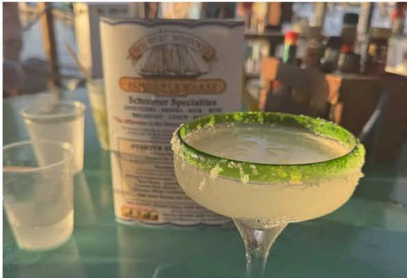
A margarita at Schooner Wharf Bar in Key West's Historic Seaport