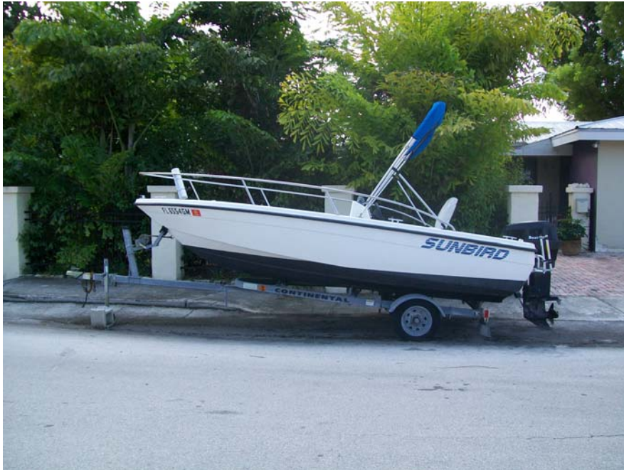
20 foot length X 8 feet wide