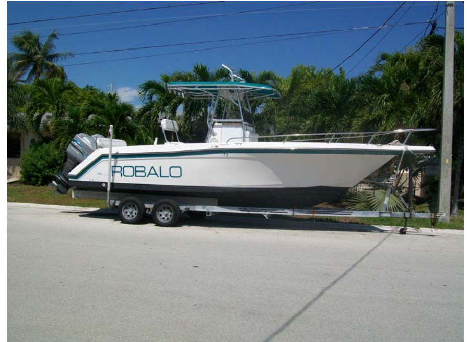
32 foot length X 10 feet wide