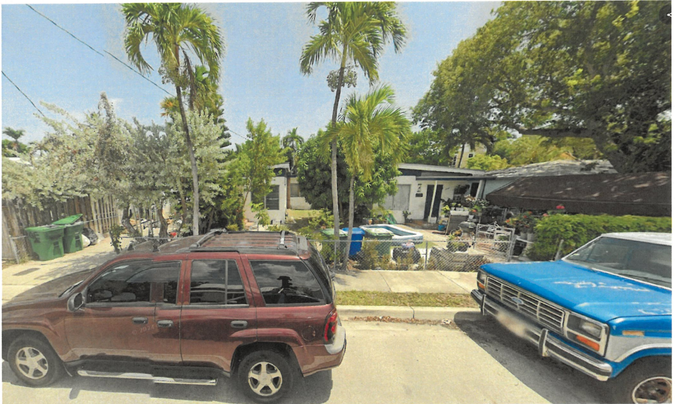
Google Streetview of 1228 Flagler Ave from August 2022.

Factual allegation: (1) Silver Buttonwood, (1) Green Buttonwood, (1) Mango Tree, and at least (2) palms greater than 10ft in height were removed during the demolition of a duplex without a permit from Urban Forestry/ the Tree Commission.