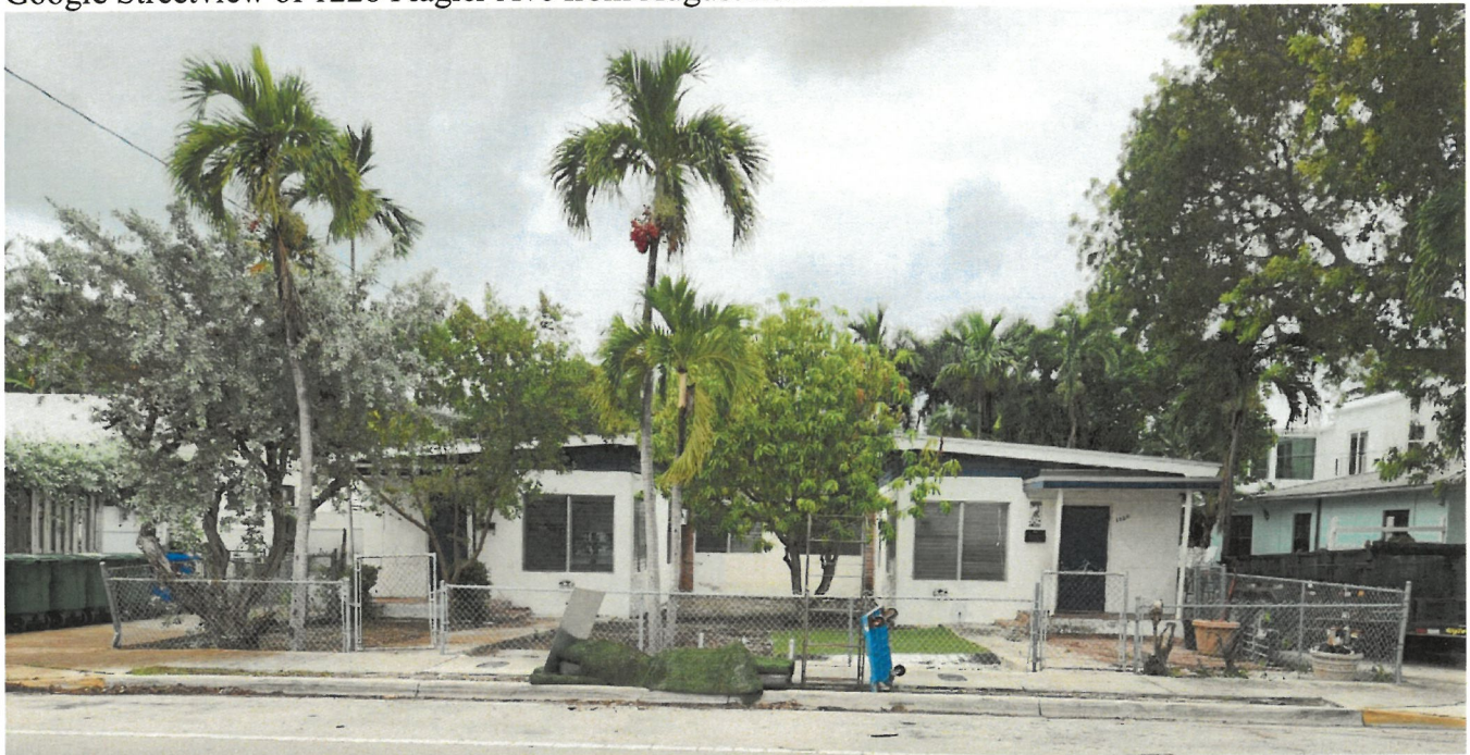
A photo provided for the review of BLD2025-0586 for the construction of a new 2-family home. This is prior to the duplex being demoed.