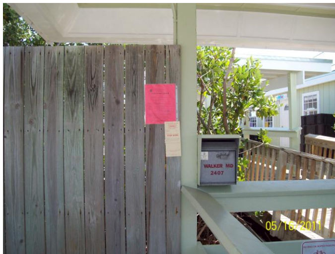
Stop Work Order placed 5-16-11