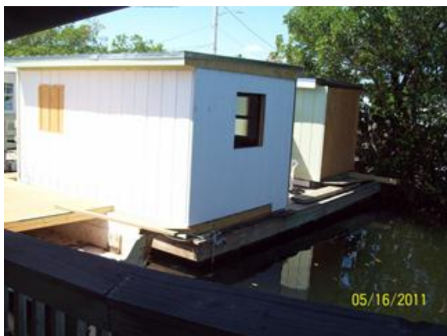
Rear Buildings 2 and 3