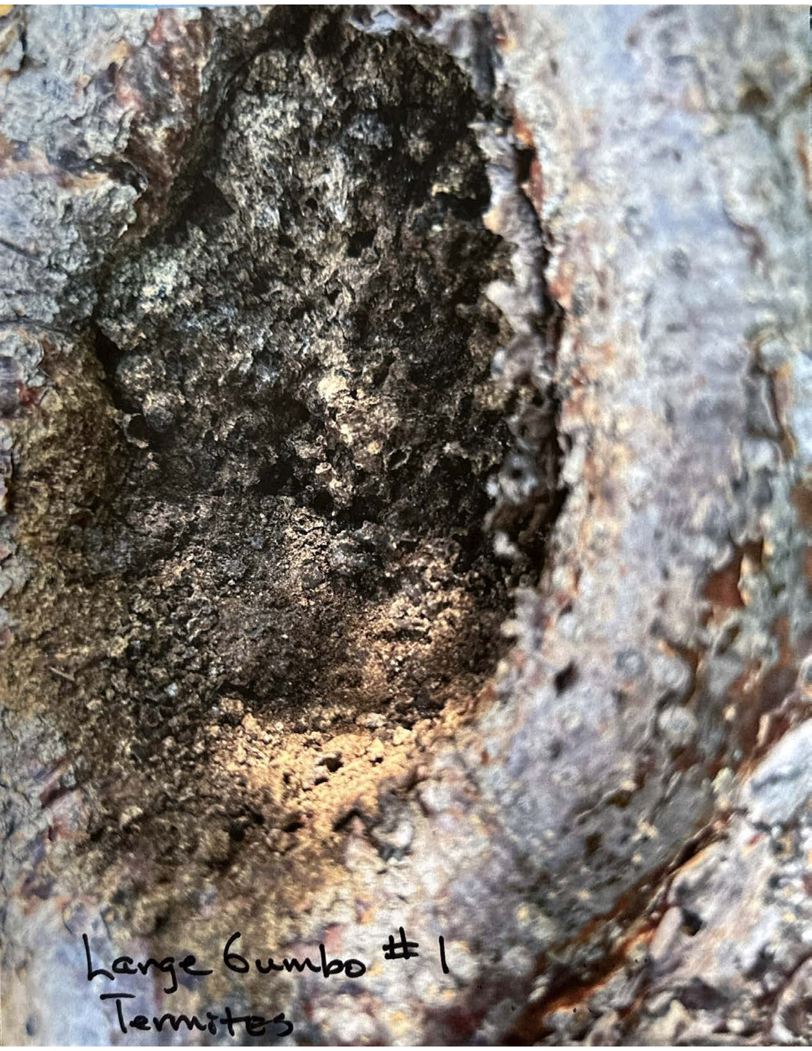
Large Gumbo #1 Termites