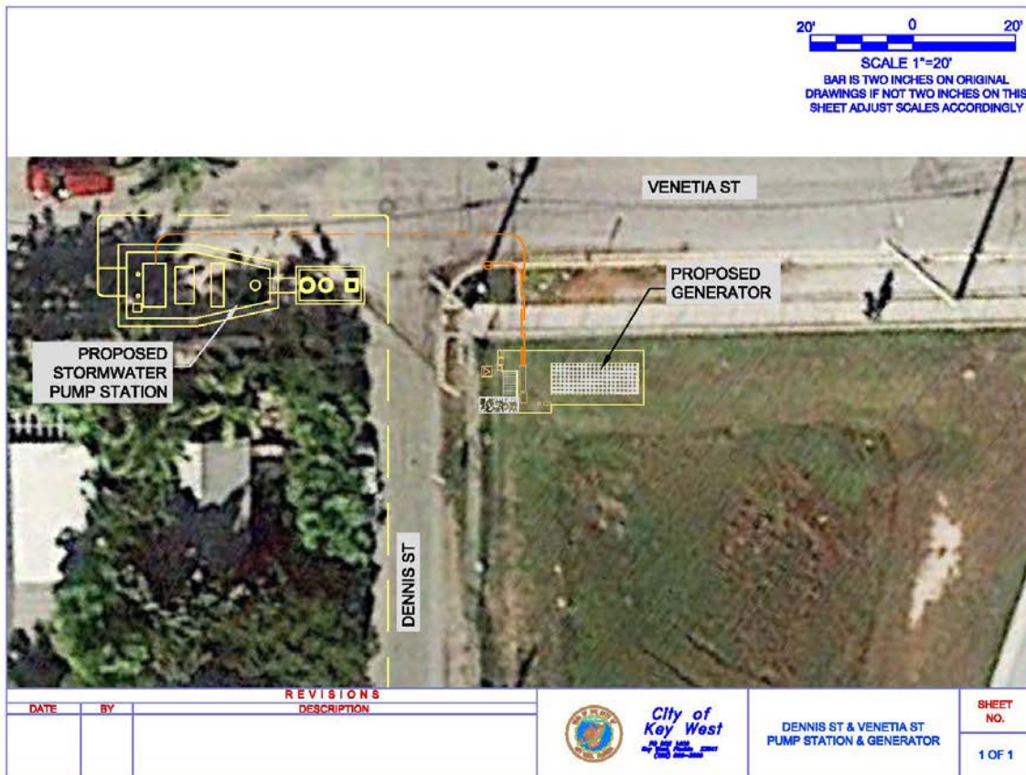
Figure 1. Site Plan

Note that, per paragraph 4 of the agreement, authorization for continuation and completion of work and any associated payments may be rescinded, with proper notice, at the discretion of the Department if the Legislature reduces or eliminates appropriations. Extending the contract end date carries the risk that funds for this project may become unavailable in the future. This should be a consideration for the Grantee with this and future requests for extension.