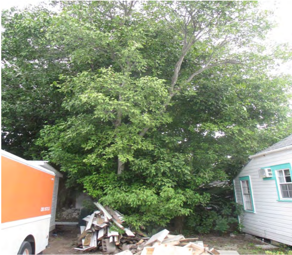
Tree # 2