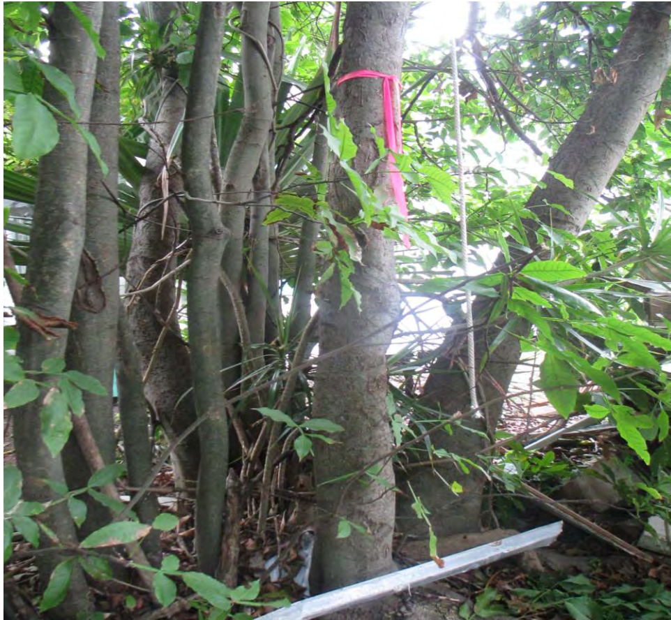
Tree # 2

Diameter: Tree # 1 – 8 inches dbh Tree # 2 – 7.5 inches dbh Total 15.5 inches dbh