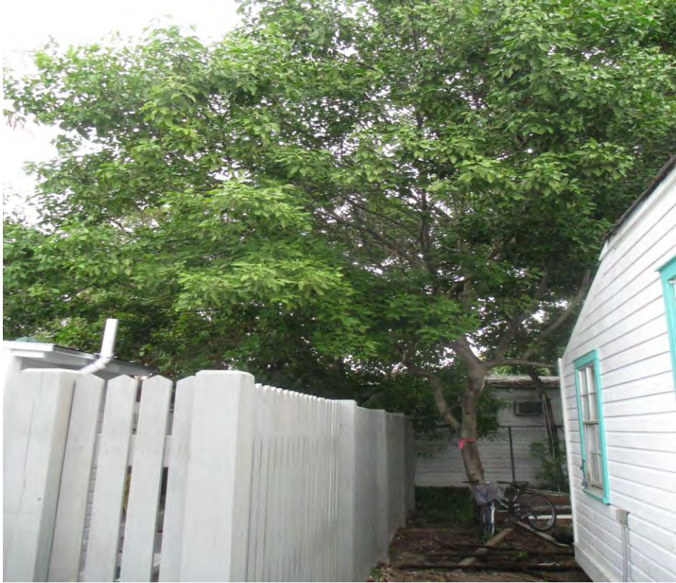
Tree # 1