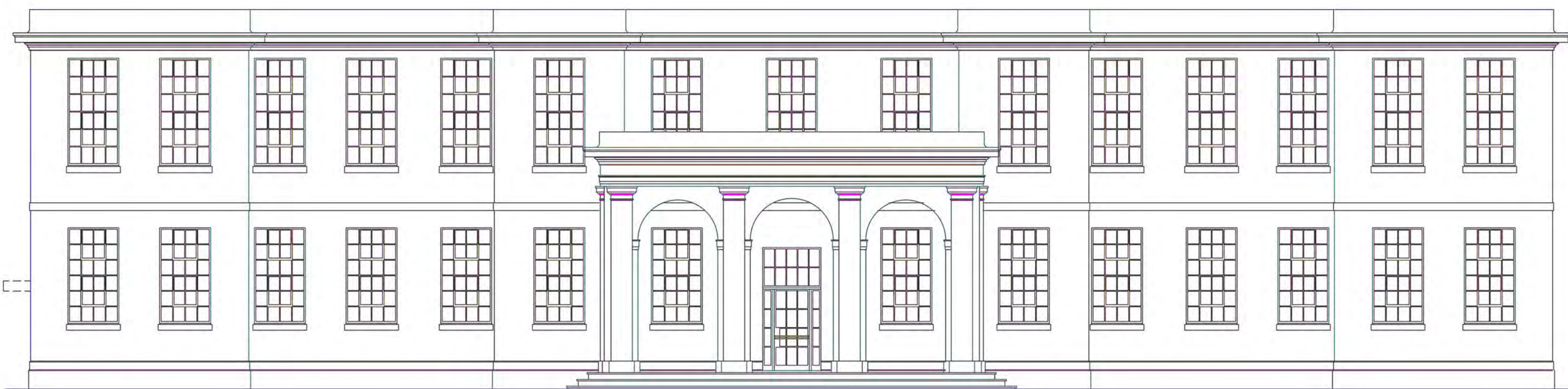
E.H. Gato Cigar Factory