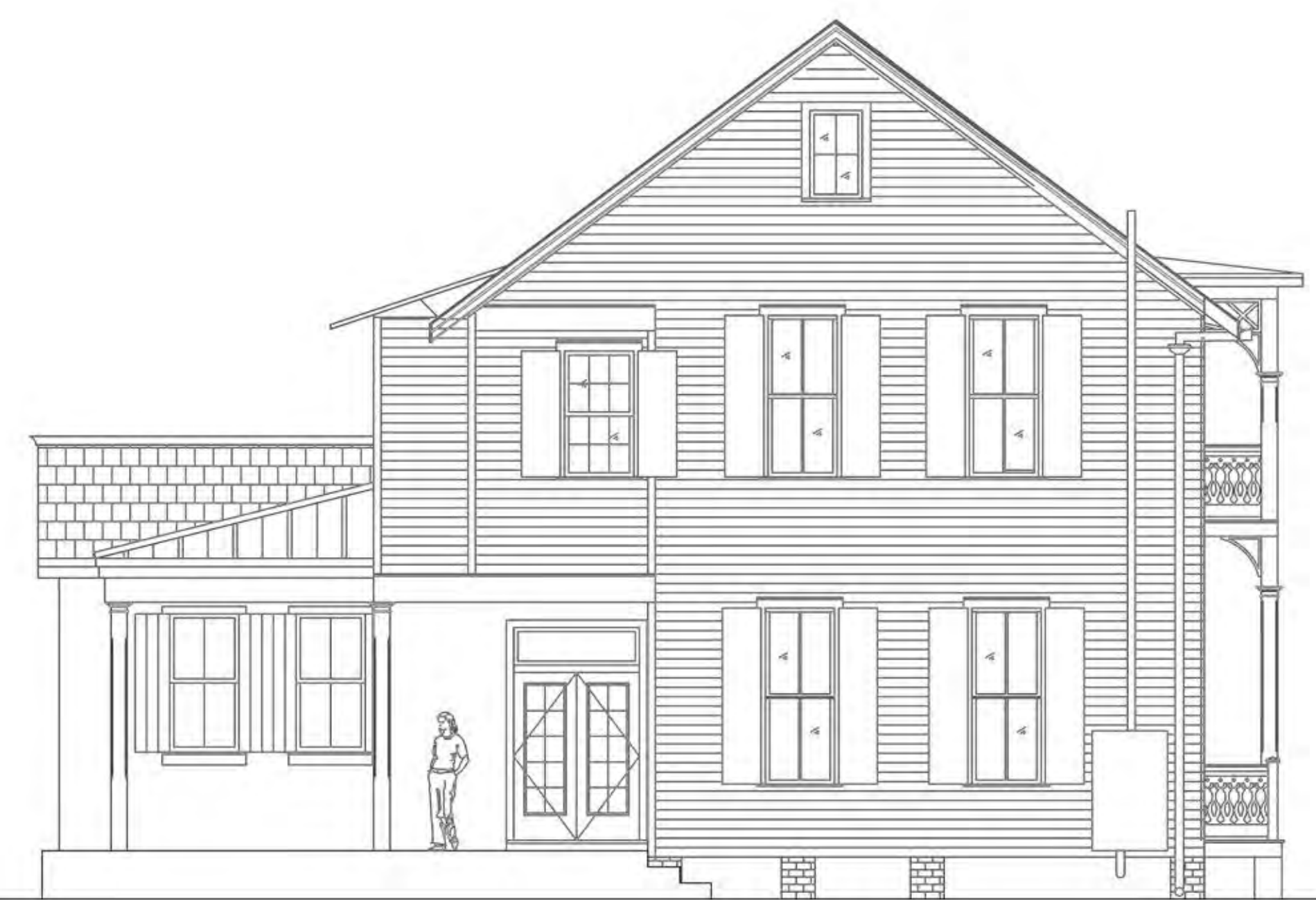
426 Elizabeth Street

616 Eaton Street Composite Elevation from HARC submittal 7-10-15 All Buildings are shown at the same scale