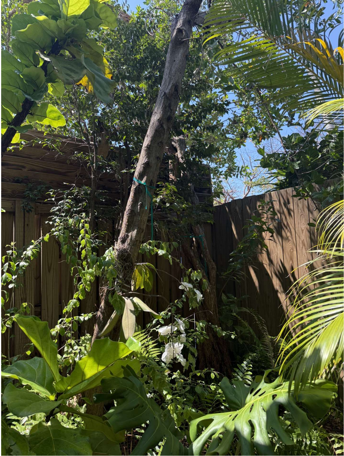
Two of the Buttonwoods