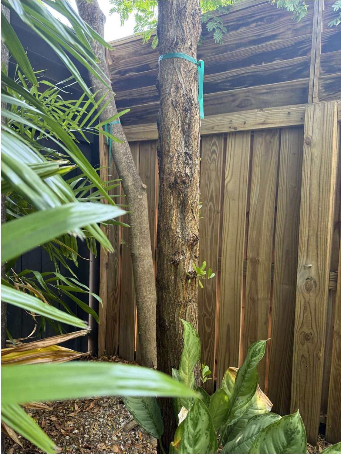
Buttonwood & Poinciana