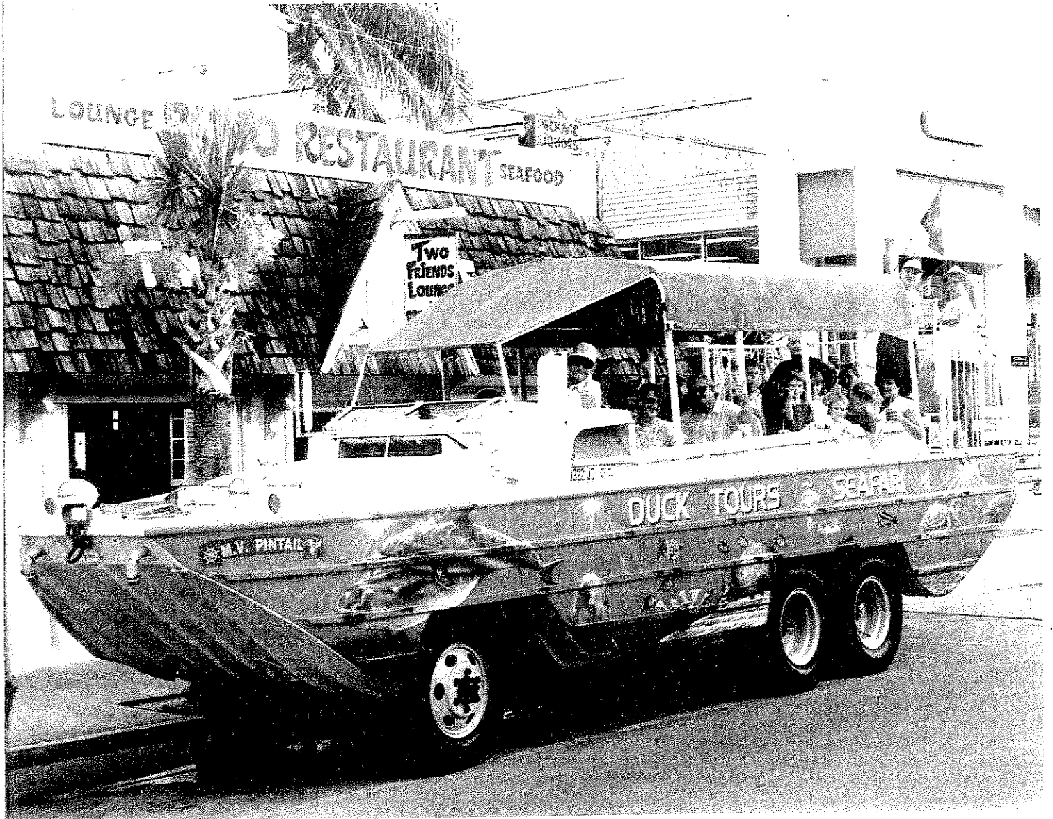
EXHIBIT tabbles® A