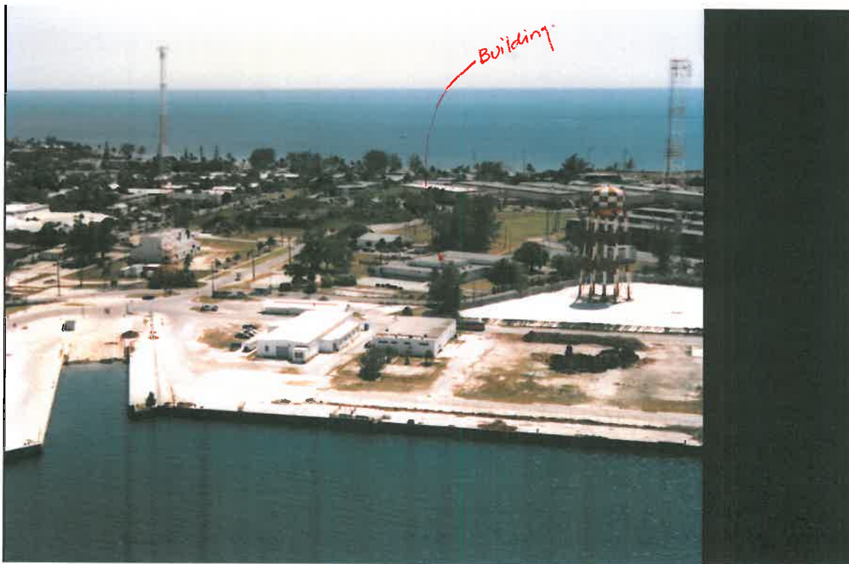
The marine way, building and water tower on NAS Key West's Truman Annex C 2000.