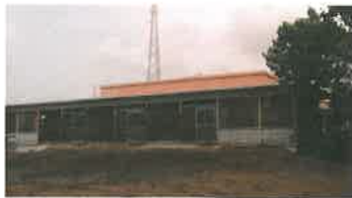
West Elevation (Horse Area) 2