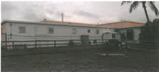
West Elevation (Horse Area) 1