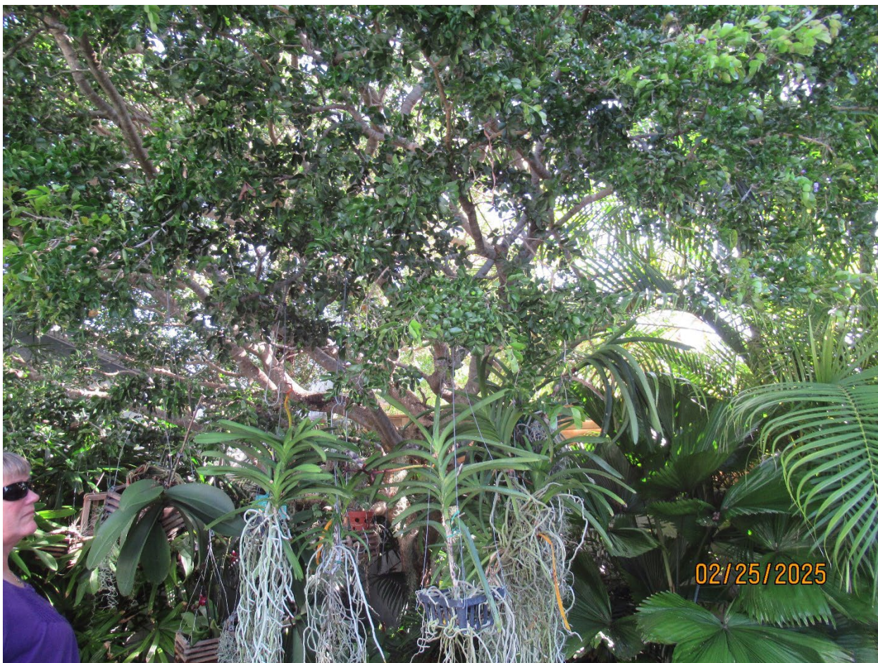
A photo of the tree overall with orchids hanging from it, and a photo of the trunks and branches