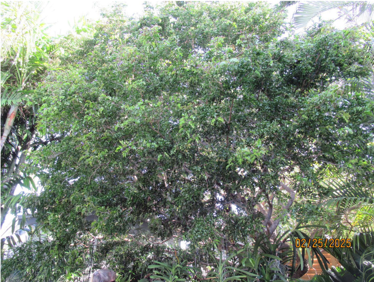
A photo of the large canopy