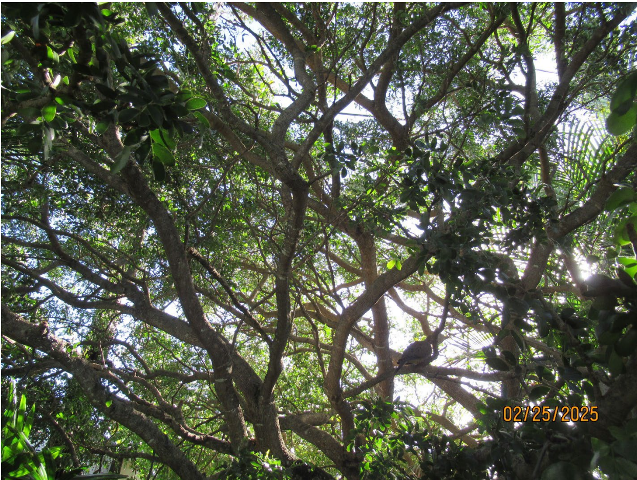
A photo looking up at the canopy