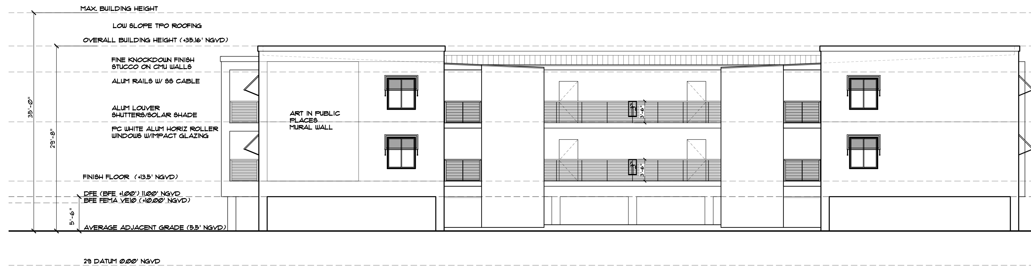
Parking Side Elevation