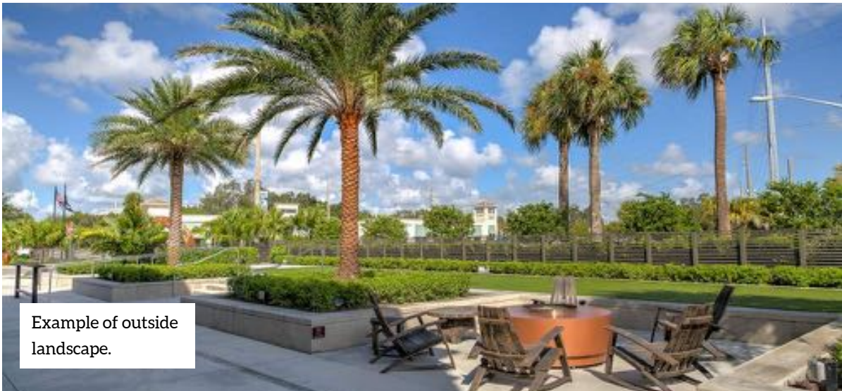
Example of outside landscape.