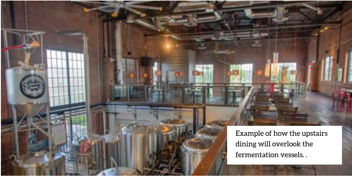
Example of how the upstairs dining will overlook the fermentation vessels .