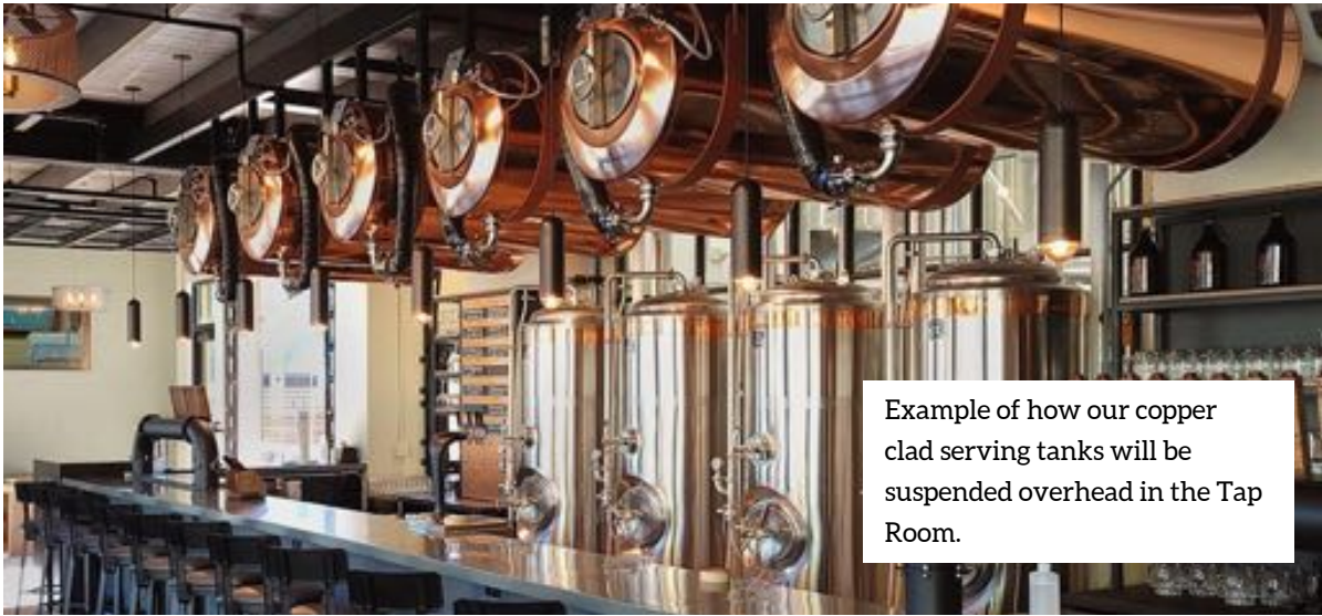
Example of how our copper clad serving tanks will be suspended overhead in the Tap Room.