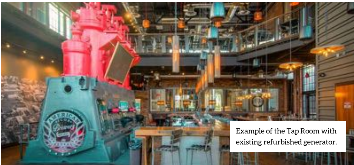
Example of the Tap Room with existing refurbished generator.

The Vero Beach Diesel Power Plant (also known as the City of Vero Beach Municipal Power Plant) is a historic power plant in Vero Beach, Florida located in downtown Vero Beach on a 2-acre site. The power plant was built in 1926 replacing an earlier power plant due to the area's extensive growth. It was built in the masonry vernacular style by architects Carter and Damerow and by the engineering firm, Kennard and Sons.