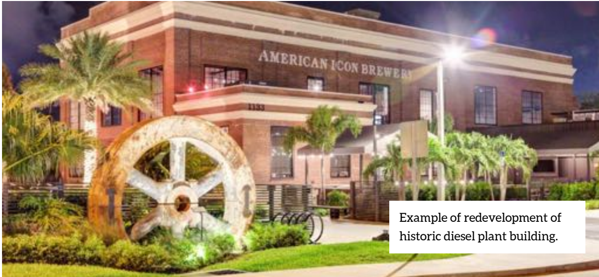
Example of redevelopment of historic diesel plant building.

American Icon Brewery in Vero Beach, FL is a similar historic renovation project of a former diesel plant.