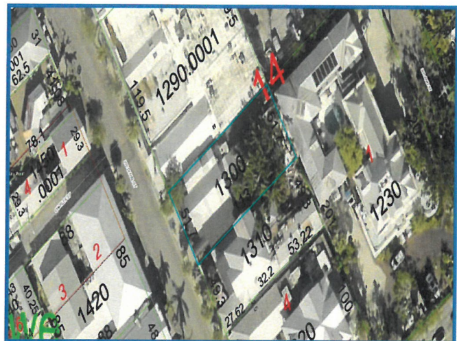
Satellite Image showing parcel outlined in Blue