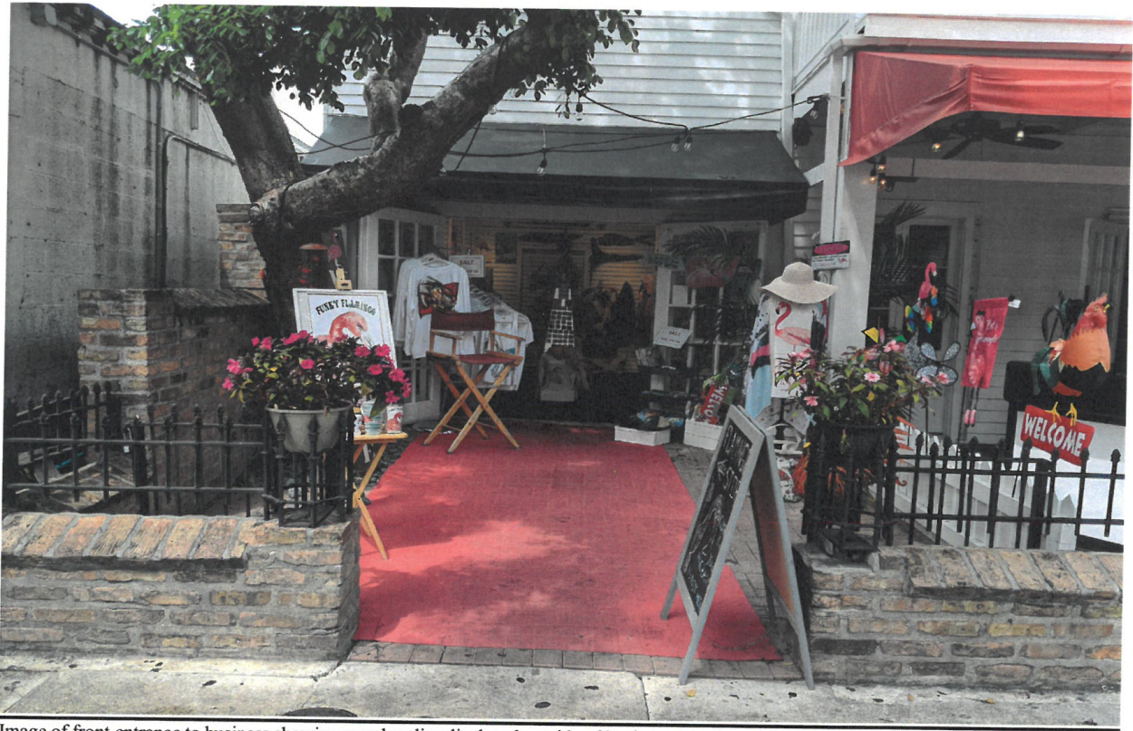
Image of front entrance to business showing merchandise displayed outside of business structure