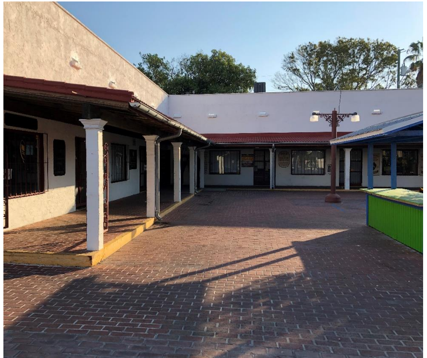
Other store fronts in Kino Plaza with similar architectural features