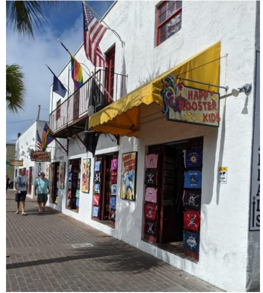
Happy Rooster Store Front