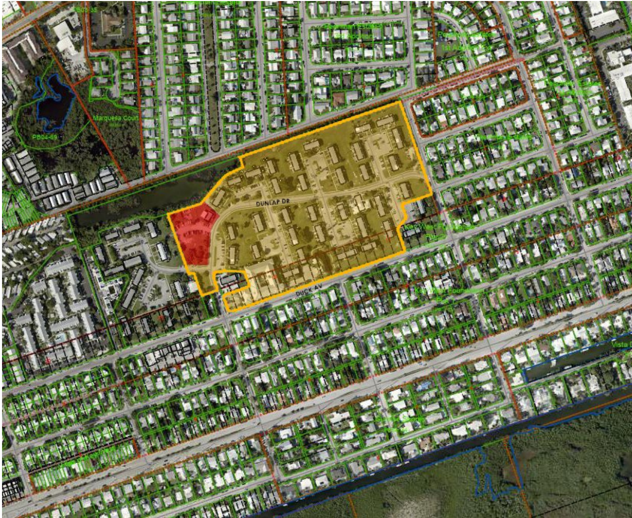
Subject property outlined in orange and the project area is depicted in red.