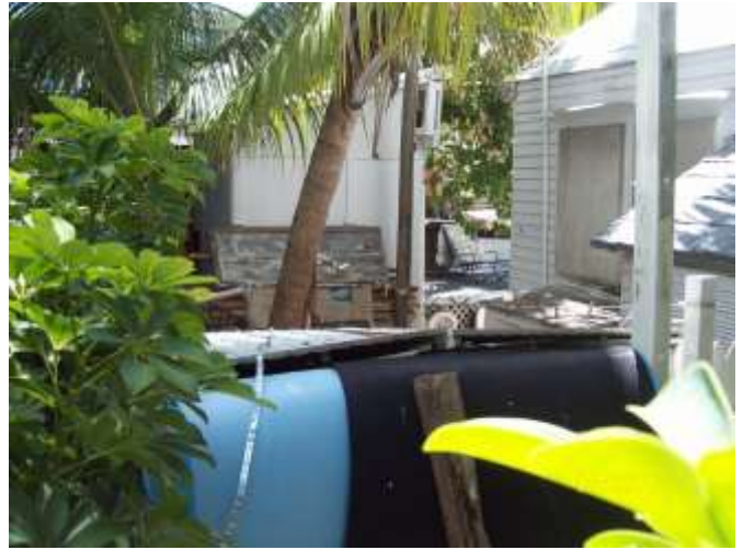
Shed built without permits