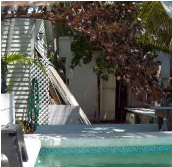
Sec. 14-37 and Sec. 14-40 Shed built without building permits or HARC Approval