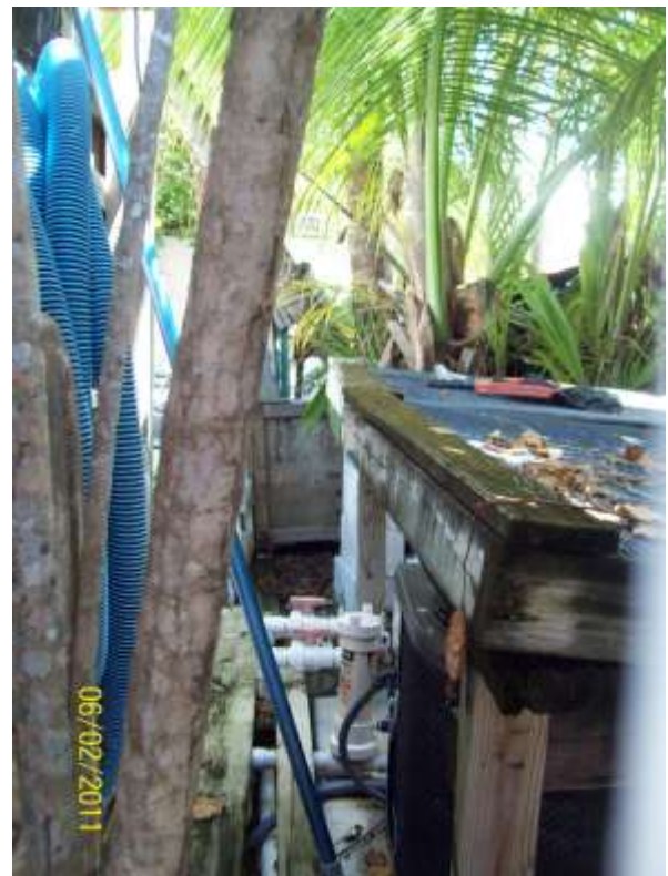
Sec. 14-256 Electrical permit required prior to installation of pool equipment