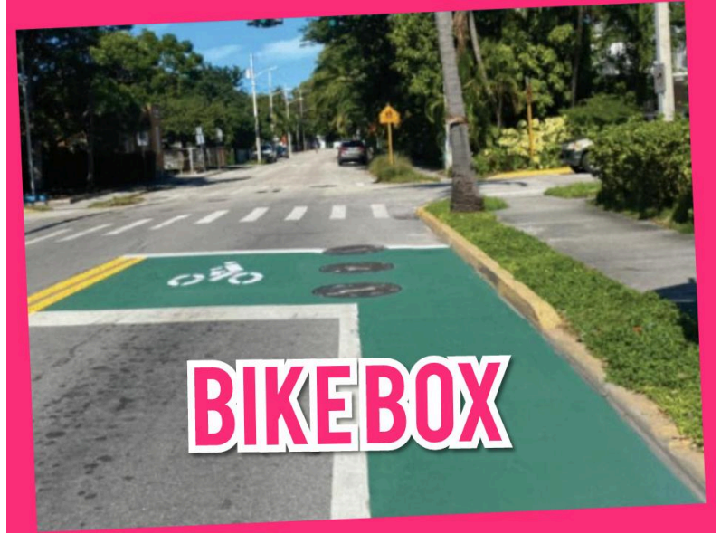
Pictured: Bike Box at Reynolds St and South St: 23.4K