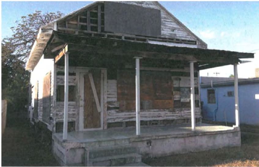
SOUTHEAST ELEVATION (FRONT)