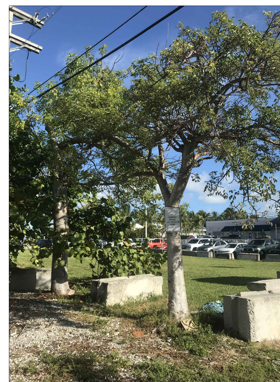
Tree No. 5 & No. 6