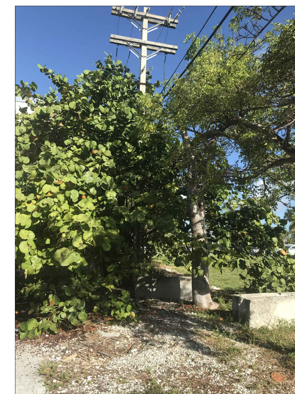
Tree No. 6 & No. 7