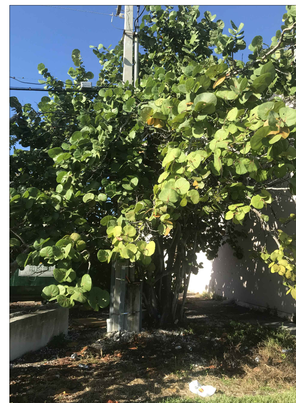
Tree No. 7