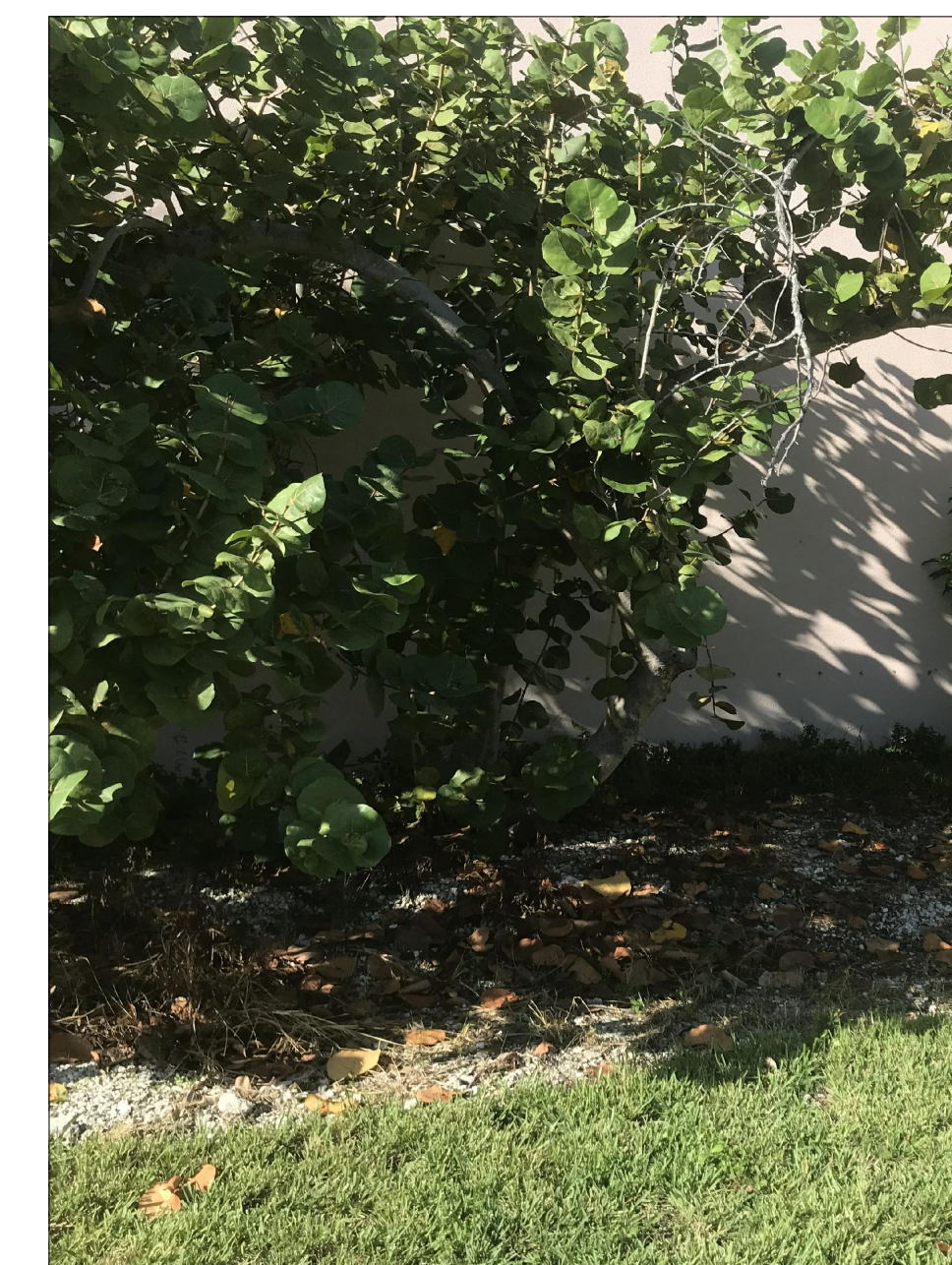
Tree No. 9