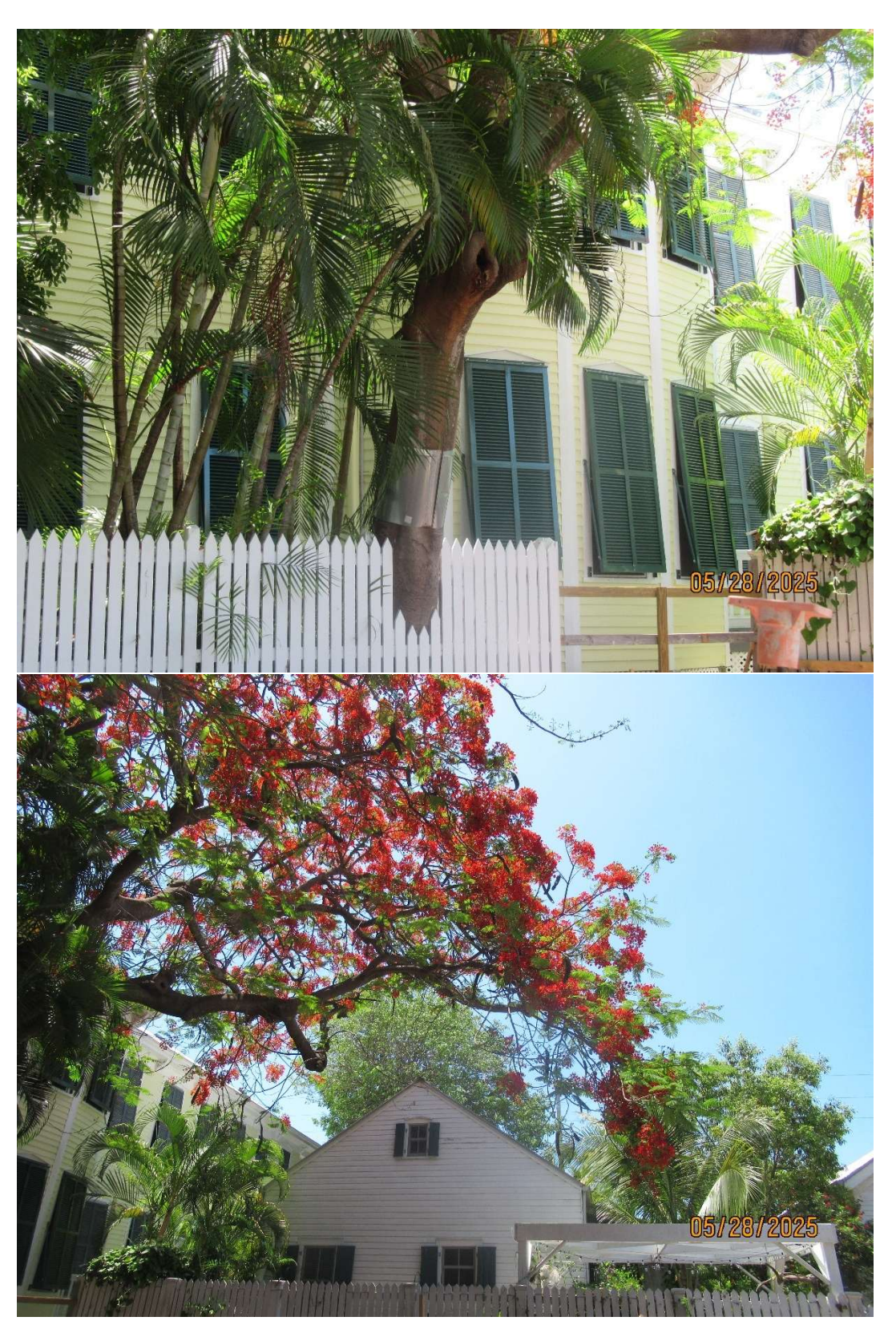
Top photo of trunk leaning Southwest. Bottom photo shows a mature canopy growing exclusively towards the Southwest extending almost 30'