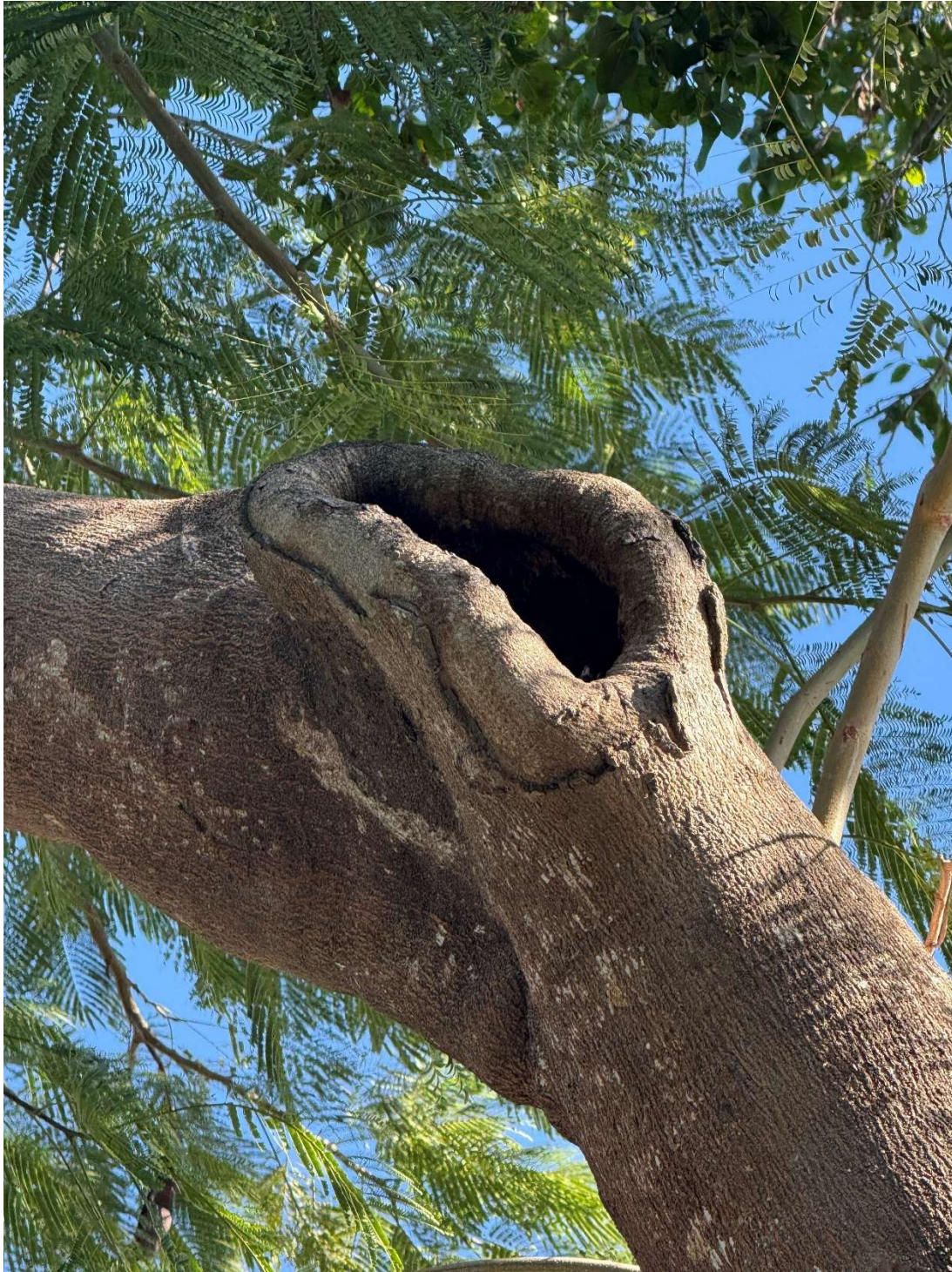
Multiple cavities exposing the tree to infestation and decay.