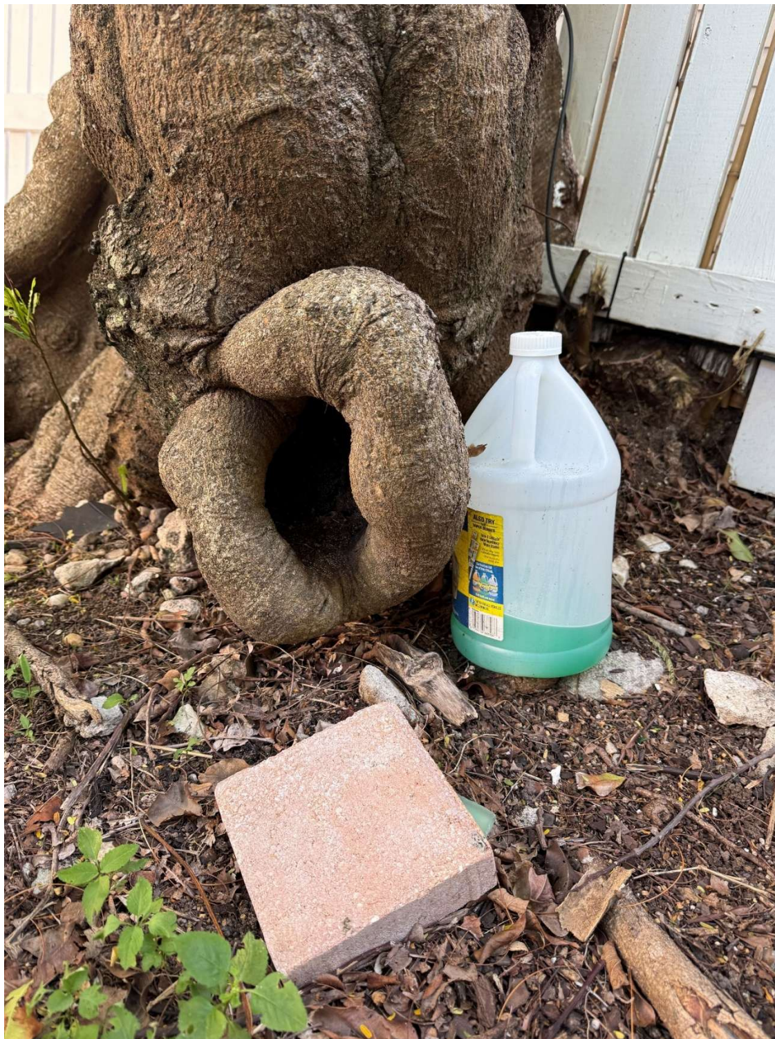
Large basal cavity