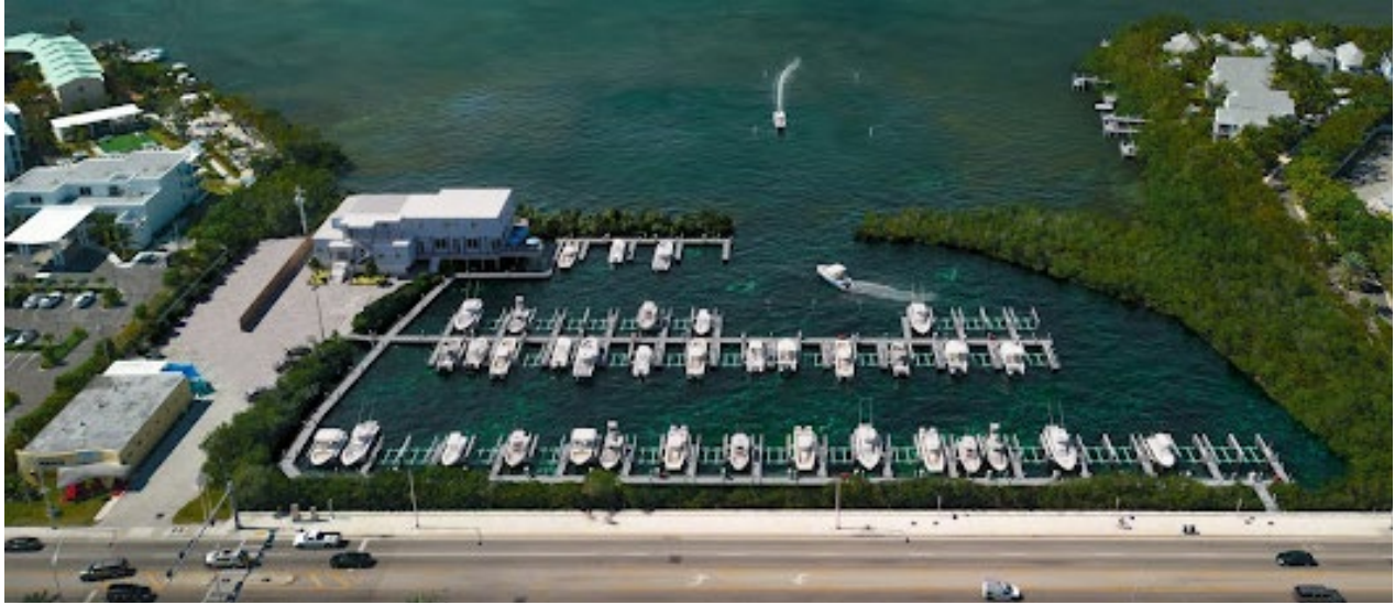
Figure 1 Aerial view of Happy Landings Marina and surrounding mangroves.