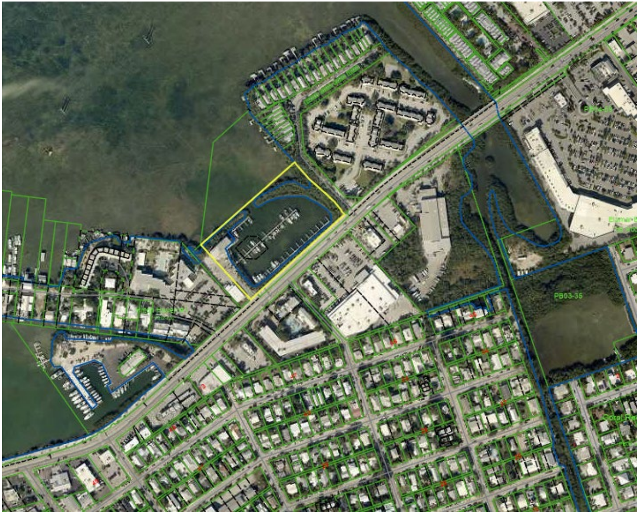
Figure 3 Aerial view of Subject Property highlighted in yellow and surrounding parcels (mirrors view of Zoning Map in Figure 2.)

The property has historically been used for marine and commercial purposes. City records indicate that the site has hosted several uses over time, including an aquarium facility, a marine education program known as Flipper’s Sea School, a restaurant, entertainment uses, and residential units. In 1995, when the property was conveyed by the City to a private owner, correspondence from the City Attorney confirmed that the property could be utilized for commercial purposes and residential units, subject to the issuance of appropriate permits.