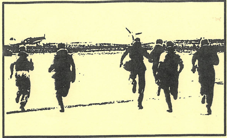
RAF pilots scramble on British Coast

Please remember 3 that we who live here made that choice, in some cases long before restaurants and bars were present.