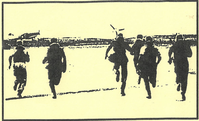
RAF pilots scramble on British Coast