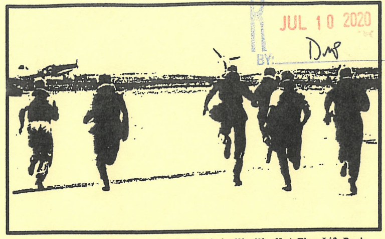
RAF pilots scramble on British Coast

"Courage is never odd, For it always arrives On a new wind".