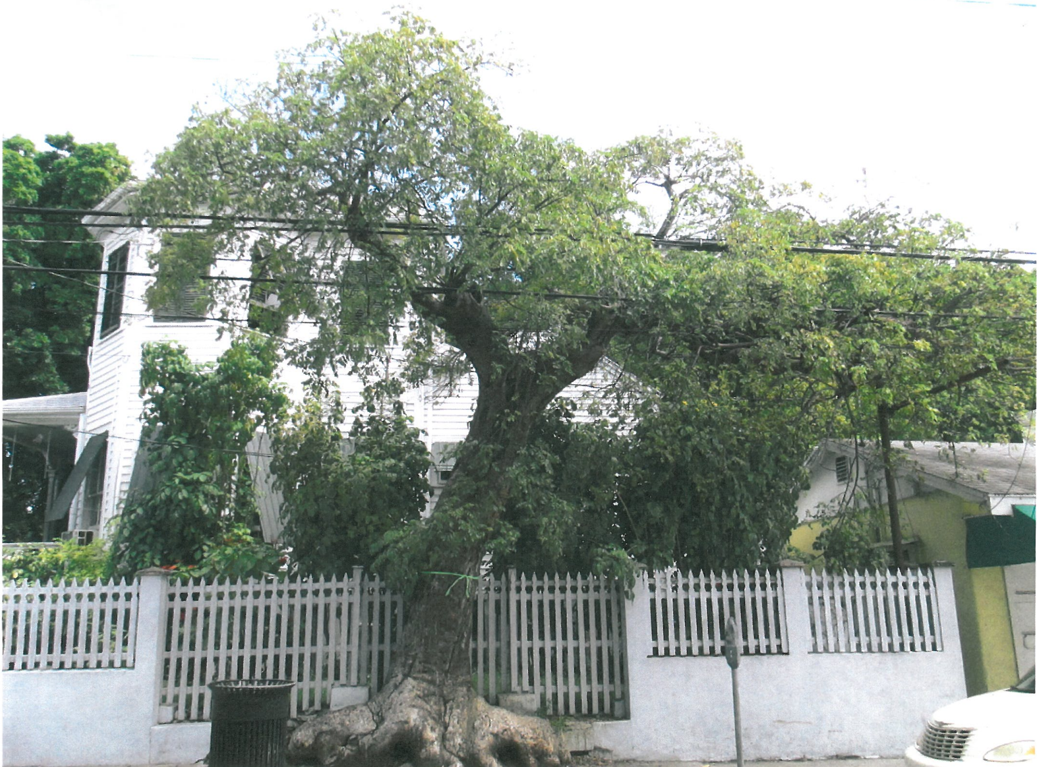
605 SIMMONS STREET 11/20/12