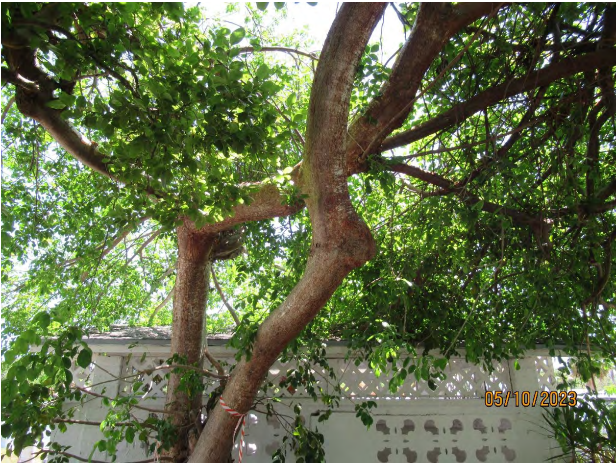
Two photos of tree canopy, views 2 & 3.