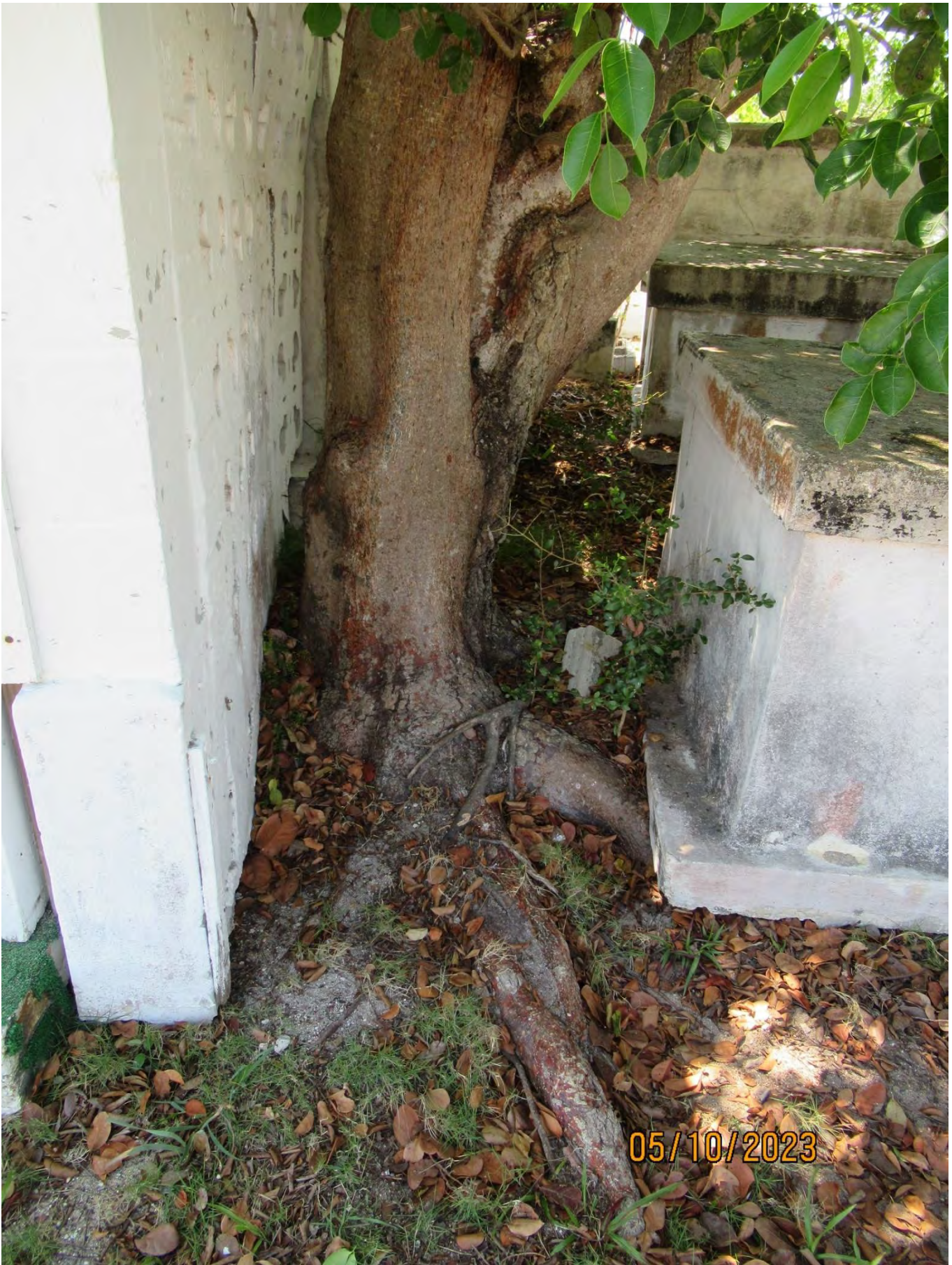
Closeup photo of base of tree, view 1.