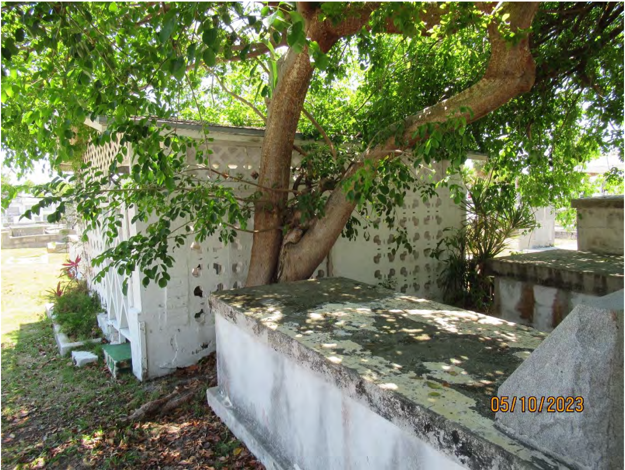
Two photos of tree canopy and trunk, views 2 & 3.