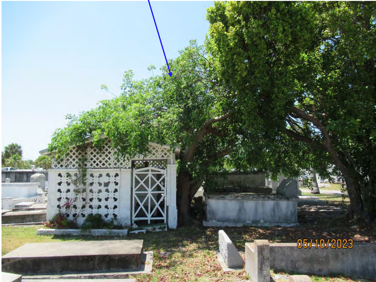
Photo of whole tree and location.

Tree Species: Gumbo Limbo ( Bursera simaruba )