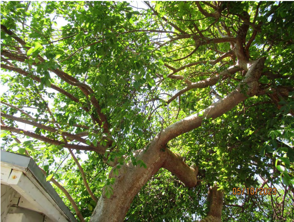
Photo of tree canopy, view 1.