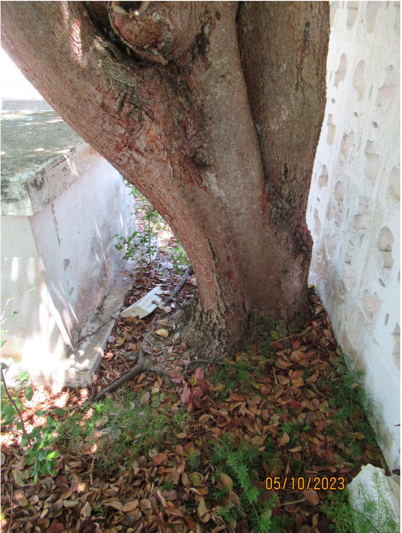
Photo of base of tree, view 2.