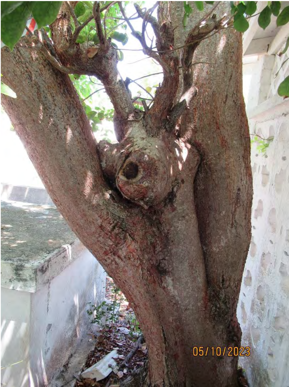
Photo of tree trunk at crotch area-included bark, view 2.