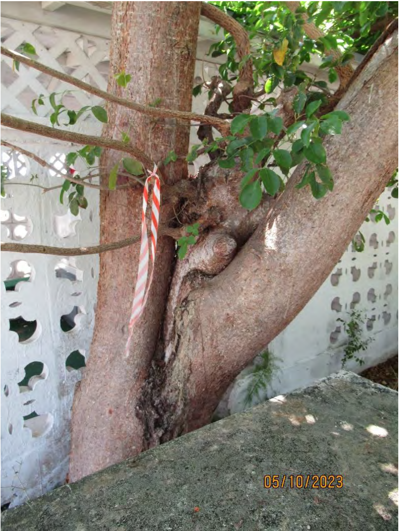
Photo of tree trunk at crotch area-included bark, view 1.