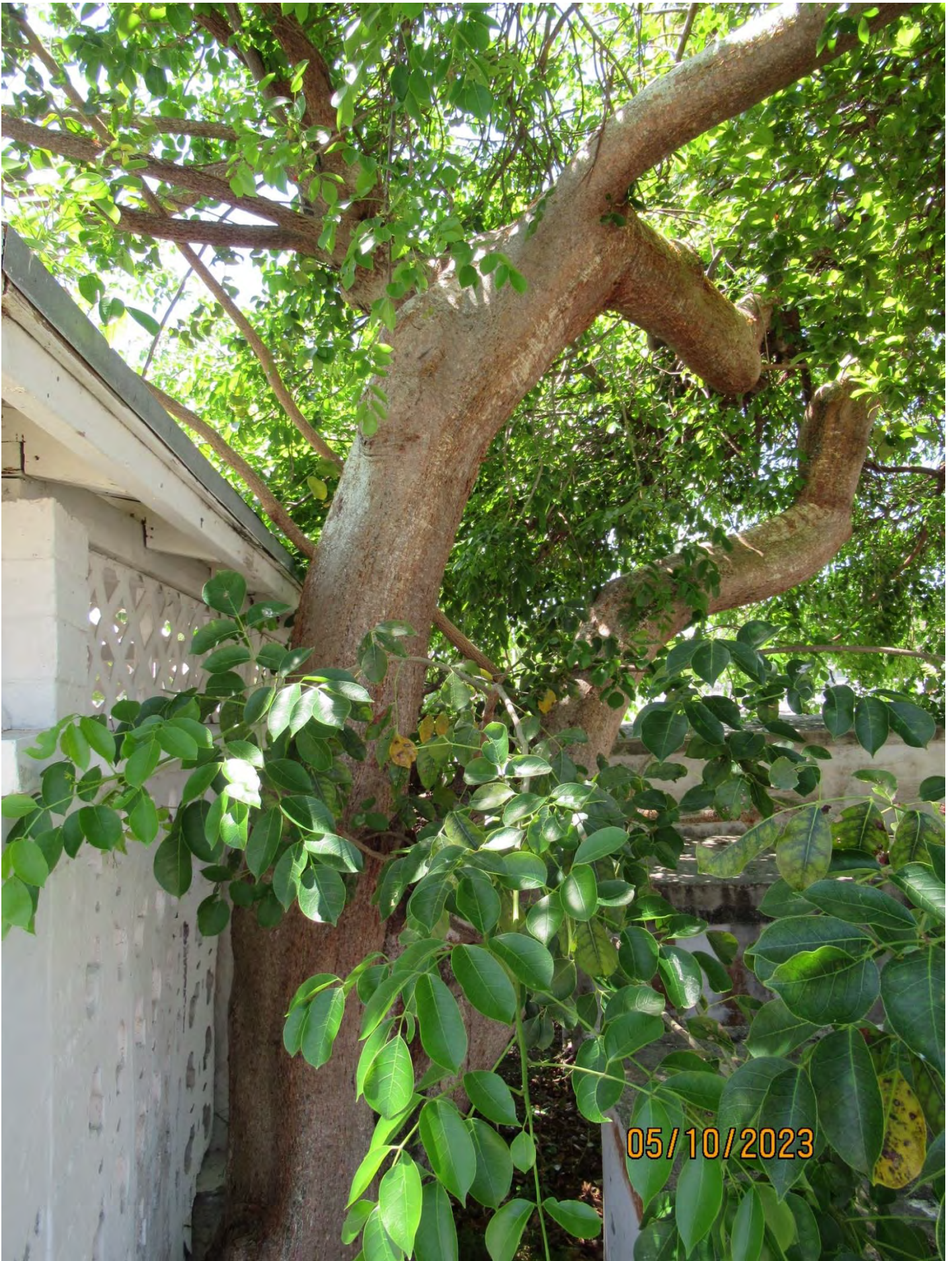
Photo of trunk and canopy, view 1.