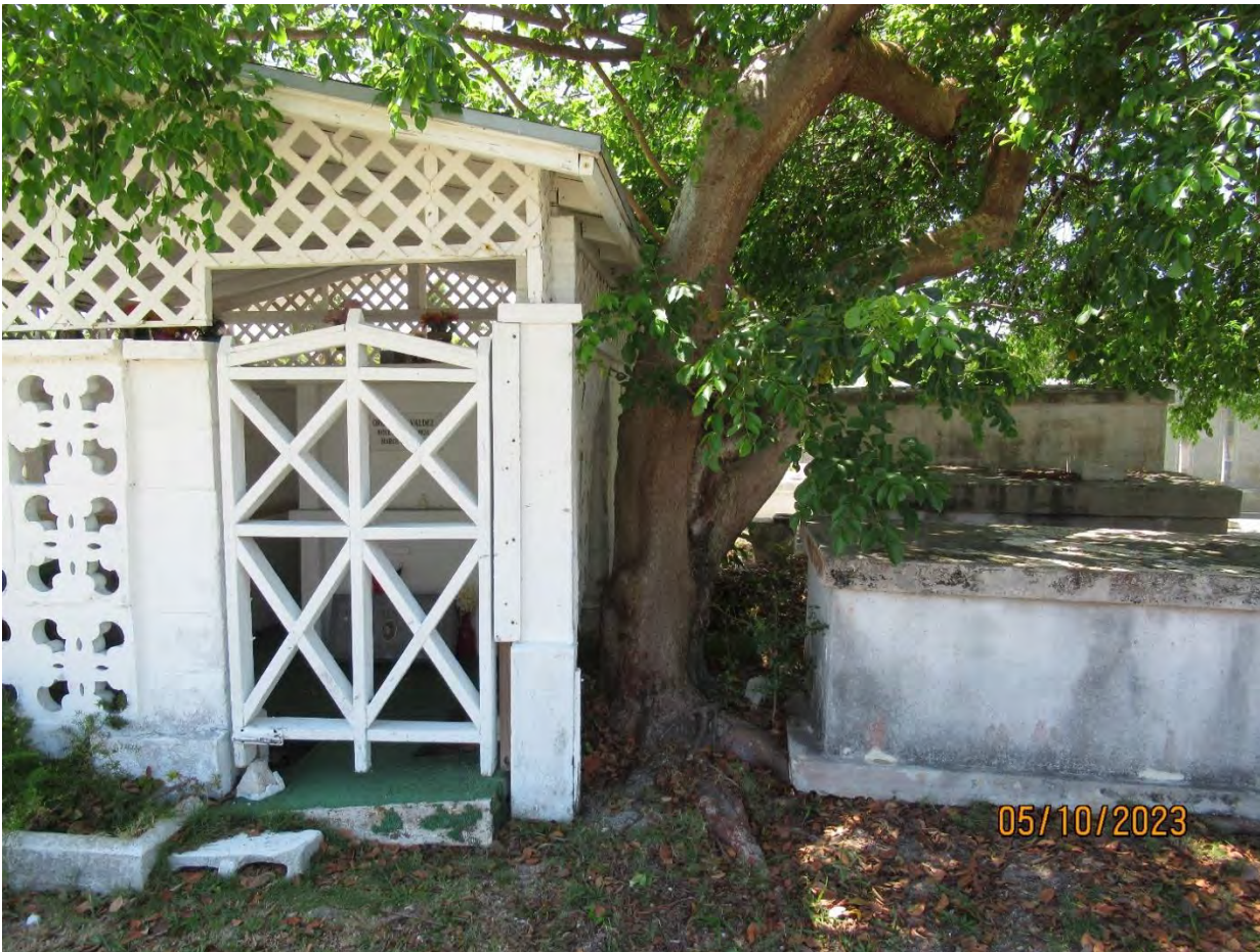
Photo of trunk and base of tree.