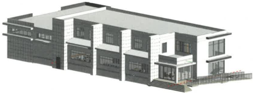
2 3D VIEW B