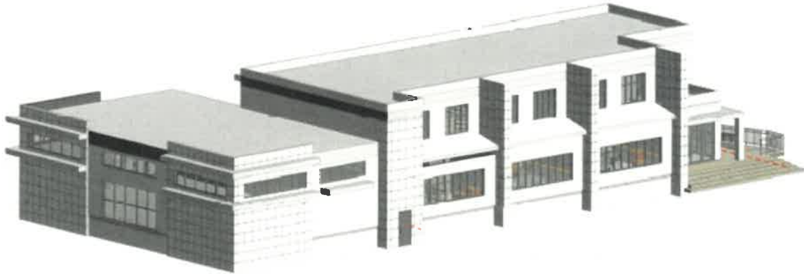
1 3D VIEW A