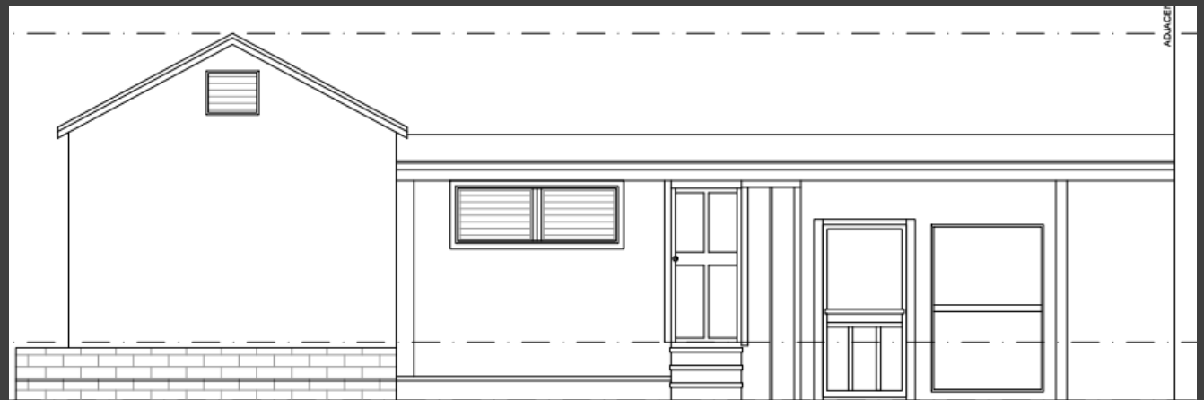
RIGHT SIDE ELEVATION - EXISTING SCALE: 3/8"=1'-0"