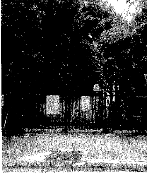
GRINNELL STREET & ANGELA STREET – RE# 00010990-000000