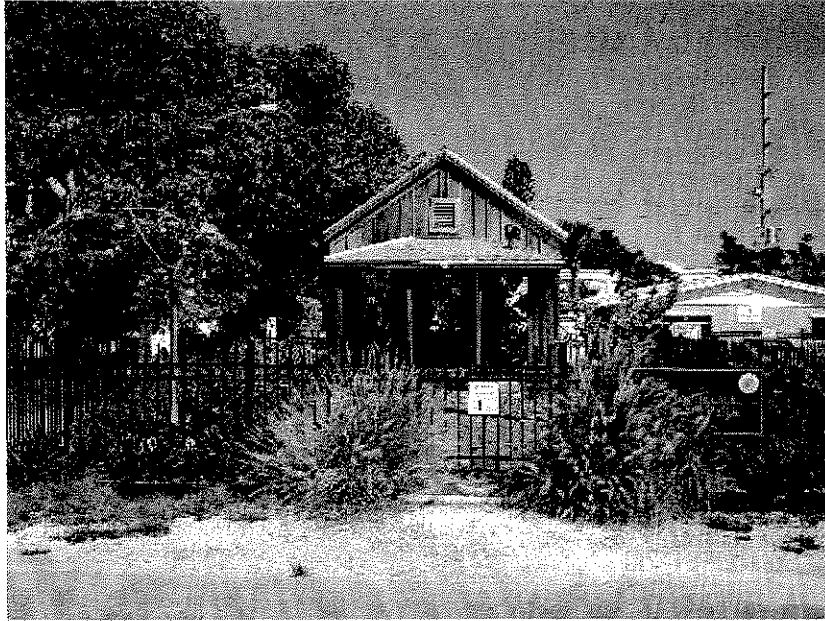
600 BLOCK LOUISA STREET – RE# 00028400-000000