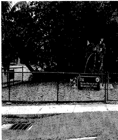
FLAGLER AVENUE & 18 TH STREET – RE# 00052460-000000