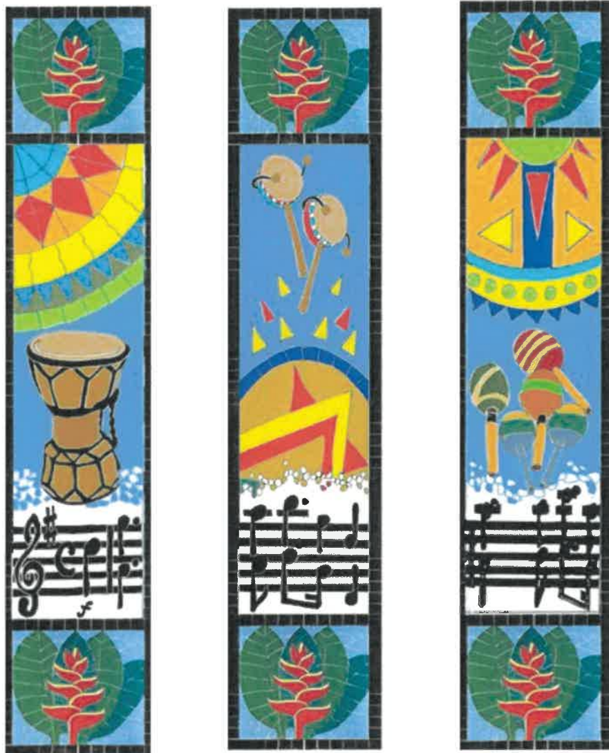
Rendering of some proposed panels.

rich tradition on music. The mosaics will have vibrant colors and will display instruments and costumes worn by the Junkanoo's. Musical notes will be part of the mosaics and if played together it will play one of Junkanoo's songs.