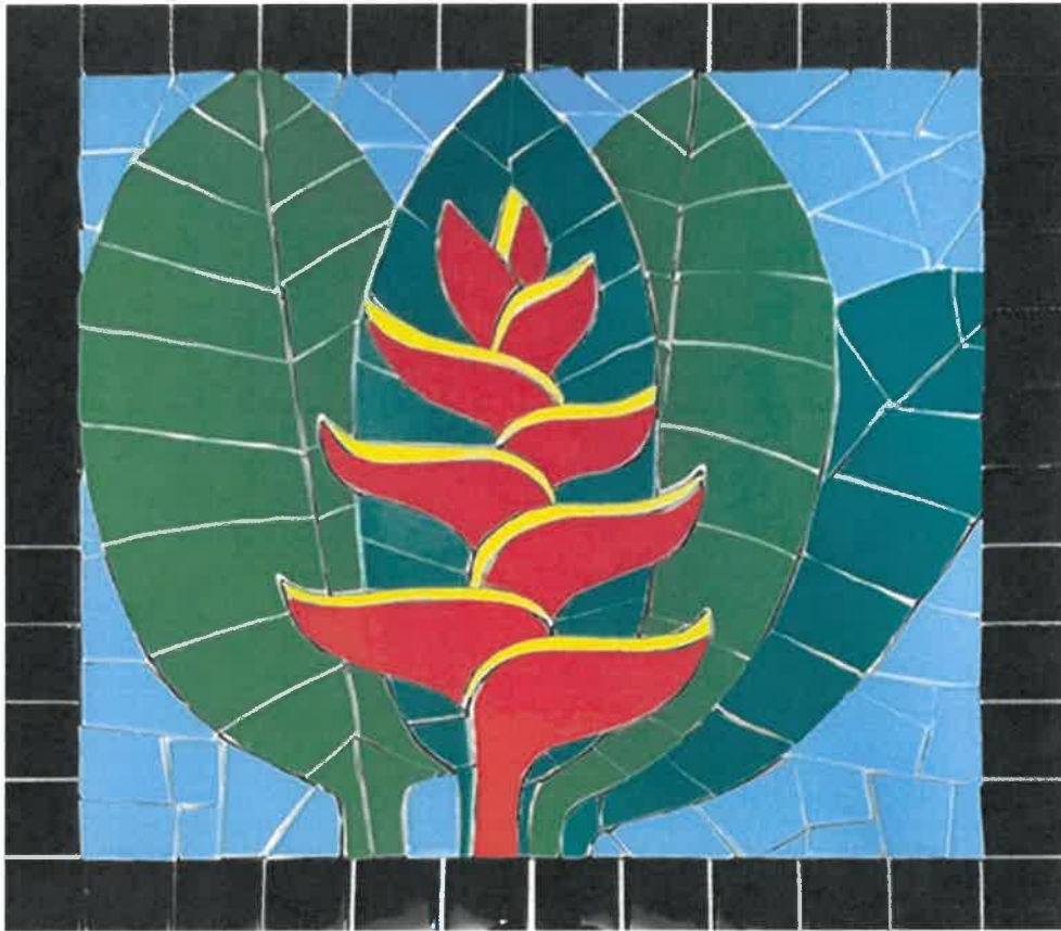
Detail of colors and textures of proposed mosaic murals.