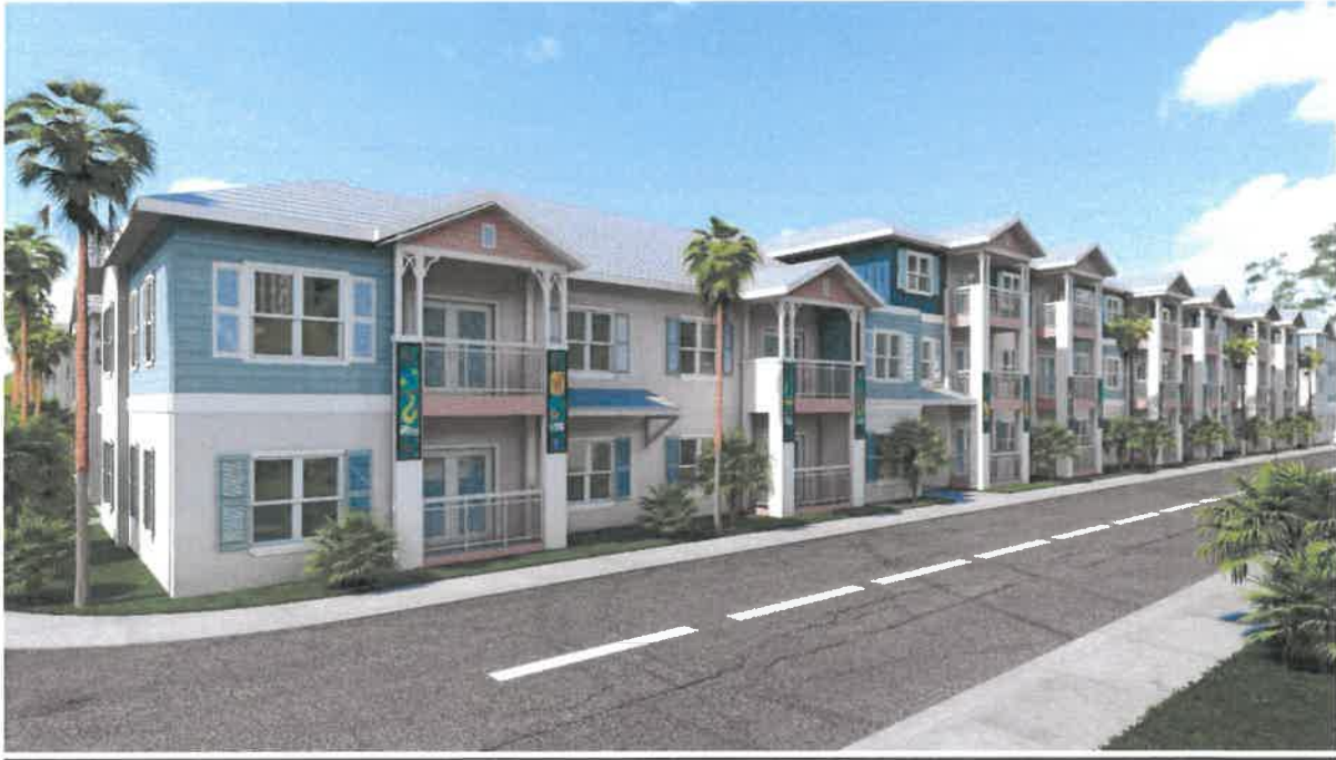
Partial View of Proposed Mosaics on Allen Street.