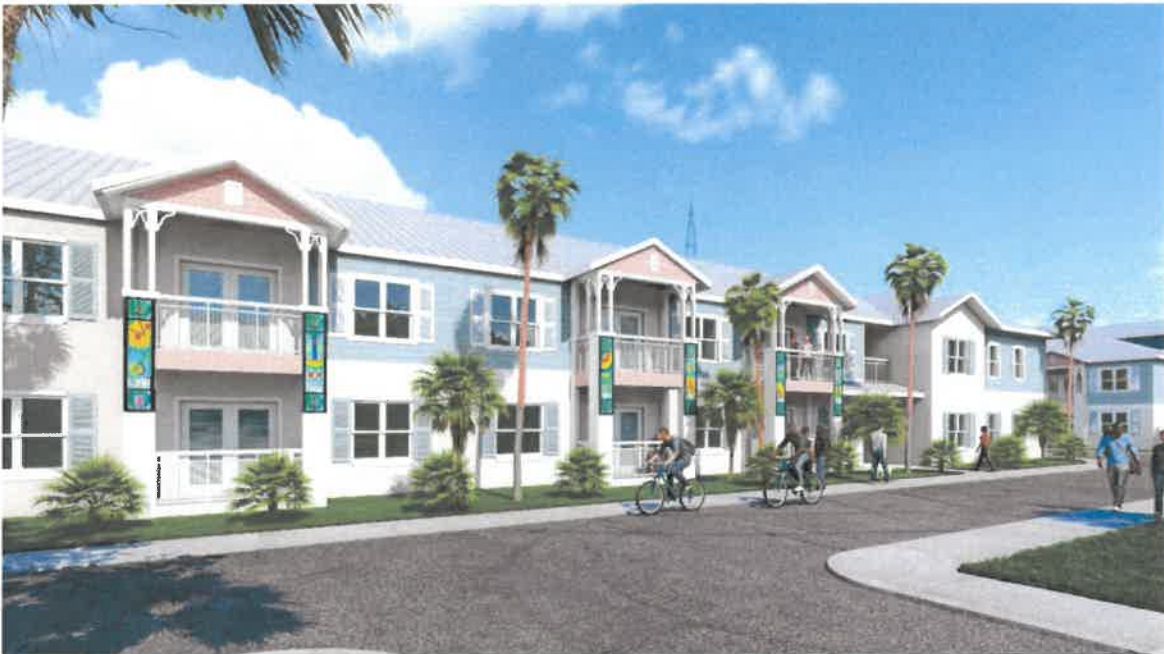
Partial View of Proposed Mosaics on Fort Street.