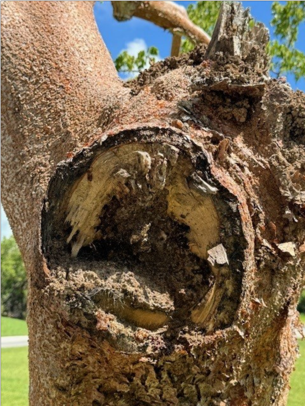
Broken lateral with active termites.