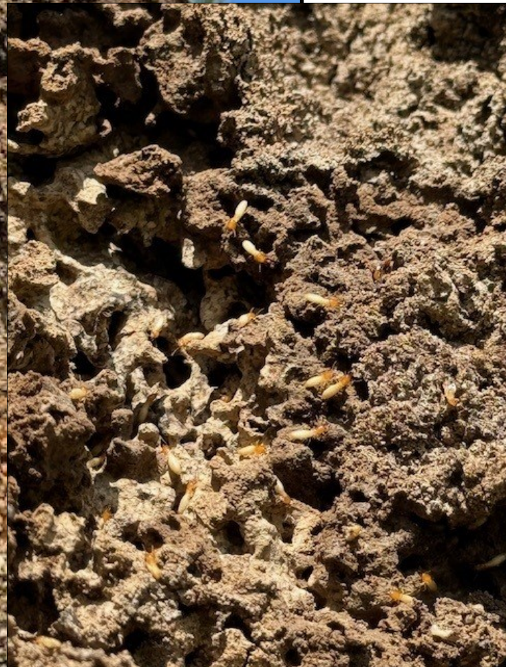
Huge area of active termites “frass/decomposition” sitting on the stump of a previously removed limb.