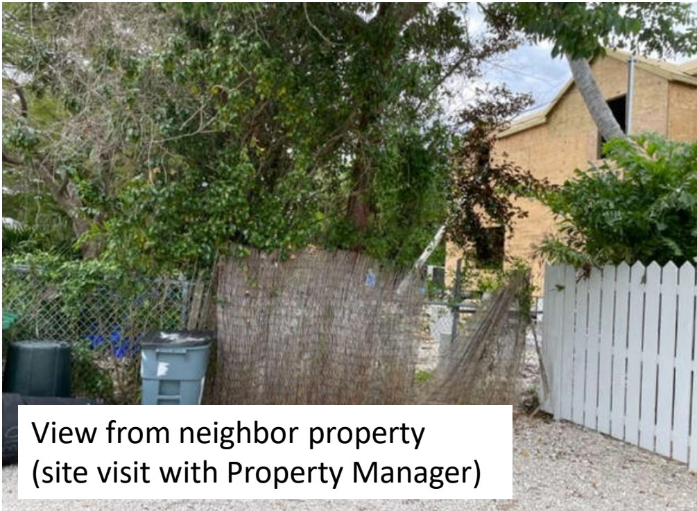
View from neighbor property (site visit with Property Manager)