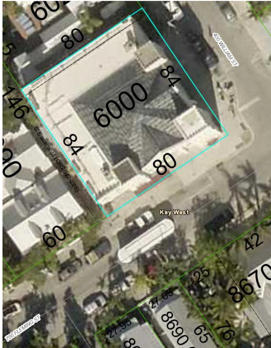
729 Fleming Street, subject property