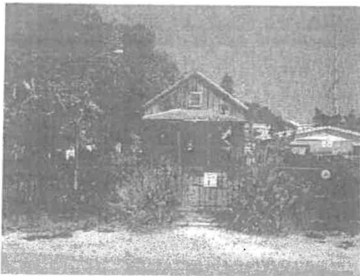
600 BLOCK LOUISA STREET – RE# 00028400-000000