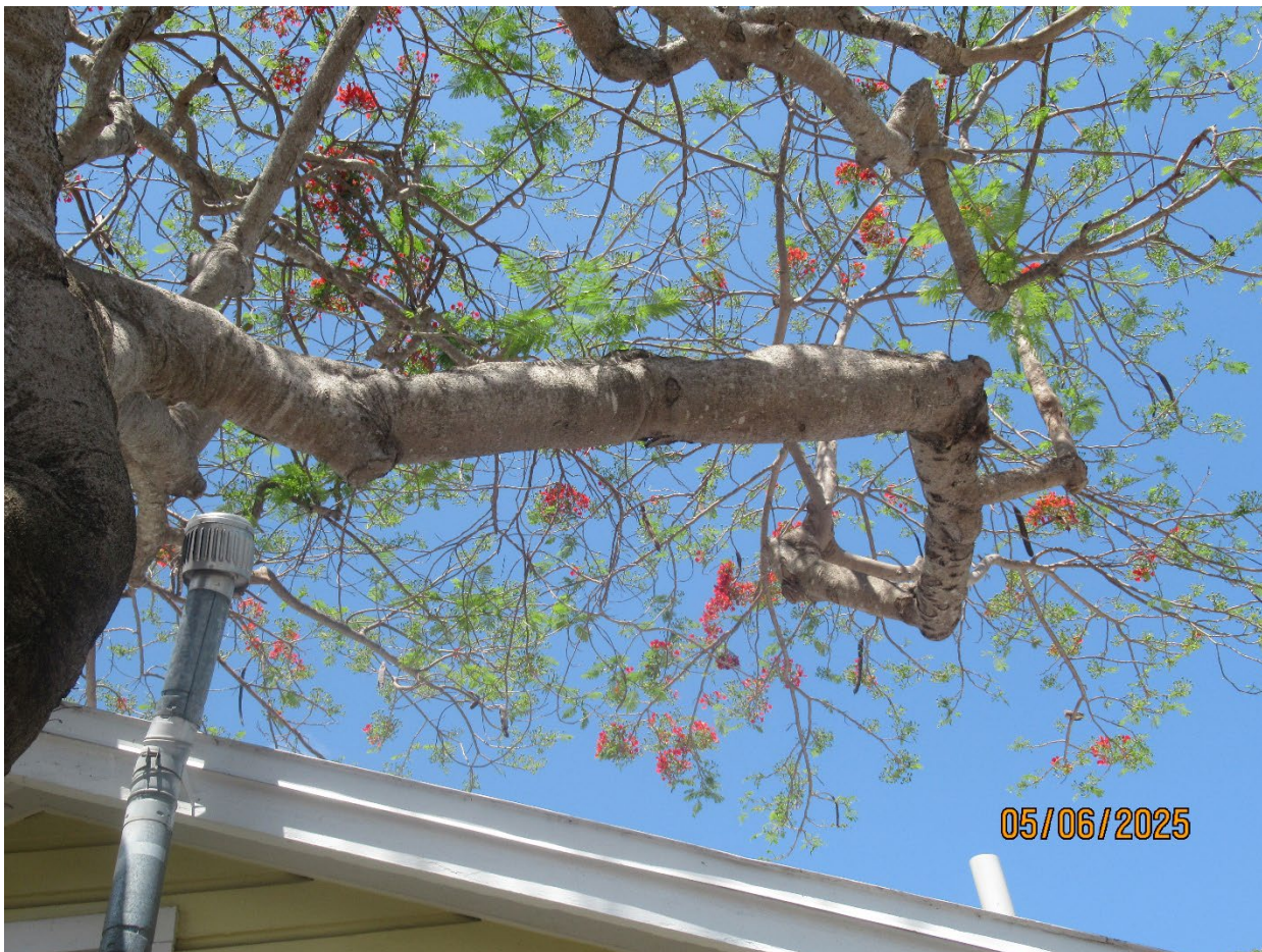
Two photos of the canopy