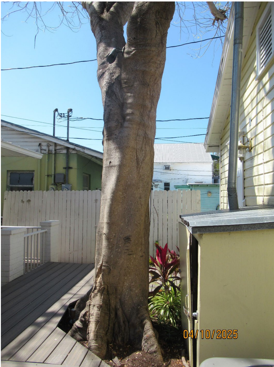
A photo of the trunk of the tree