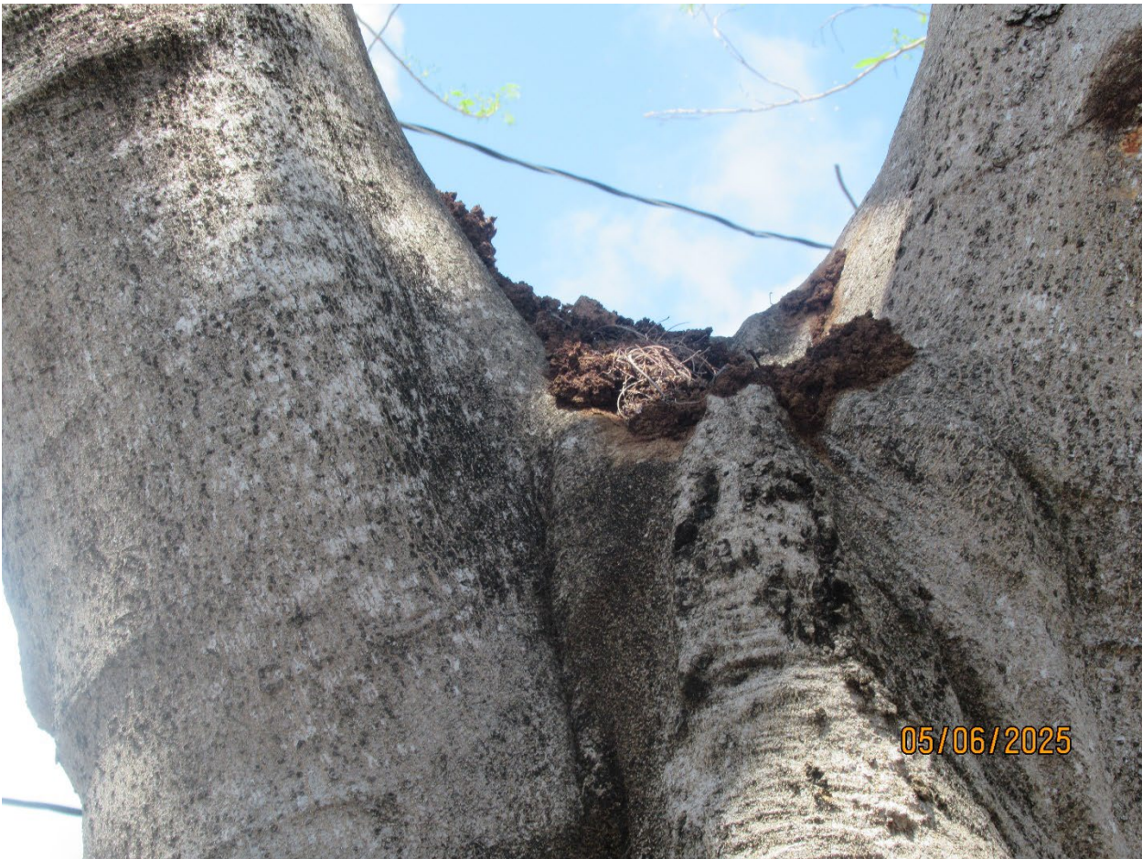
Two photos of termite mud and colony within the crotch of the tree