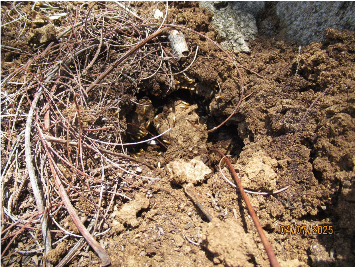
Two photos of active termites within the crotch of the tree