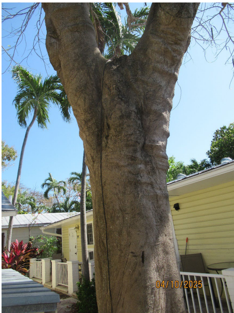
A photo of the trunk of the tree and a photo of the canopy