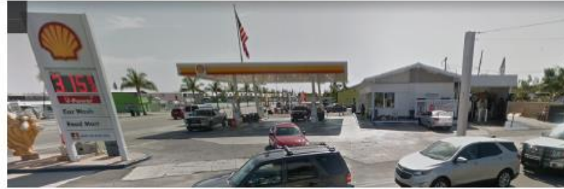
1900 N. ROOSEVELT BLVD. (TO REMAIN UNCHANGED)

(Shell Gas Station to Remain Unchanged; Sunshine Scooter Rental to be Demolished)