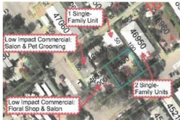
Pictures of the existing vacant lot with surrounding land-uses identified