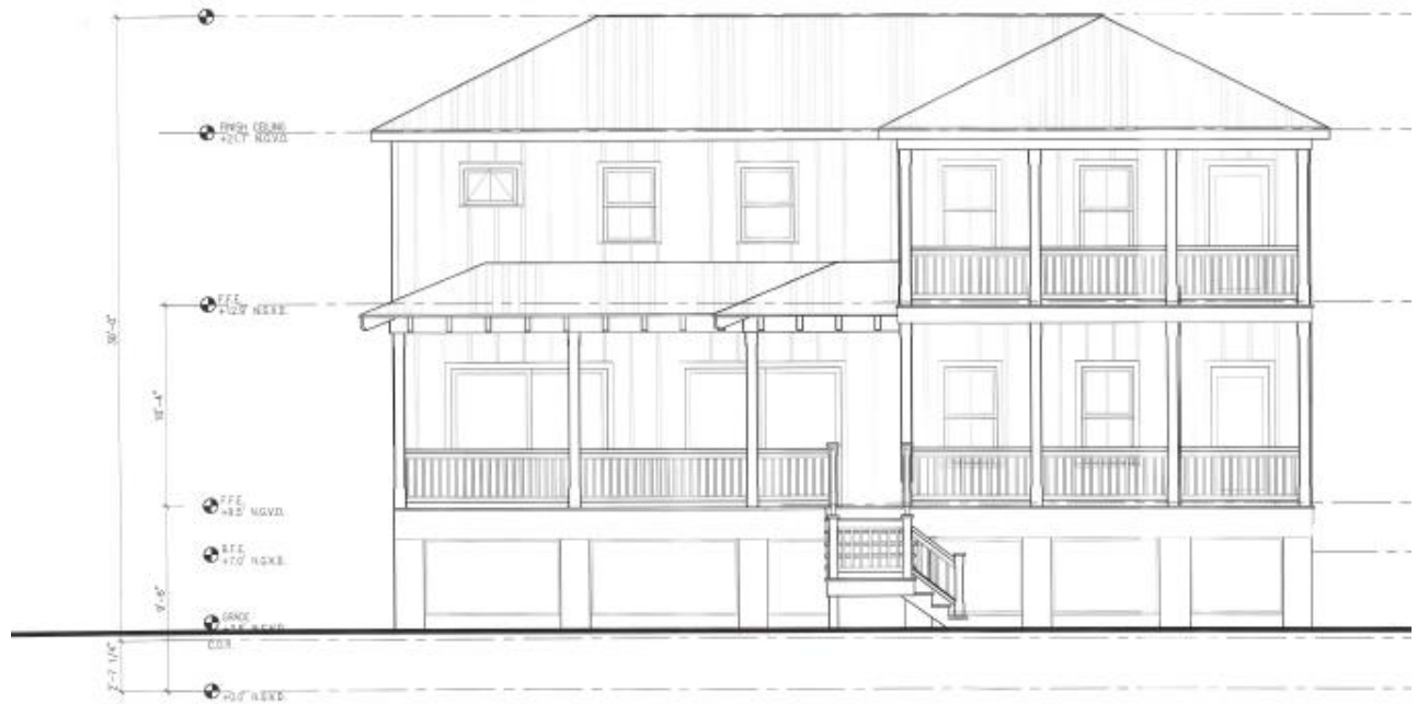
2 EXISTING SOUTH ELEVATION A3.1 SCALE: 1/4"=1'-0"