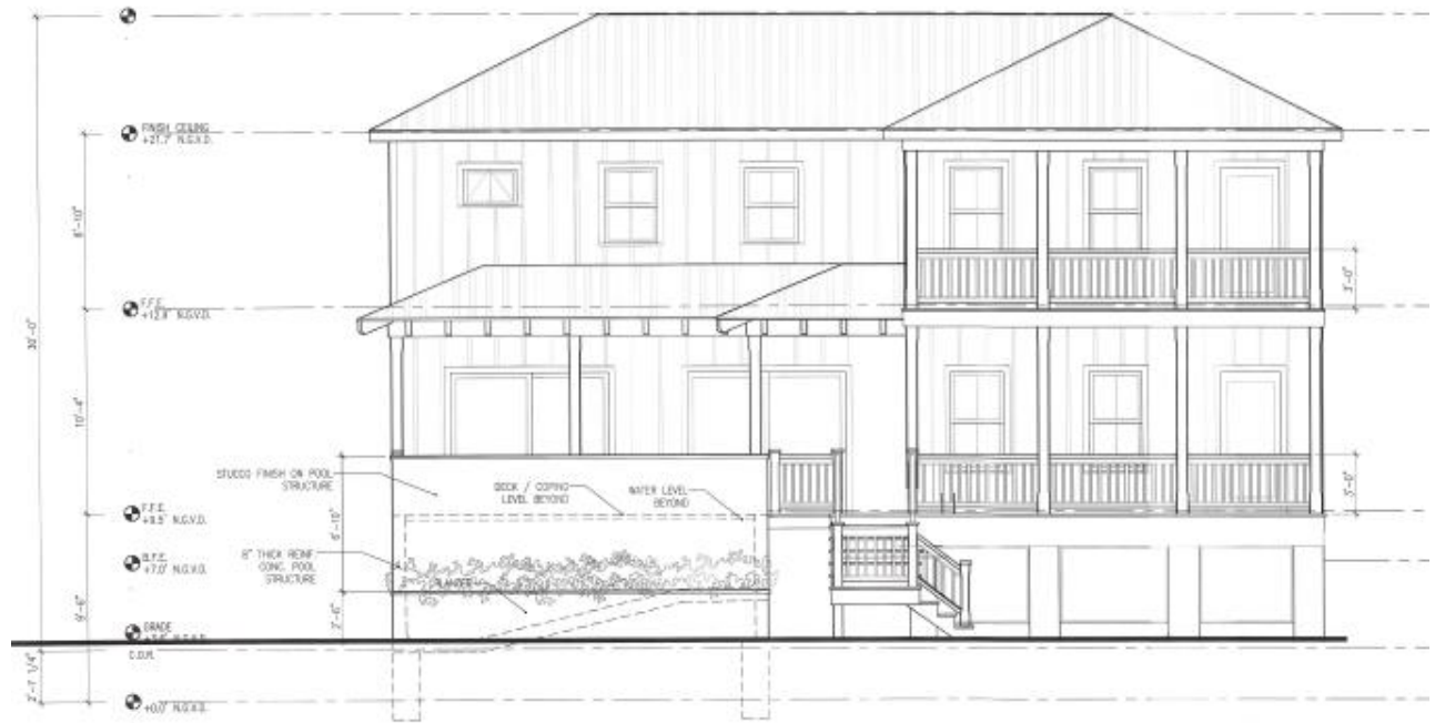
2 PROPOSED SOUTH ELEVATION A3.1 SCALE: 1/4"=1'-0"