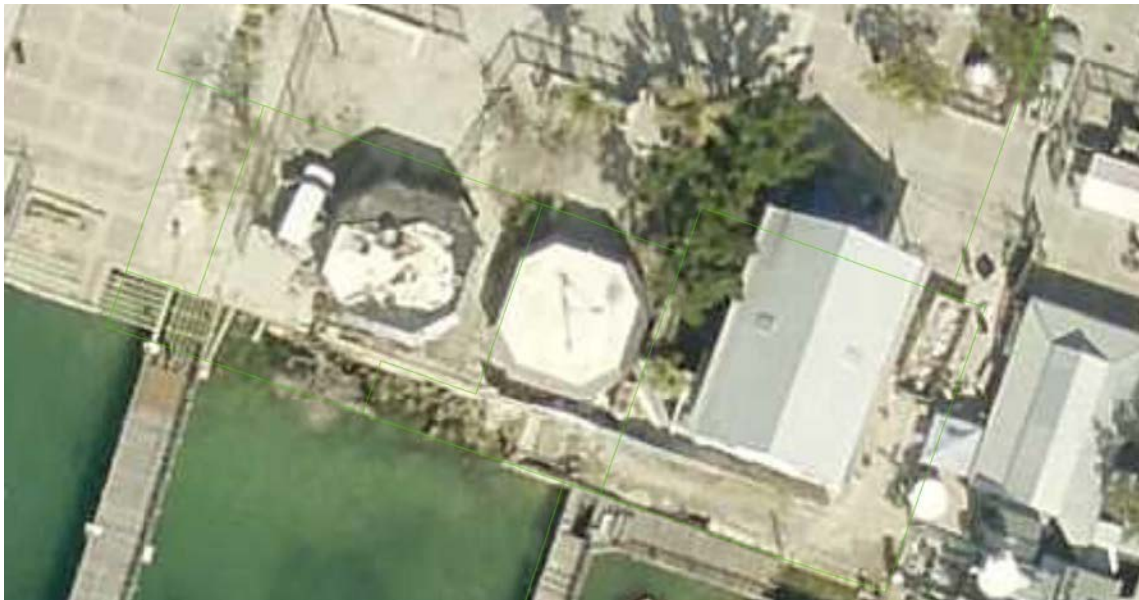
Aerial of the subject properties