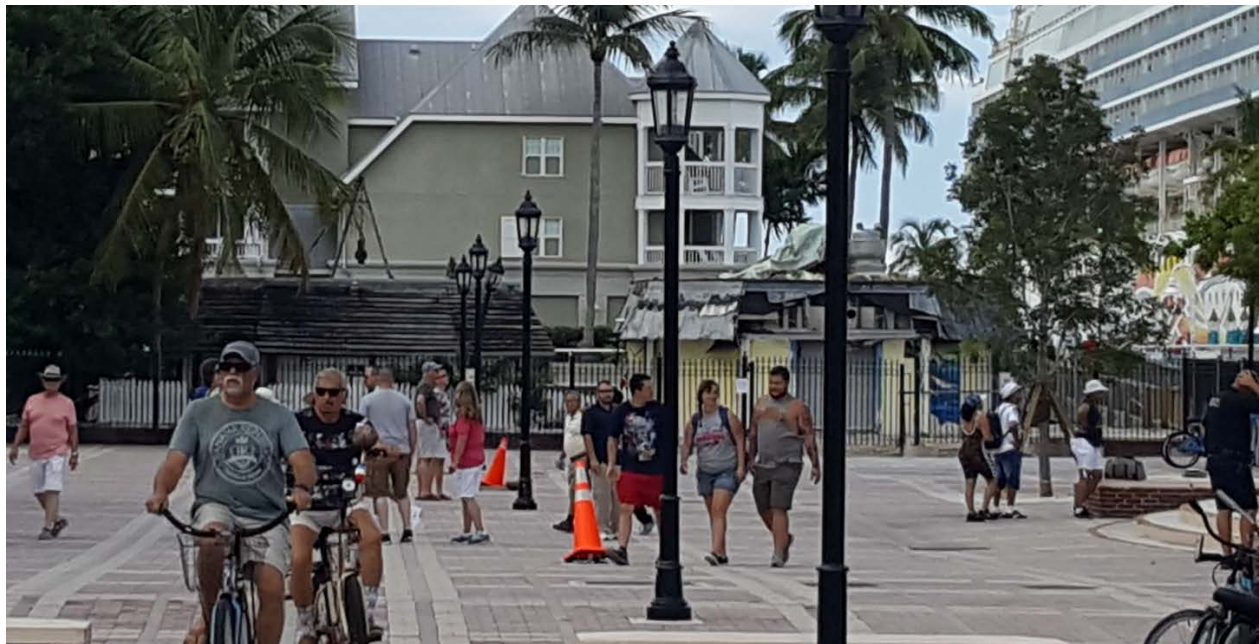
Photograph of the property