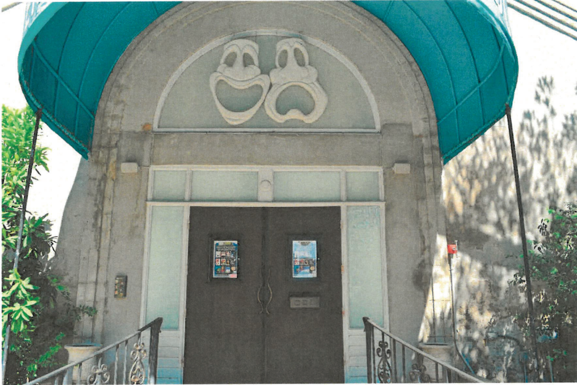
52. Tift and Mallory Warehouse / Waterfront Playhouse, partial east elevation, camera facing west.