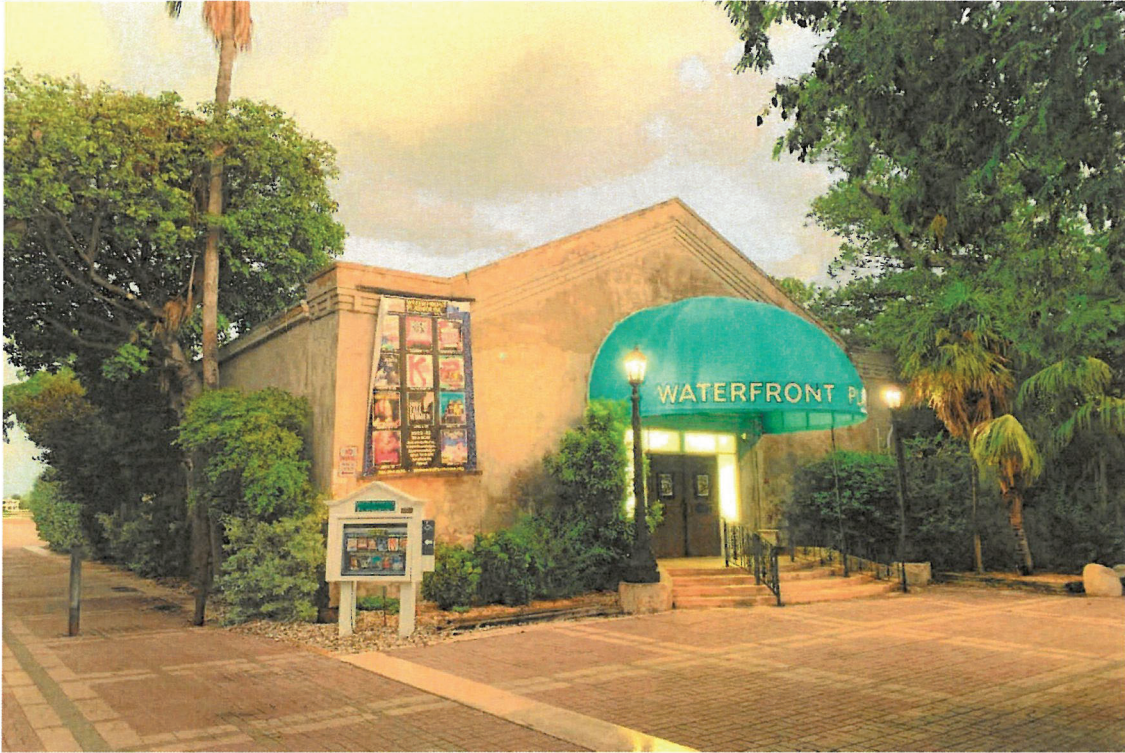
49. Tift and Mallory Warehouse / Waterfront Playhouse, east elevation, camera facing northwest.