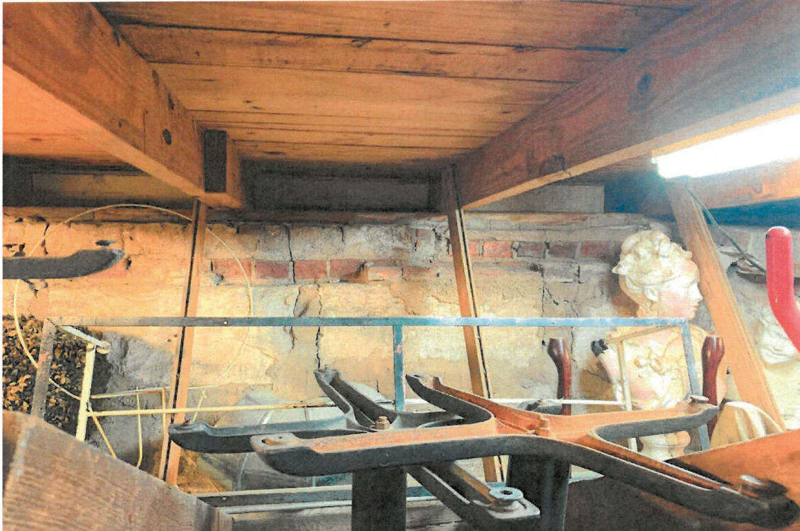
58. Tift and Mallory Warehouse / Waterfront Playhouse, attic, camera facing west. Note cracks in top of wall and below roof framing.