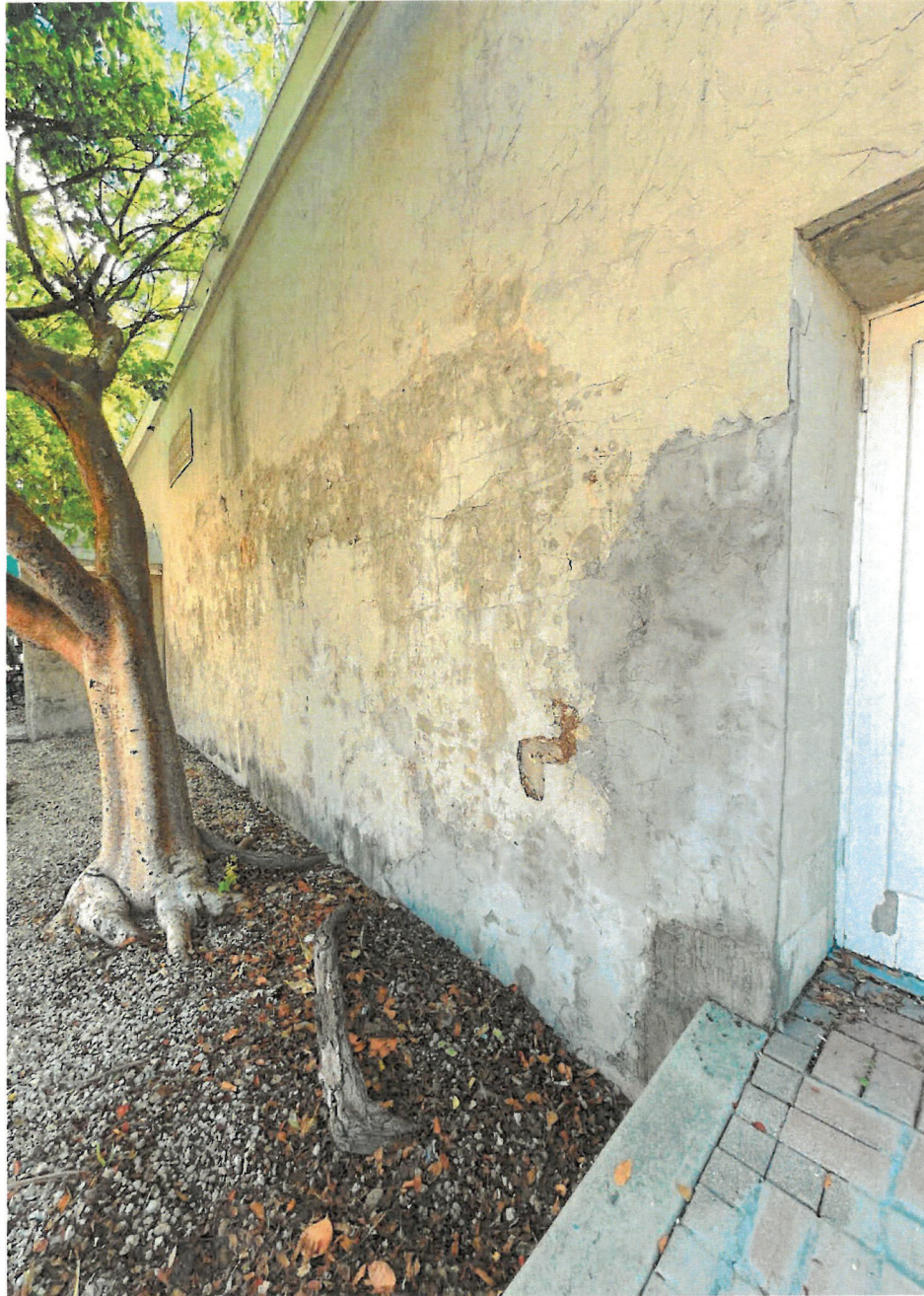
56. Tift and Mallory Warehouse / Waterfront Playhouse, partial west elevation. Note severe deterioration and failure of parge coat.