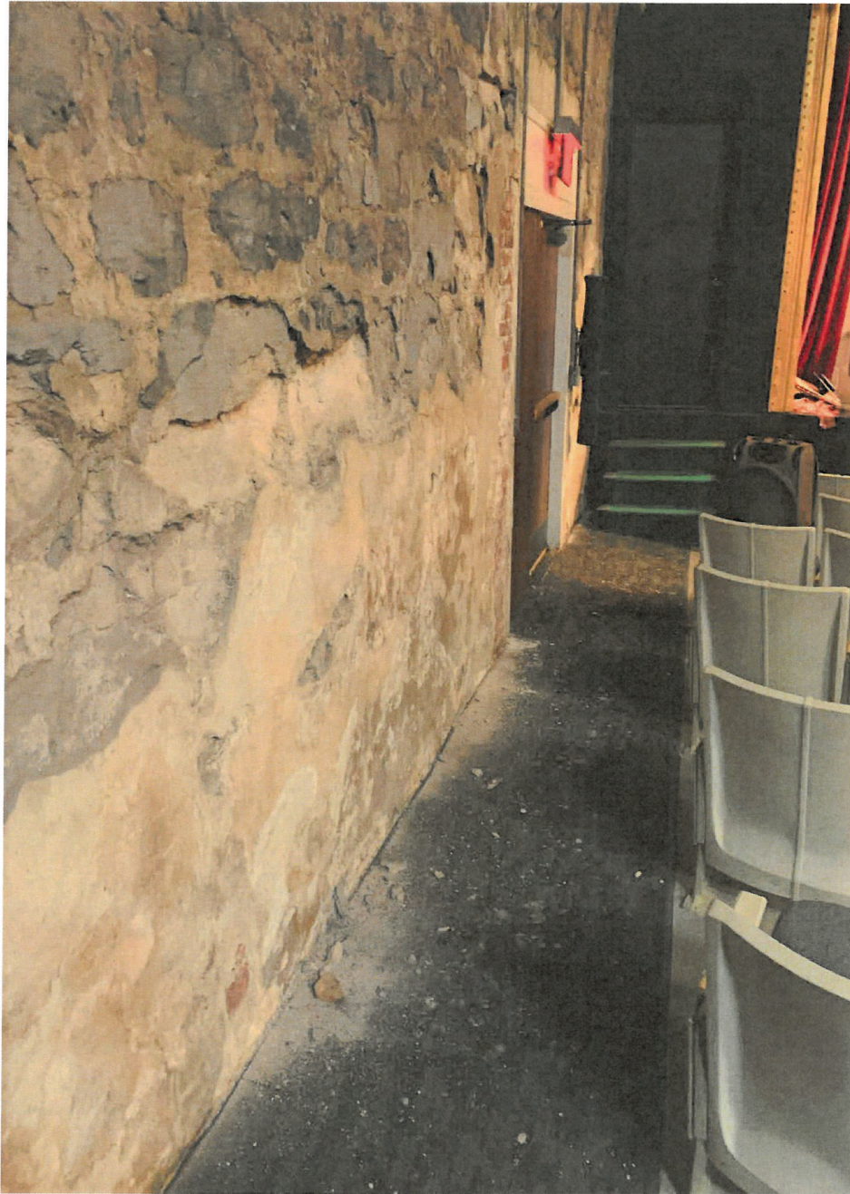
62. Tift and Mallory Warehouse / Waterfront Playhouse, south wall, camera facing down and southwest. Note deterioration of wall. Stone and mortar are on the carpet below.