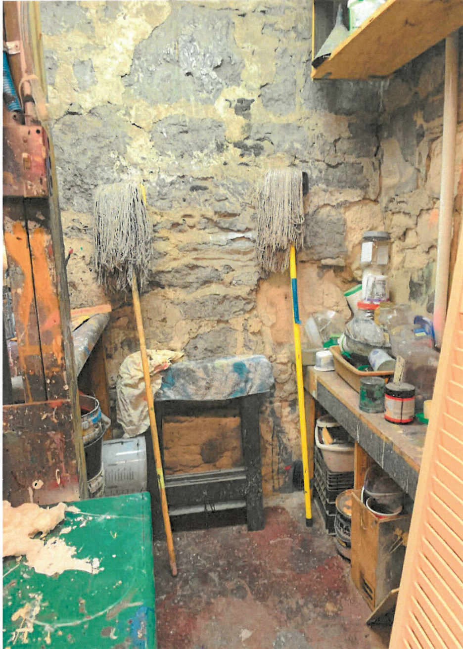
59. Tift and Mallory Warehouse / Waterfront Playhouse, interior, camera facing southwest. Example of conditions at south wall.