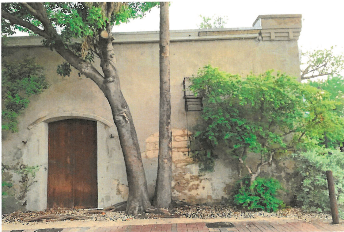
55. Tift and Mallory Warehouse / Waterfront Playhouse, partial south elevation. Note deteriorated parge coat and cracking.