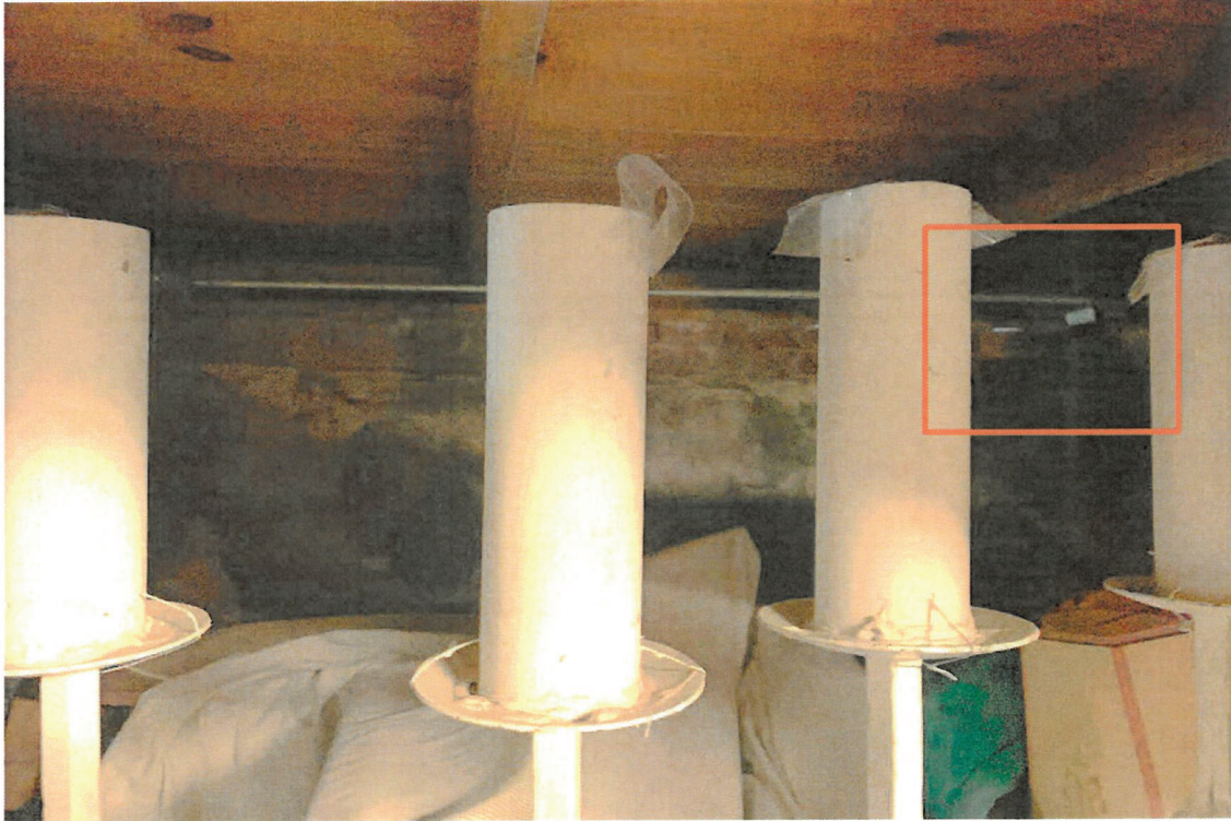
57. Tift and Mallory Warehouse / Waterfront Playhouse, attic, camera facing southwest. Note daylight along roofline.