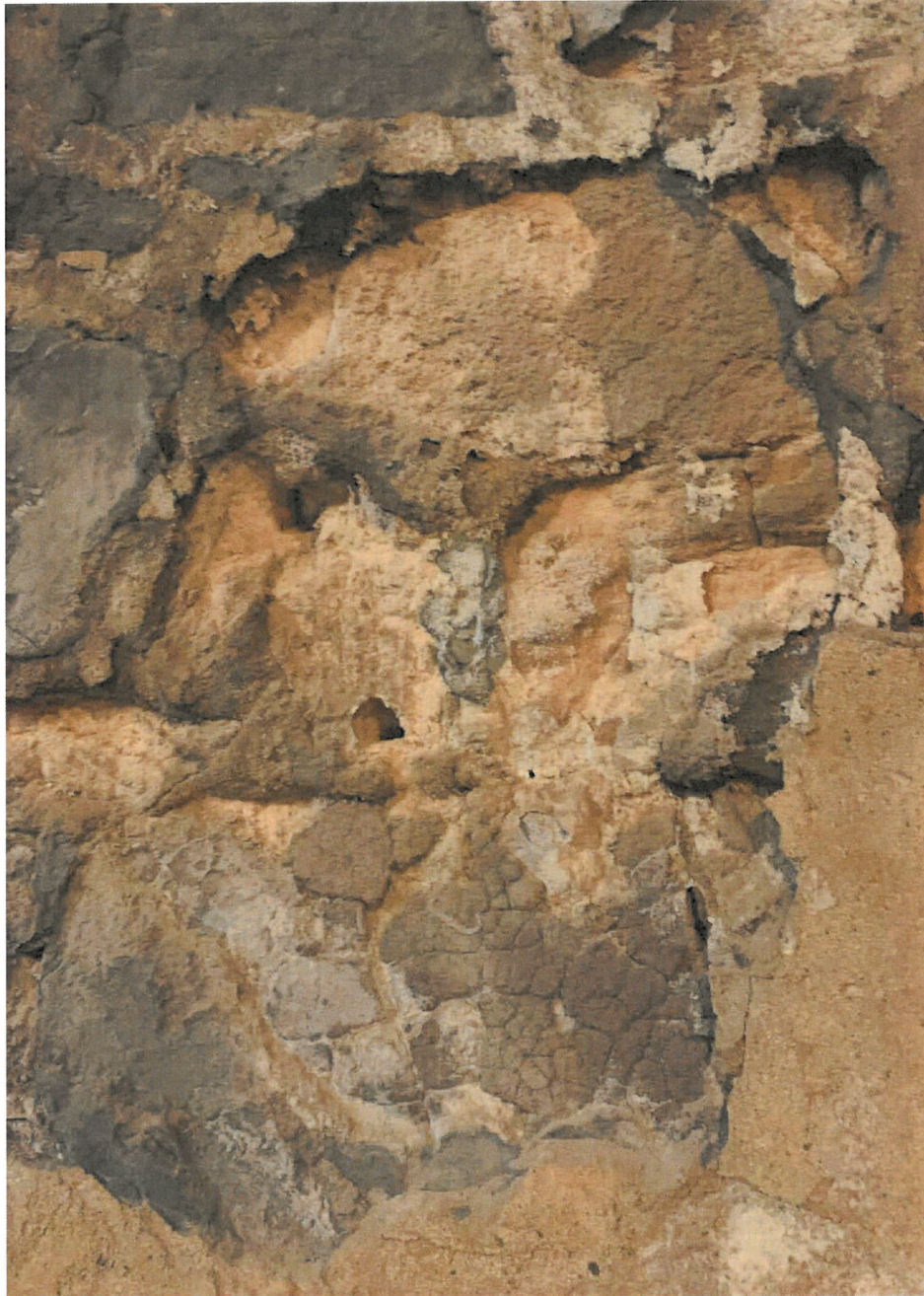
63. Tift and Mallory Warehouse / Waterfront Playhouse, south wall, camera facing south. Note severe deterioration of wall.