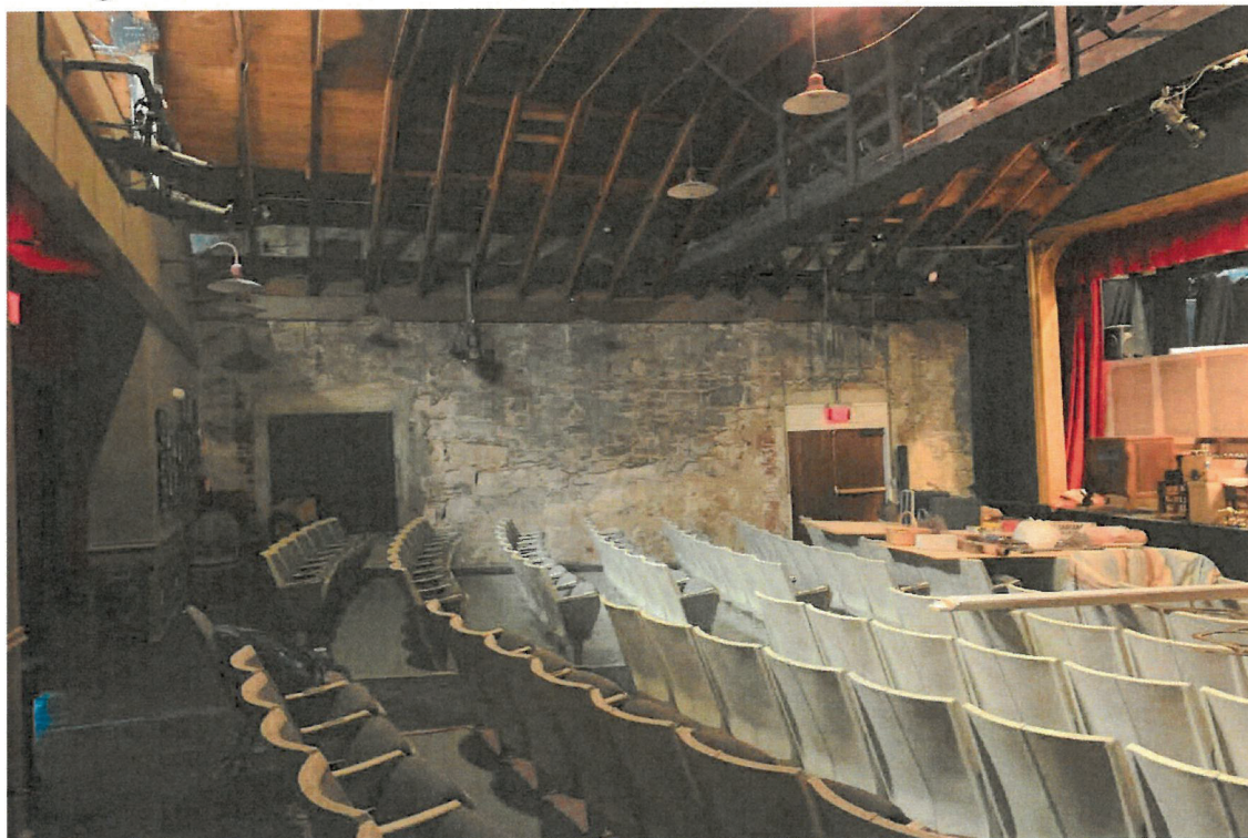
61. Tift and Mallory Warehouse / Waterfront Playhouse, interior, camera facing southwest.