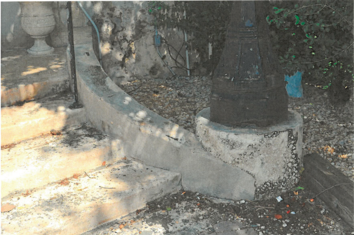
53. Tift and Mallory Warehouse / Waterfront Playhouse, front entry steps at east elevation, camera facing down and northwest. Note deterioration of steps.