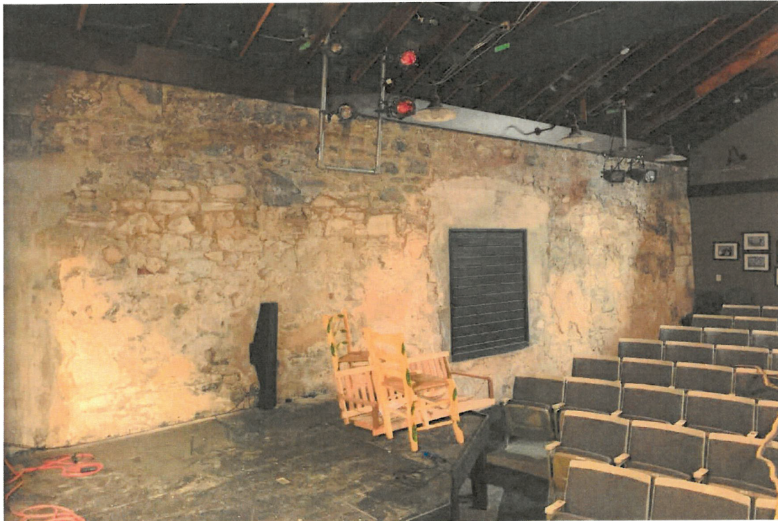
60. Tift and Mallory Warehouse / Waterfront Playhouse, interior, north wall, camera facing northeast.