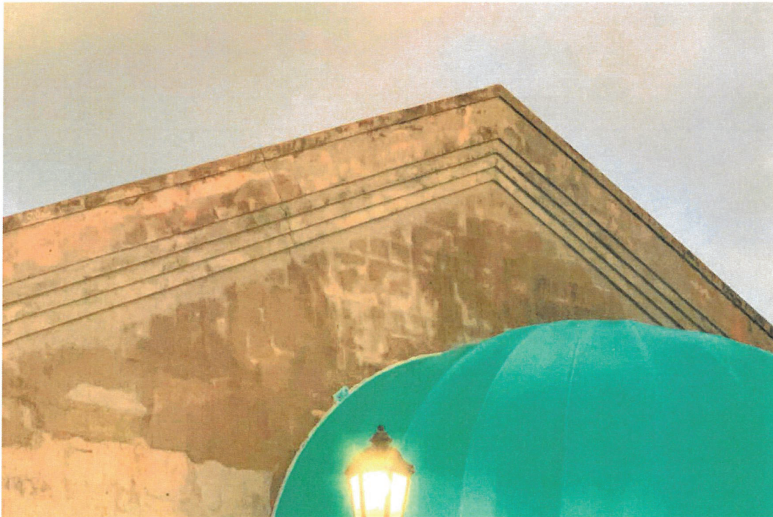
50. Tift and Mallory Warehouse / Waterfront Playhouse, partial east elevation, camera facing northwest. Note saturation of parge coat and cracking.