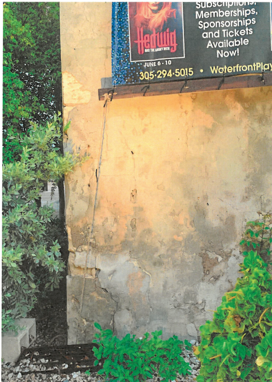
51. Tift and Mallory Warehouse / Waterfront Playhouse, partial east elevation, camera facing west. Note deterioration of parge coat and limestone.