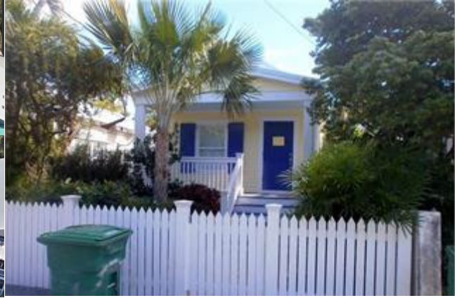
Street View of Receiver Site