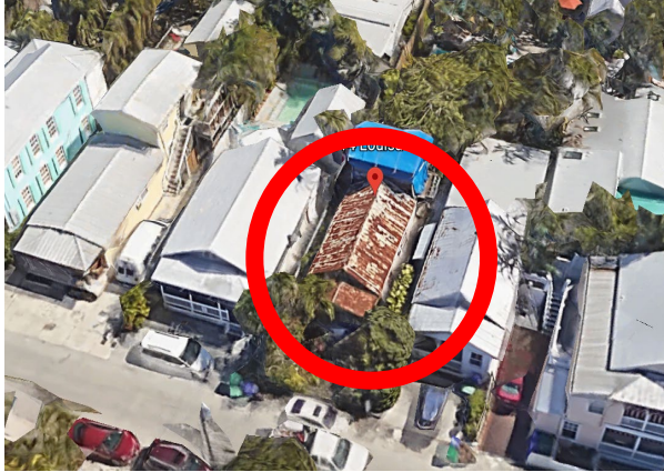
Aerial View of Receiver Site