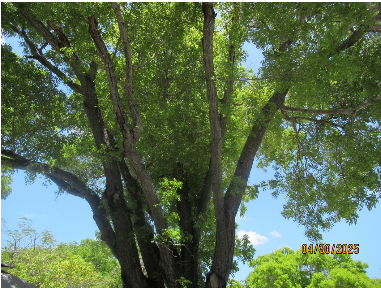
Two photos of the tree's canopy