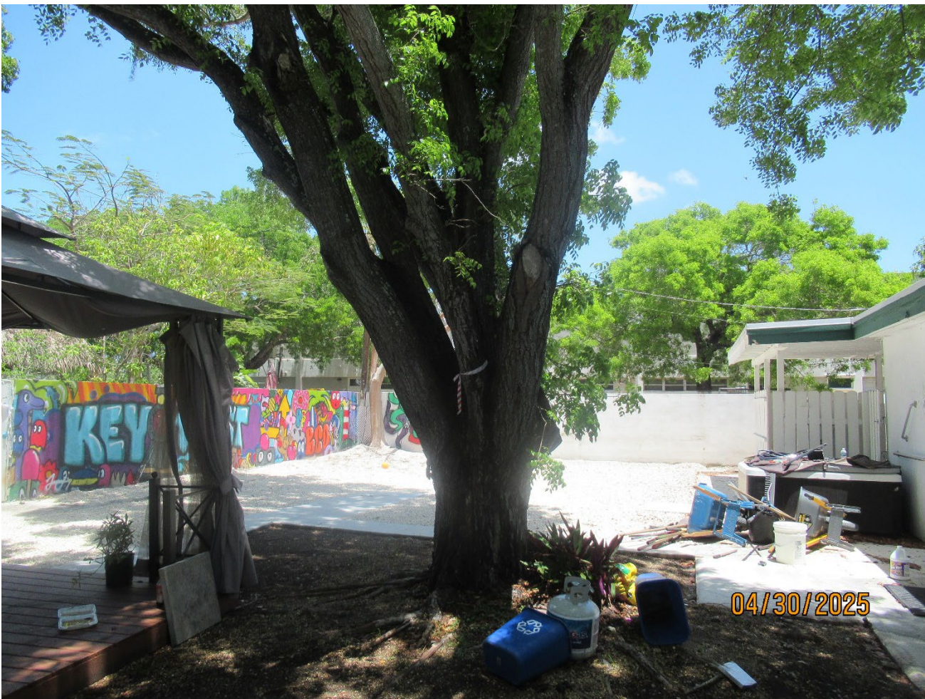
A photo of the tree overall