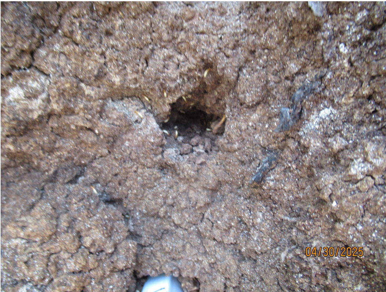
A photo showing active termites and a photo showing the tree hollowed by 9 inches