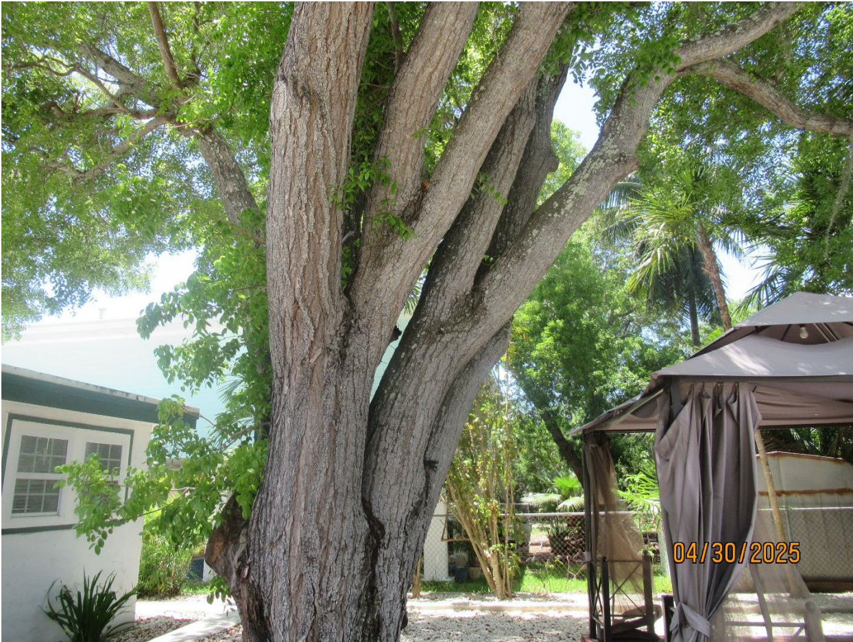
A photo of the tree