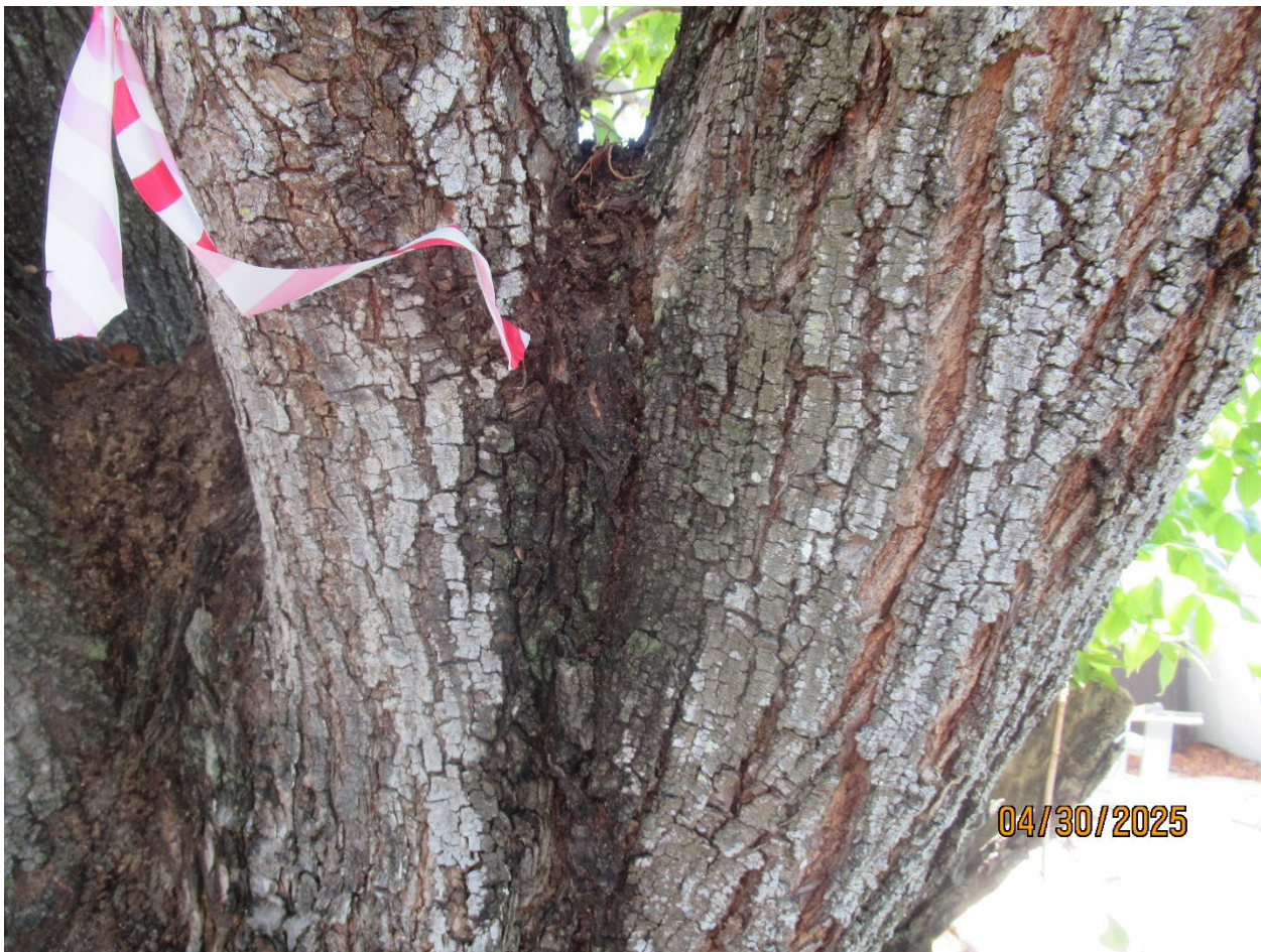
Two photos of the tree's crotches