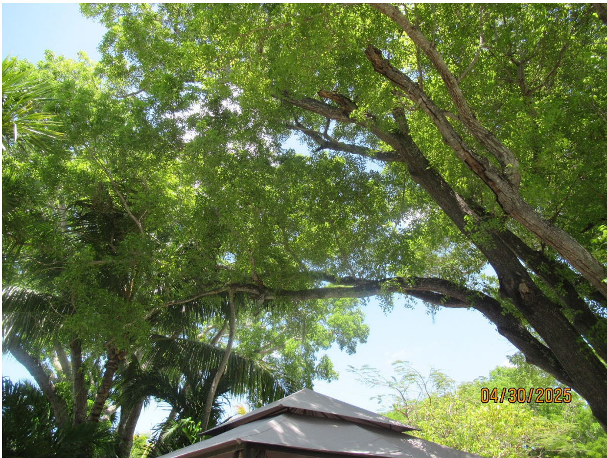
Two photos of the tree's canopy