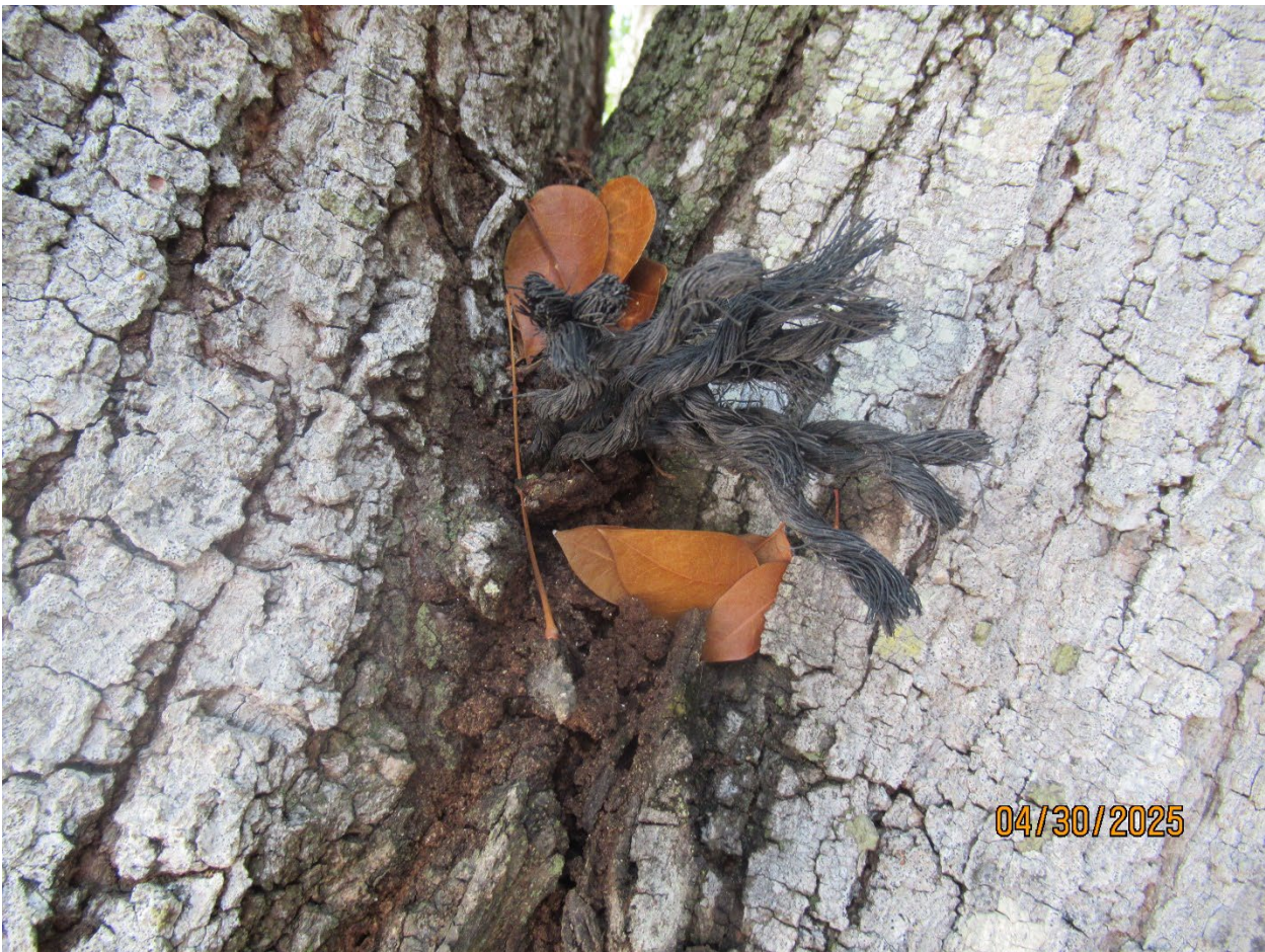
A photo of a rope stuck within a large limb and a photo of the tree's trunk