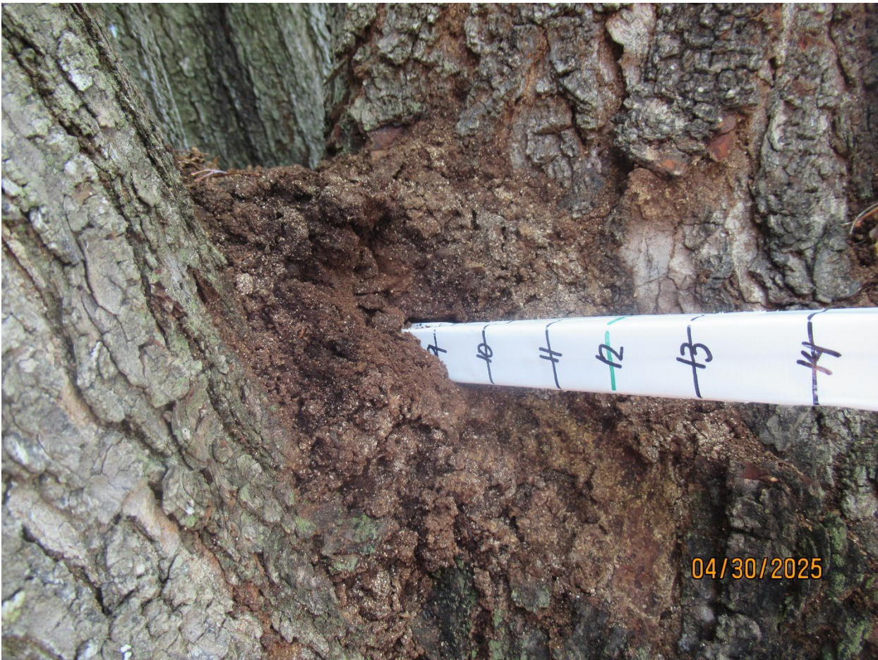
A photo of the tree's crotch hollow by 9inches and a photo of the tree's other crotches