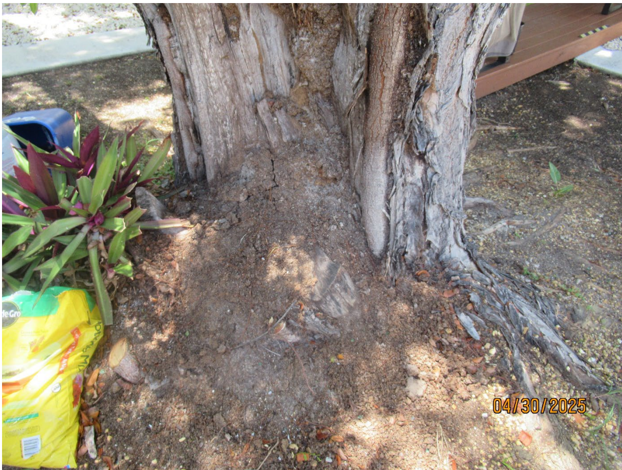
Two photos of termite mounds within the trunk of the tree