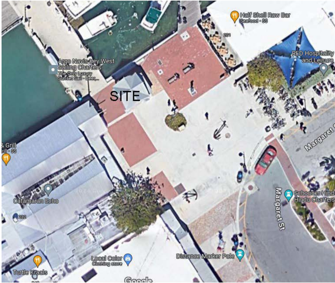
EXHIBIT "A" Demised Premises