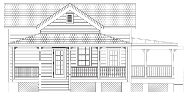
EXISTING FRONT ELEVATION SCALE: 3/8" = 1'-0"

Sec 122-32 (d) “A nonconforming use shall not be extended, expanded, enlarged, or increased in intensity. This prohibition shall include but not be limited to the extension of a nonconforming use within a building or structure or to any other building or structure.”