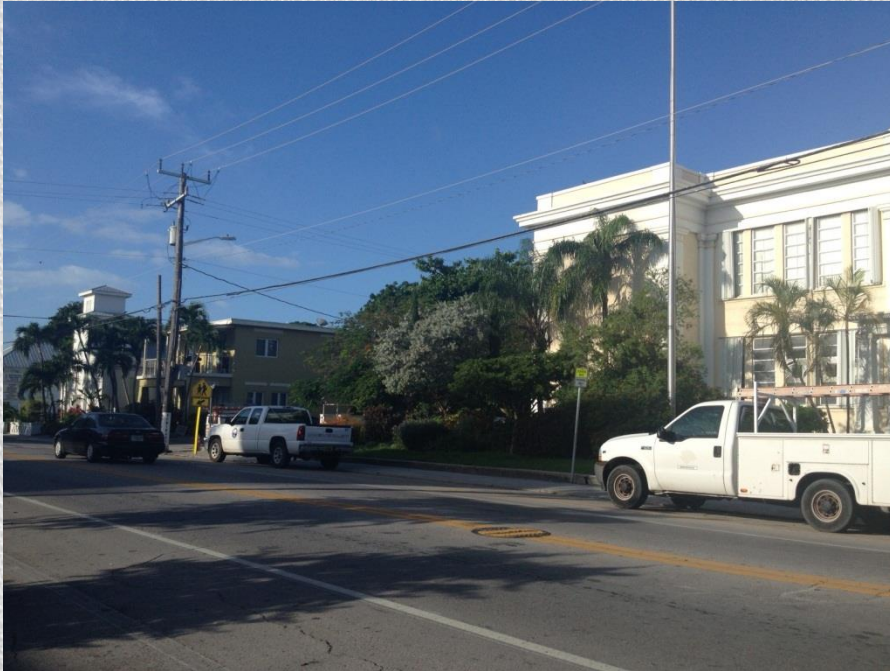
White Street looking south