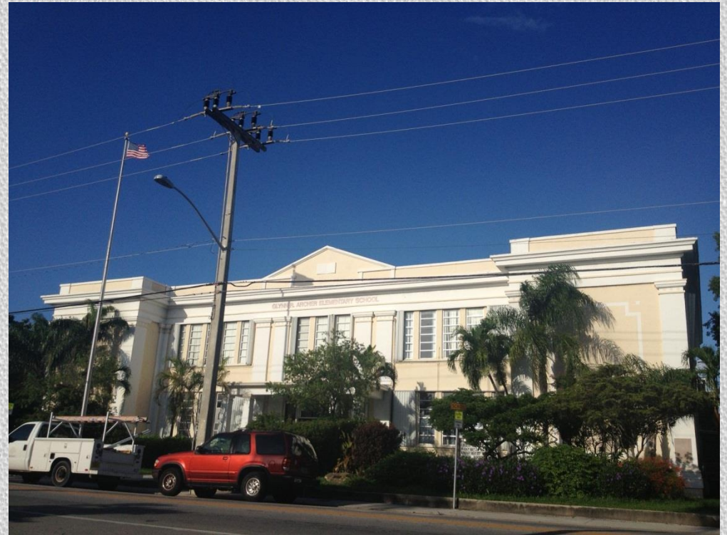
Glynn Archer as it looks today

The building has a monumental scale since it is an institutional structure. The historic building is located on a double side corner, making the White and United Streets the principal façades and Seminary Street a secondary façade. The back façade faces Grinnell Street.