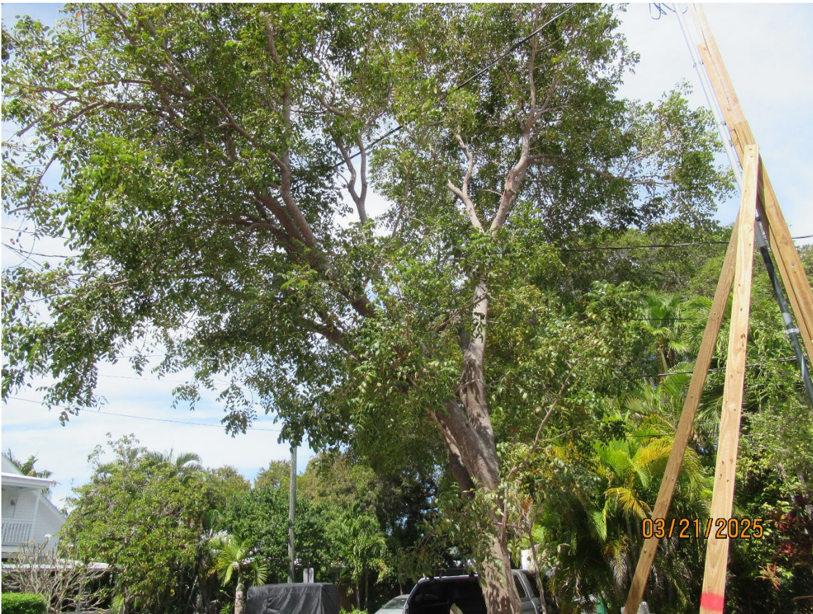
A photo of the tree's canopy in the power lines and a photo of the tree's trunk where it splits around 6ft height