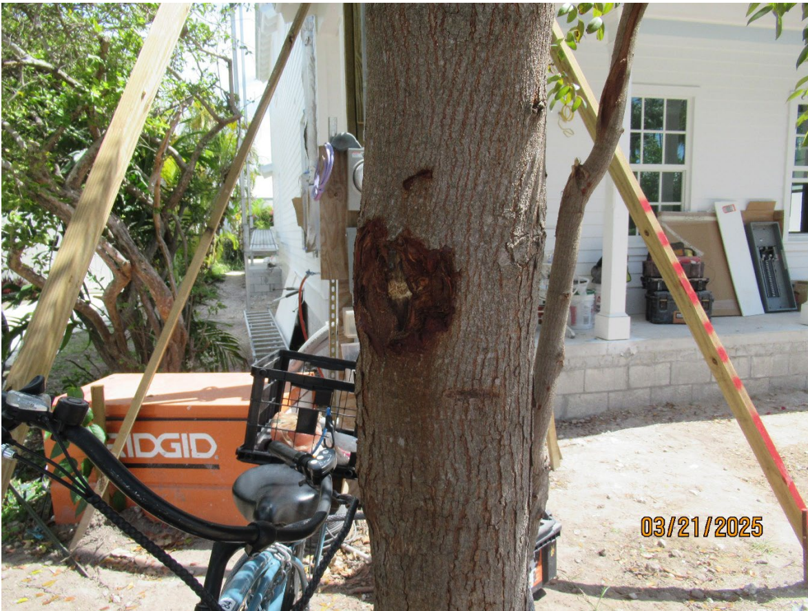
A photo of an injury on the trunk causing possible decay