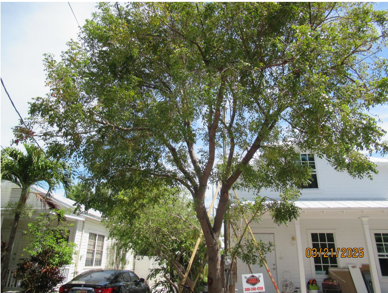
A photo of the tree overall