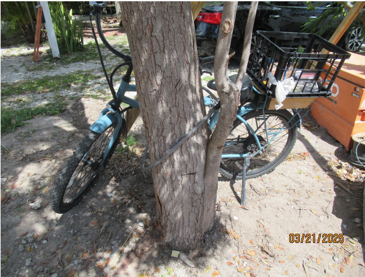
A photo of the base of the tree and a photo of the roots with dark areas