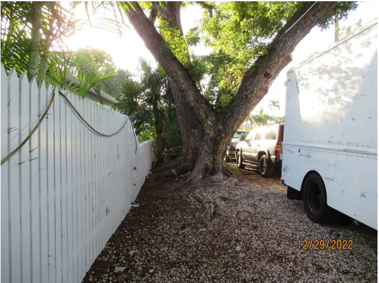
Photo of base of tree, view 1.