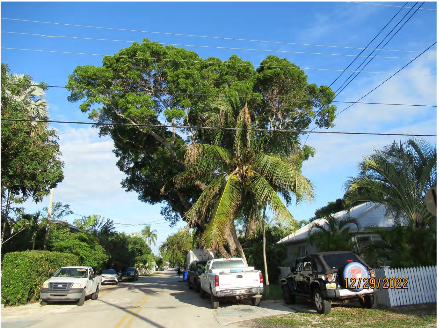
Photo of whole tree showing location.

Tree Species: Mahogany (Swietenia mahagoni)