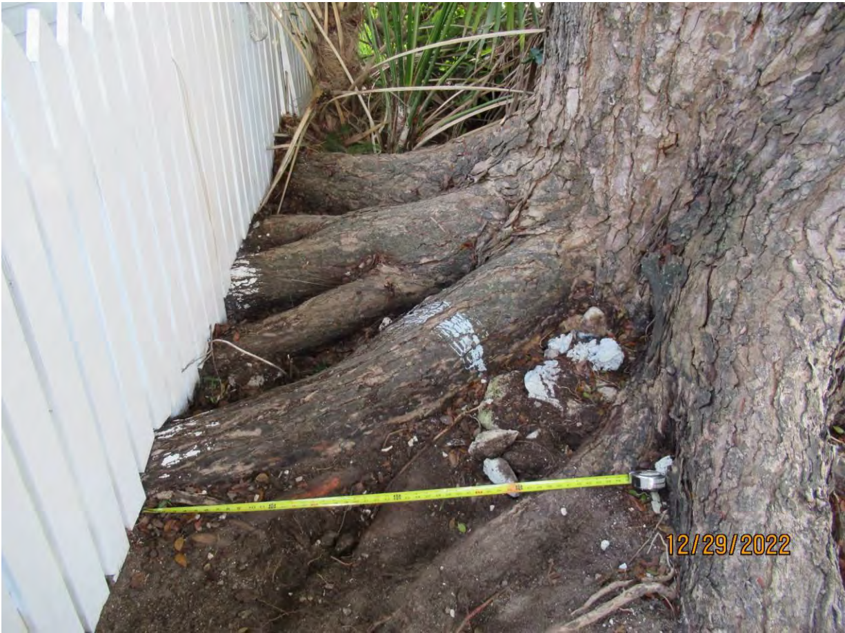
Photo of base of tree, view 3.