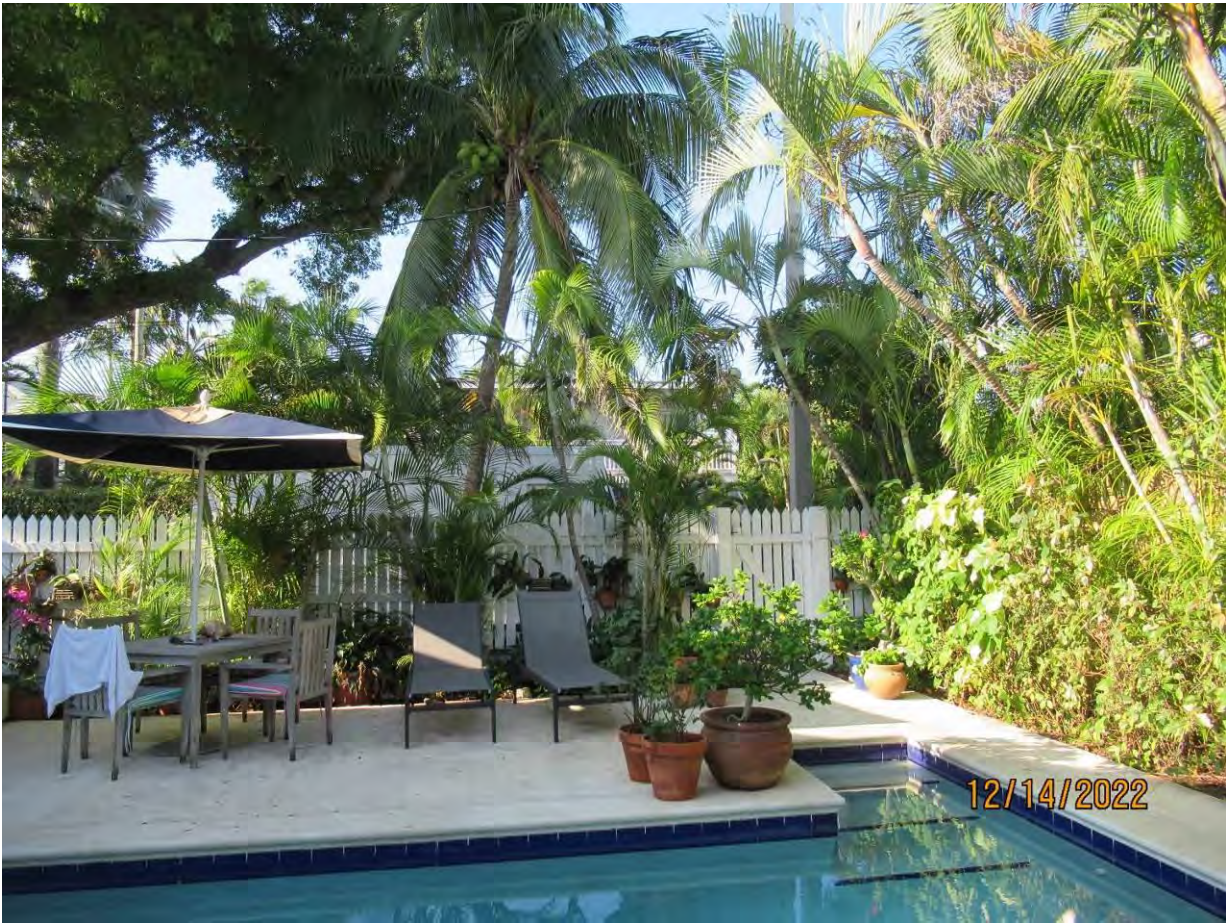
Photo of tree showing location in relation to pool and deck, view 2.