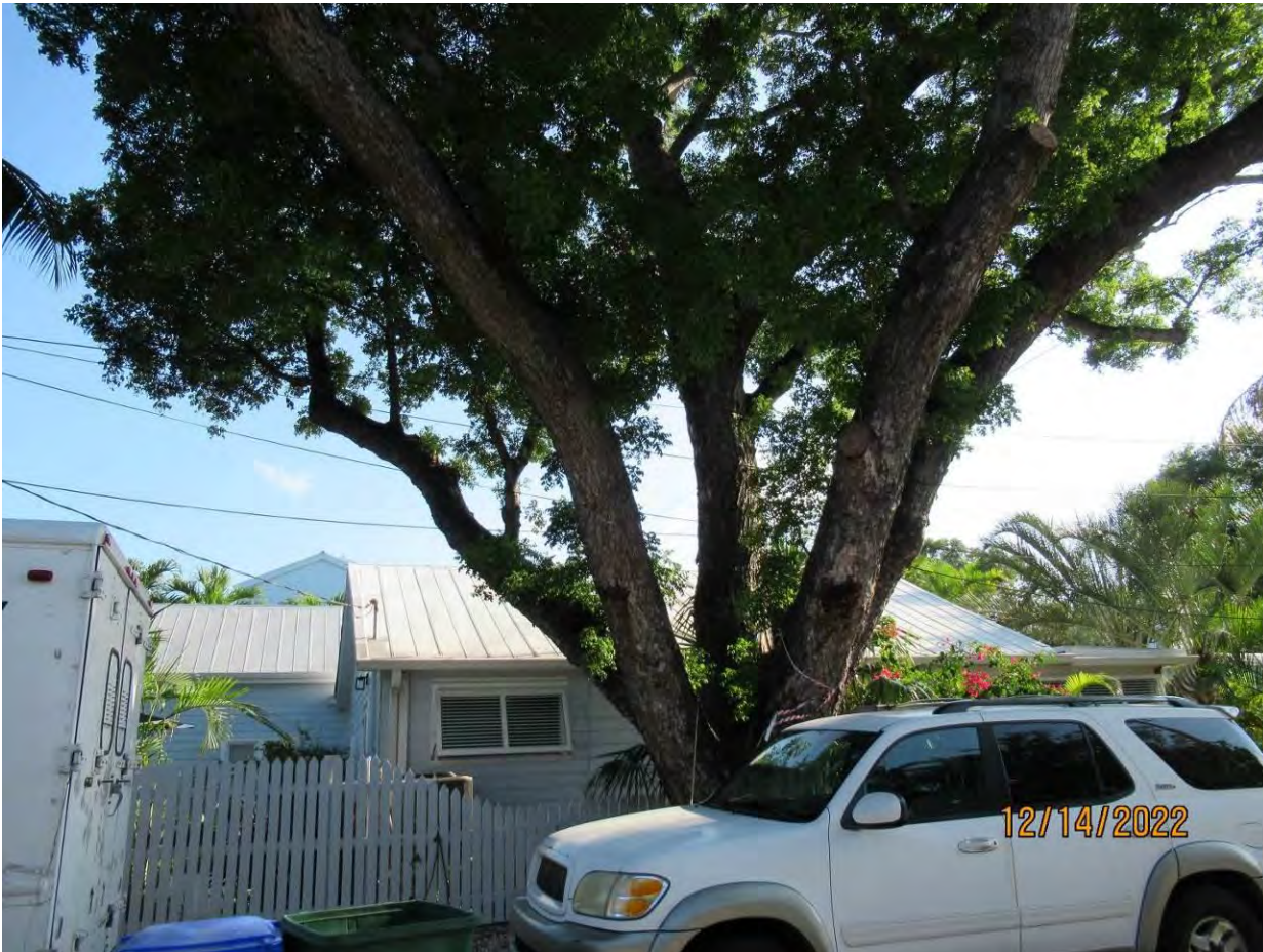
Photo of main canopy branches.