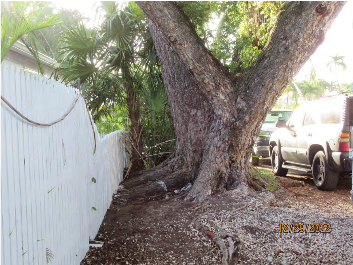
Photo of base of tree, view 2.