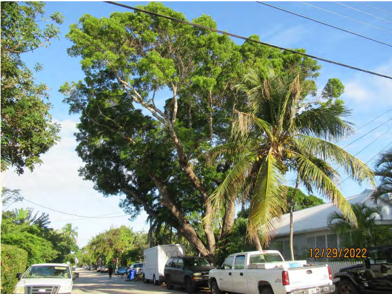
Photo of whole tree.