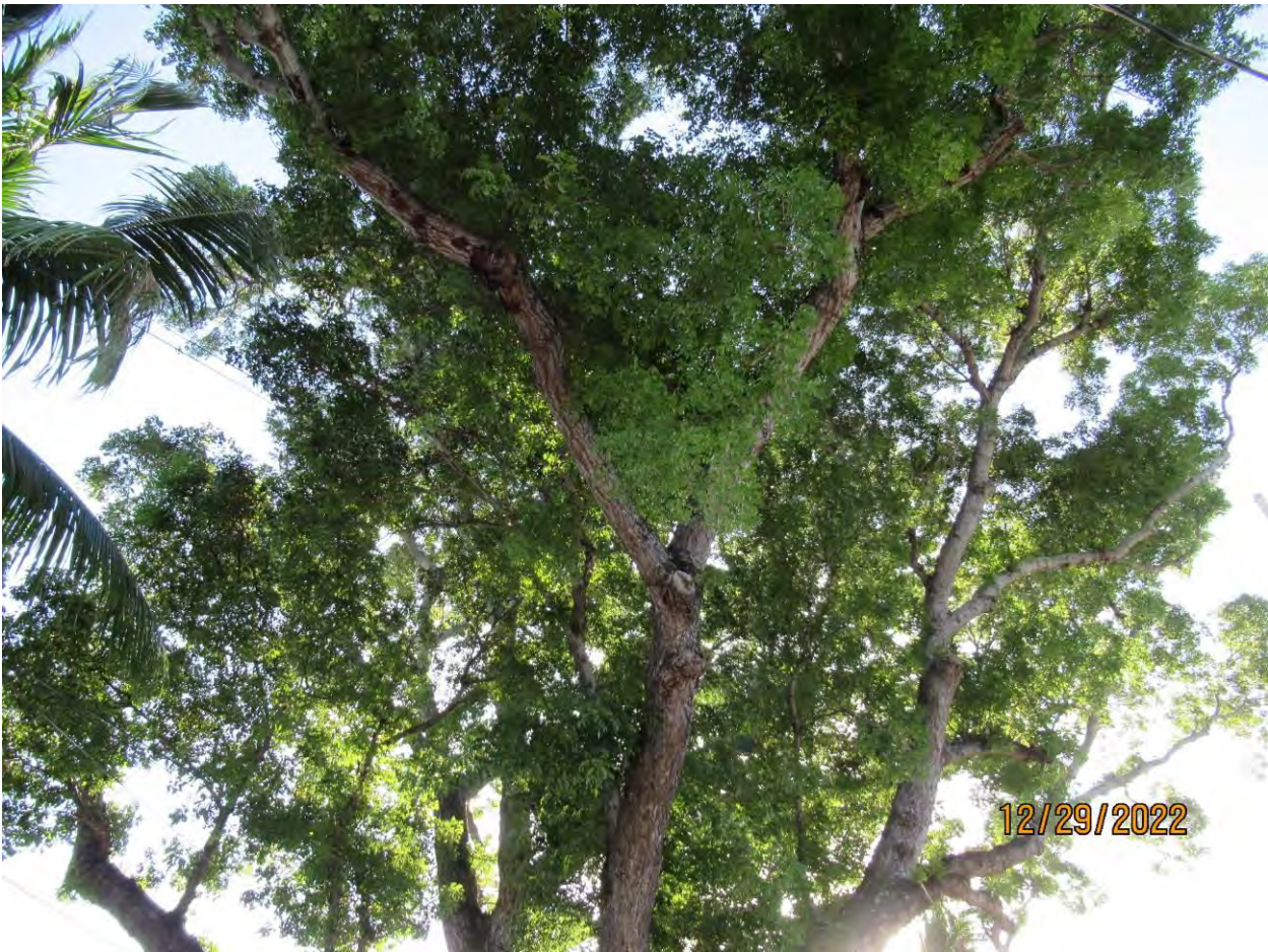
Photo of tree canopy.