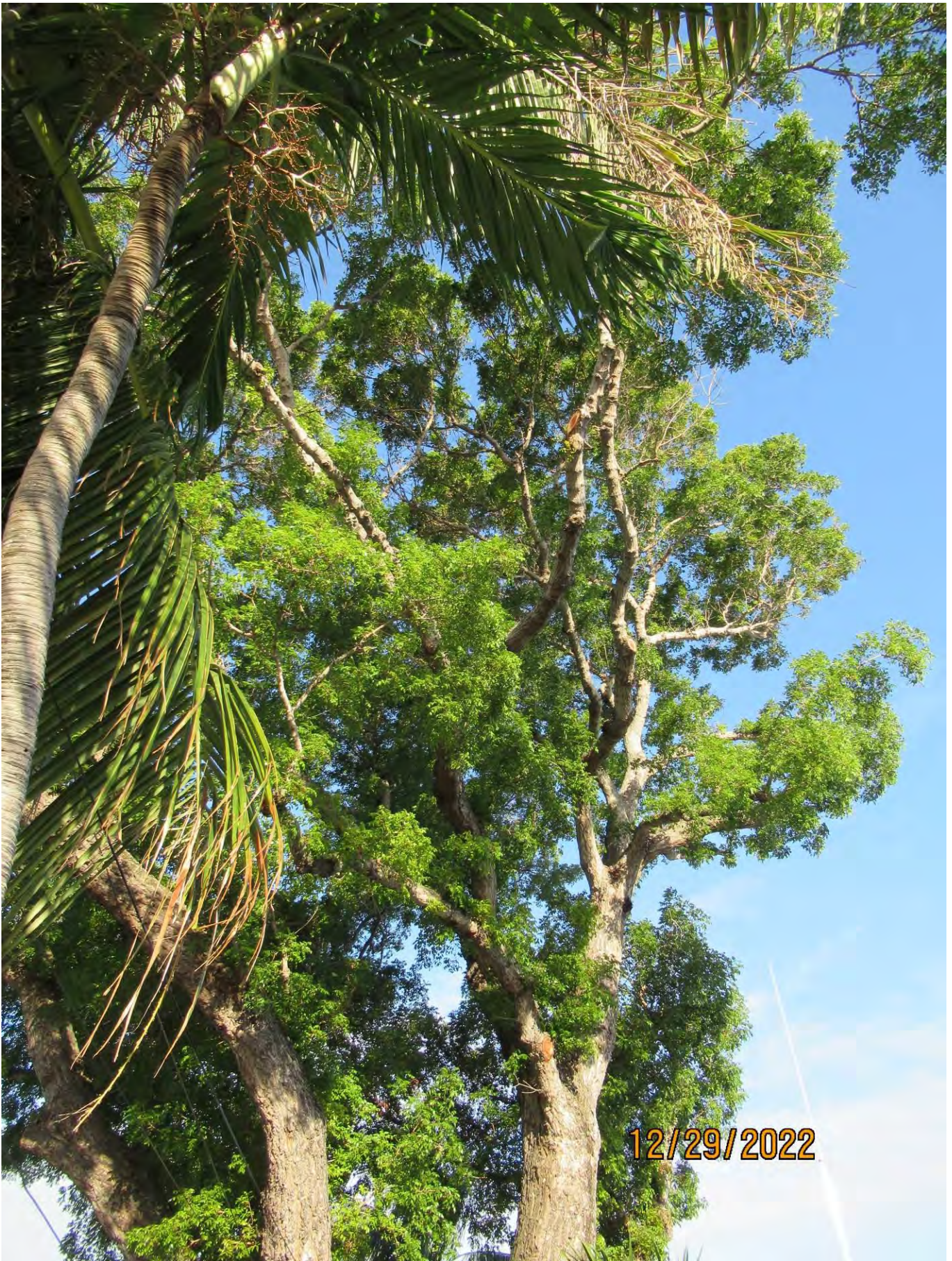
Photo of tree canopy over house.