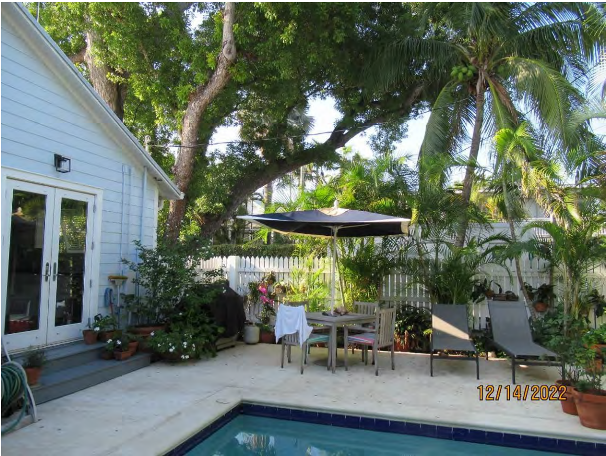
Photo of tree showing location in relation to pool and deck, view 1.