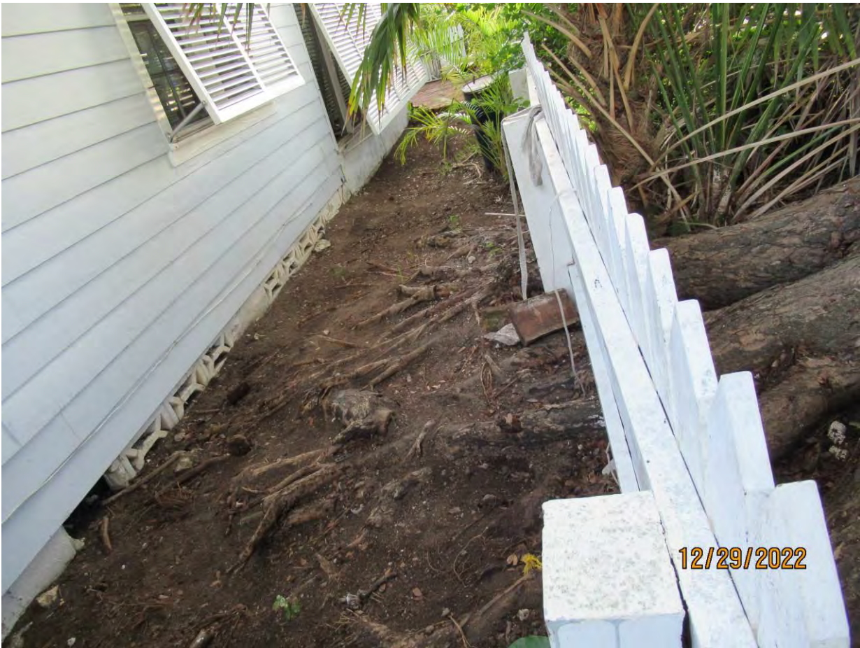
Photos of tree root are next to house. Property owner recently exposed the roots, view 2.