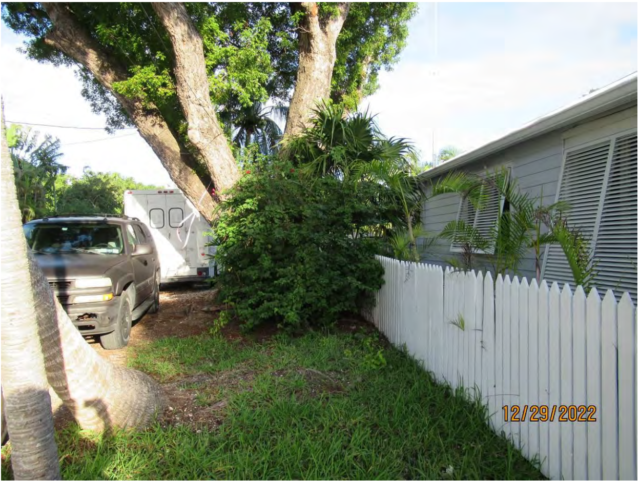
Photo of base of tree and main trunks in relation to house.