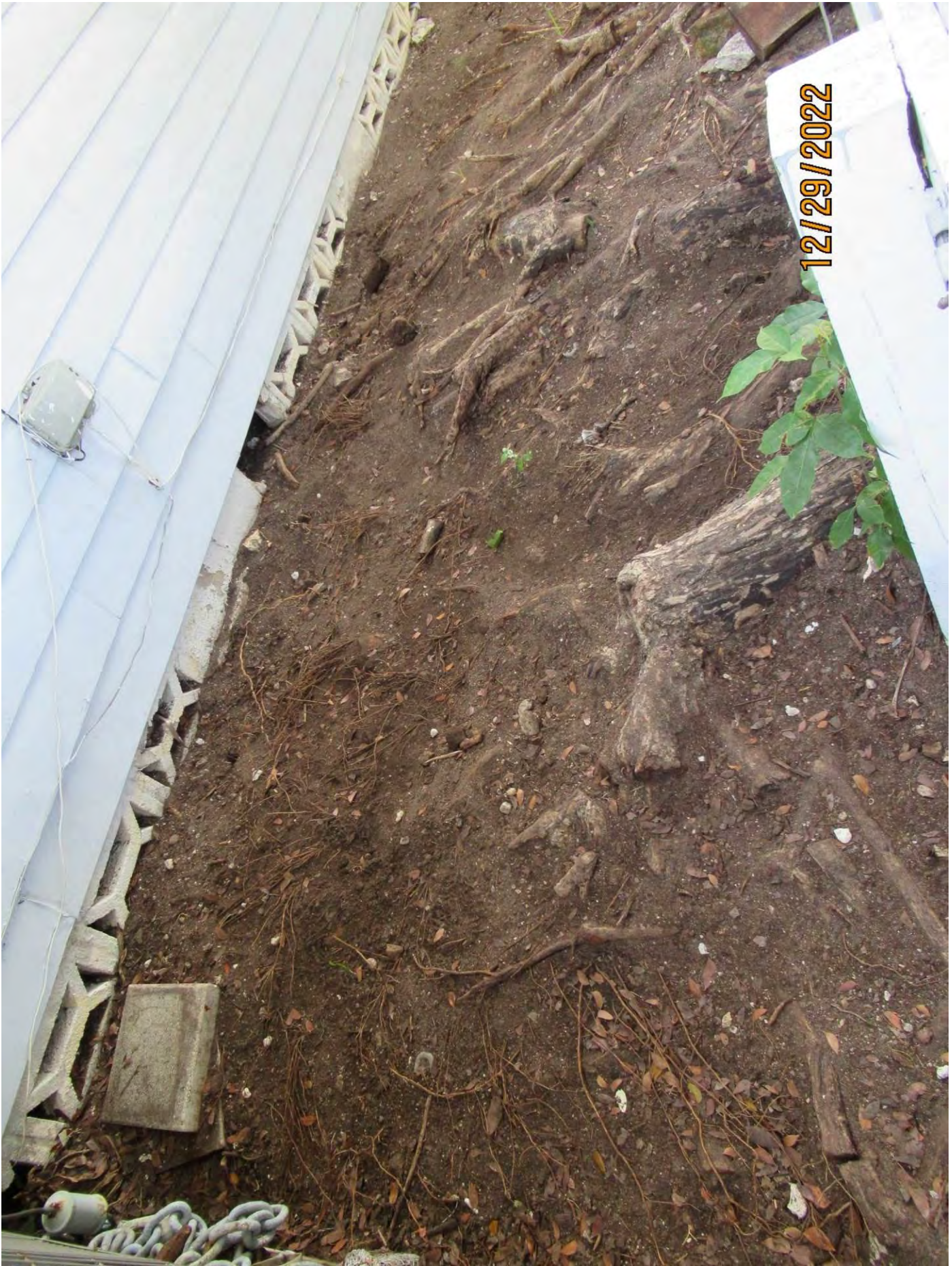
Photos of tree root are next to house. Property owner recently exposed the roots, view 1.