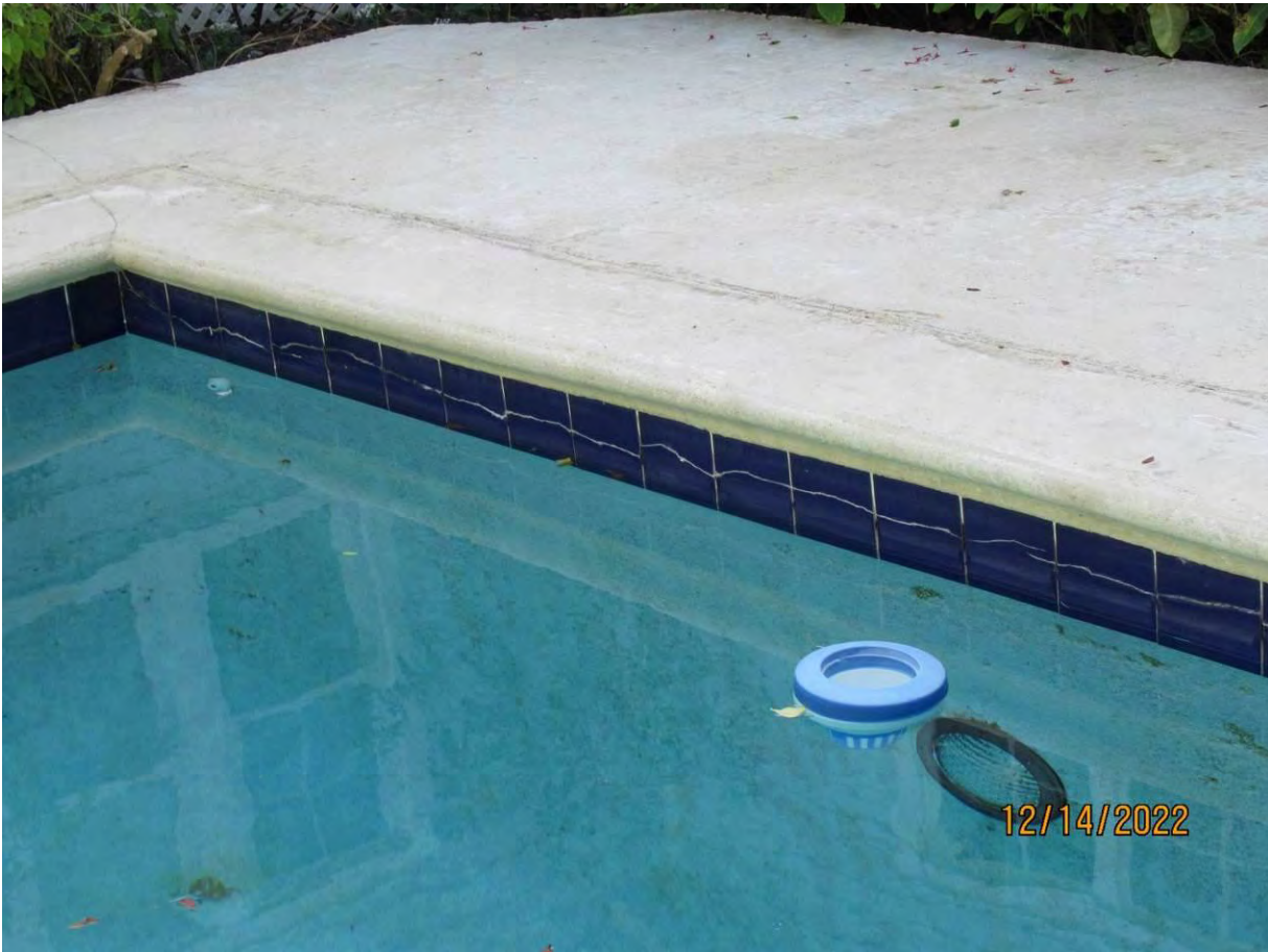
Photo of crack in pool tile closest to house.