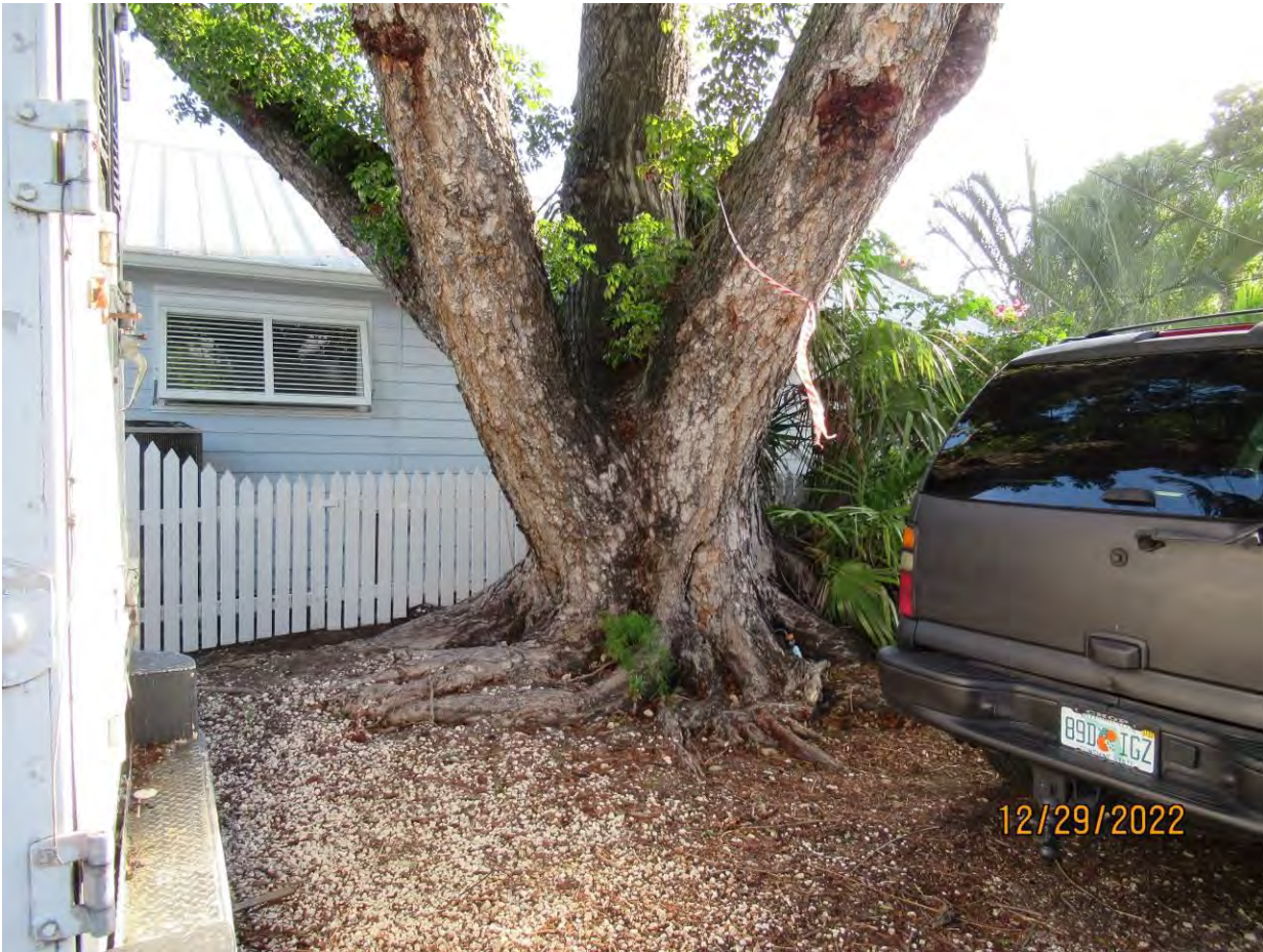
Photo of base of tree and main trunks.