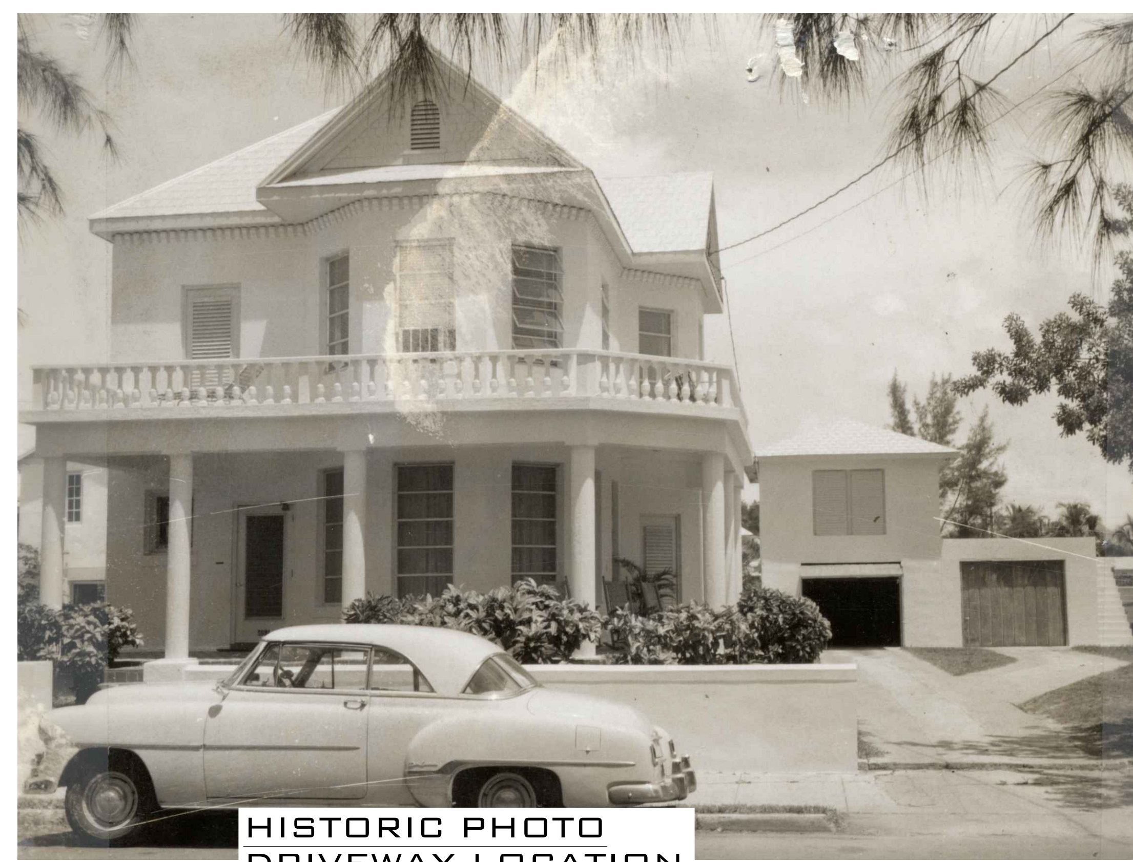
HISTORIC PHOTO DRIVEWAY LOCATION

CONSUMPTION AREA & BAR: 10 BAR SEATS (8 REGULAR + 2 ADA) 10 SEATS * 15SQ.FT. = 150 SQ.FT. PRE-EXISTING CONSUMPTION AREA (HOTEL BREAKFAST): 24 SEATS 24 SEATS * 15SQ.FT. = 360 SQ.FT. OFF-STREET PARKING REQUIREMENT: SEC. 108-572. HOTEL (1327 DUVAL ST): 10 TRANSIENT ROOMS HOTEL (407 SOUTH ST): 3 TRANSIENT UNITS + 1 NON TRANSIENT 14 CAR SPACES + 5 BIKE (35%) PROPOSED BAR 1 PARKING FOR 45 SQ.FT OF CONSUMPTION AREA 3 CAR SPACES + 1 BIKE (25%) EXISTING 24 SEATS - 360 SQ.FT. CONSUMPTION AREA 8 CAR SPACES + 2 BIKES (25%) TOTAL REQUIRED: 25 CAR SPACES + 8 BIKE RACKS TOTAL PARKING PROVIDED: 15 CAR SPACES (INCLUDING 1 ADA) 6 BIKE RACKS, 4 SCOOTER SPACES F.A.R. CALCULATION: REQUIRED MAXIMUM 1.0 (14,556.09 SQ.FT.) EXISTING 0.39 (5,660.0 SQ.FT.) PROPOSED NO CHANGES